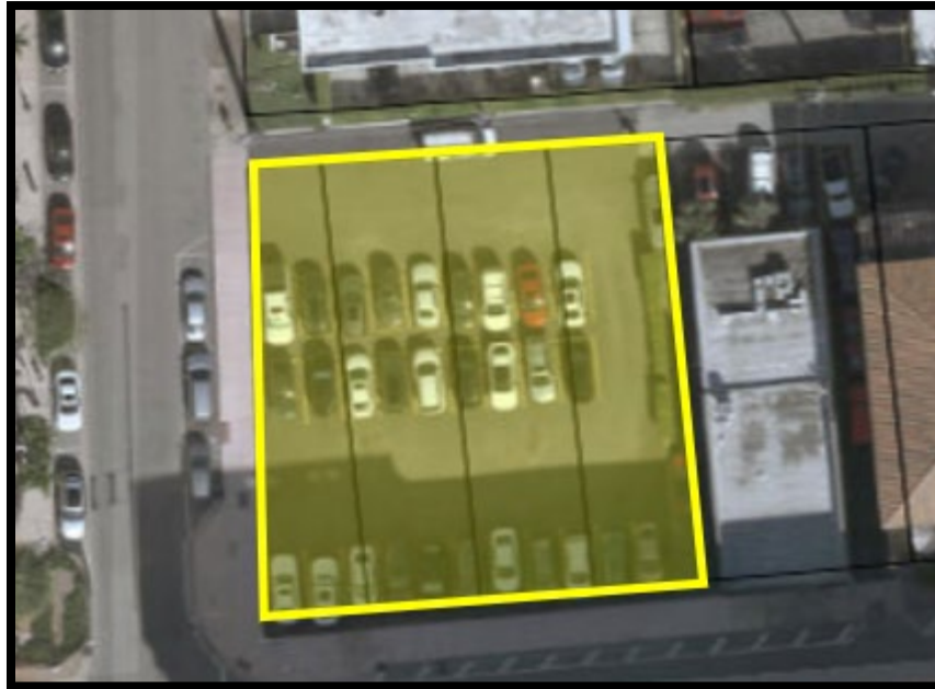
Image: Property Aerial View

The Property is currently designated Commercial Medium-Rise Intensity pursuant to the City's Future Land Use Map (FLUM). Additionally, the Property is zoned Mixed-Use 2 (MX2) and is located within the Central Business District (CBD) on the City's Zoning Map as reflected in the images below.