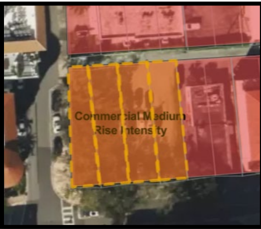
Image: Property FLUM Designation

The Property is currently designated Commercial Medium-Rise Intensity pursuant to the City's Future Land Use Map (FLUM). Additionally, the Property is zoned Mixed-Use 2 (MX2) and is located within the Central Business District (CBD) on the City's Zoning Map as reflected in the images below.