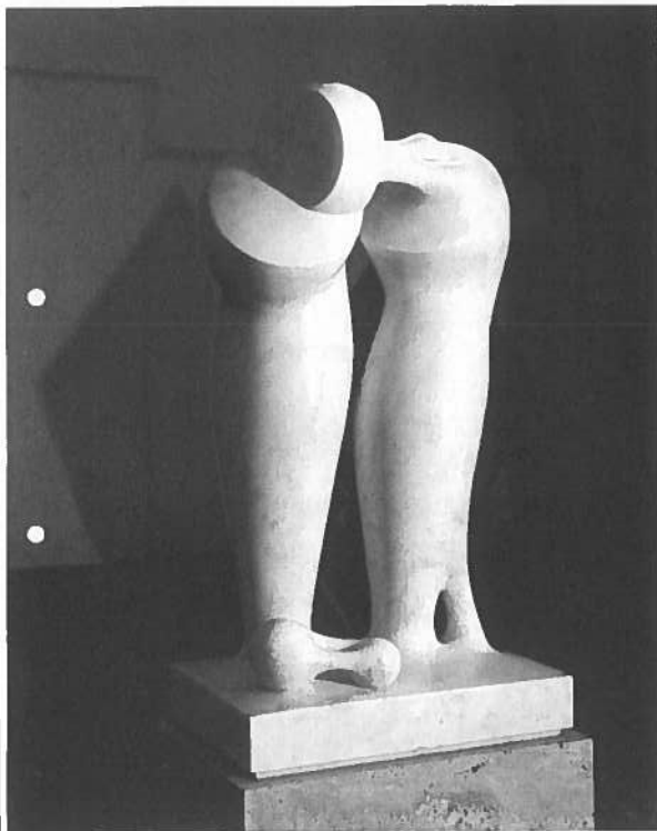
AGUSTIN CARDENAS Le Couple Marmor bianco de Carrara 150 x 88 x 62 CM 1989 BASE: Marmor Travertino, 40.5 x 87 x 64.5 CM

1646 SW 8th St Miami, FL 33135 · Ph. 305.989.9085