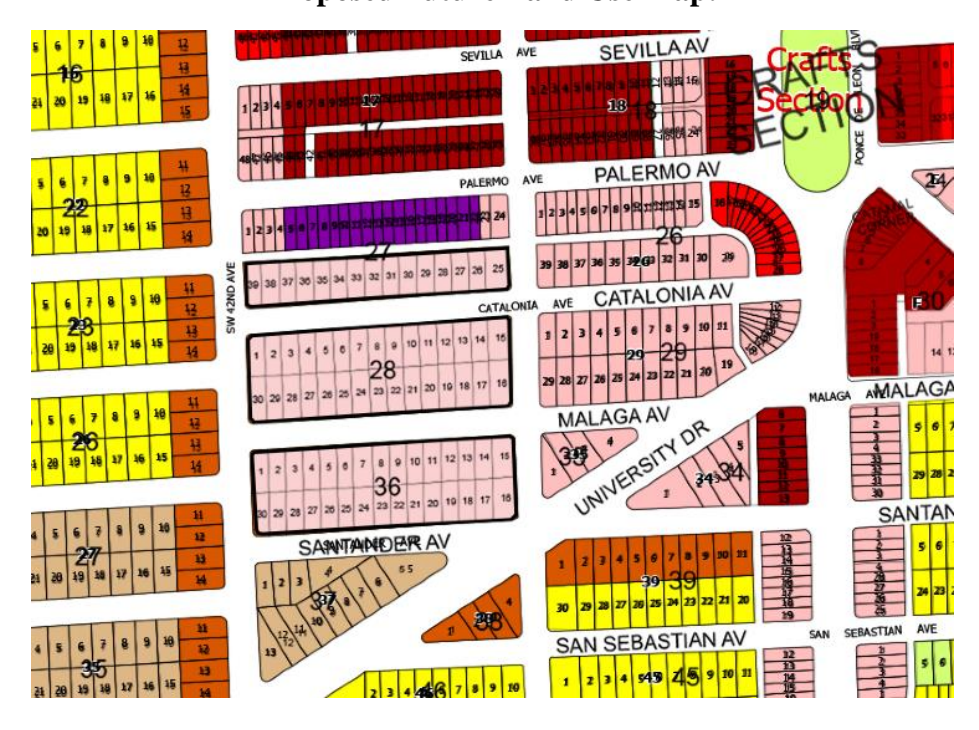
Page 4 of 4 - Ordinance No.