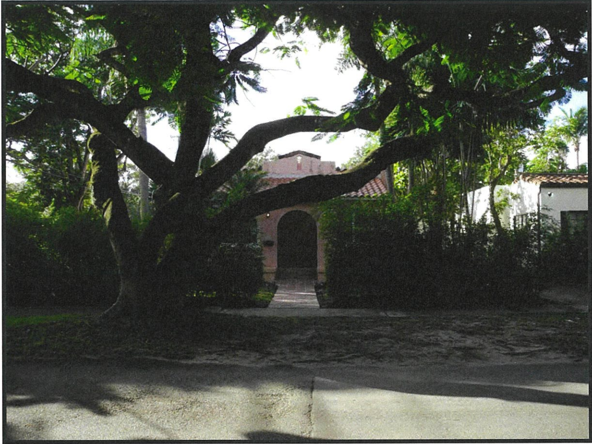
800 Majorca Avenue – Neighbor to the South East across the street