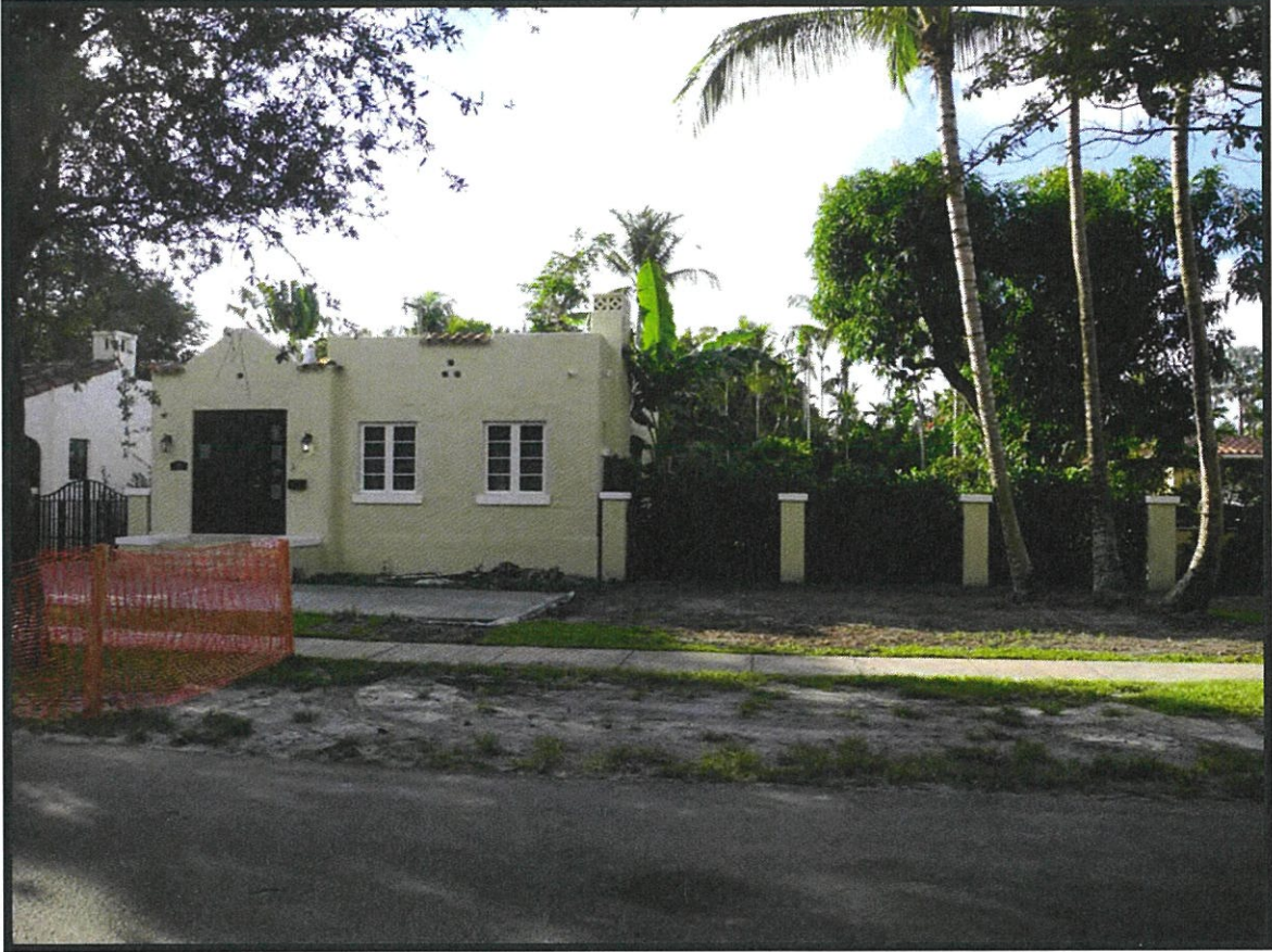
808 Majorca Ave – Neighbor to the South West across the street