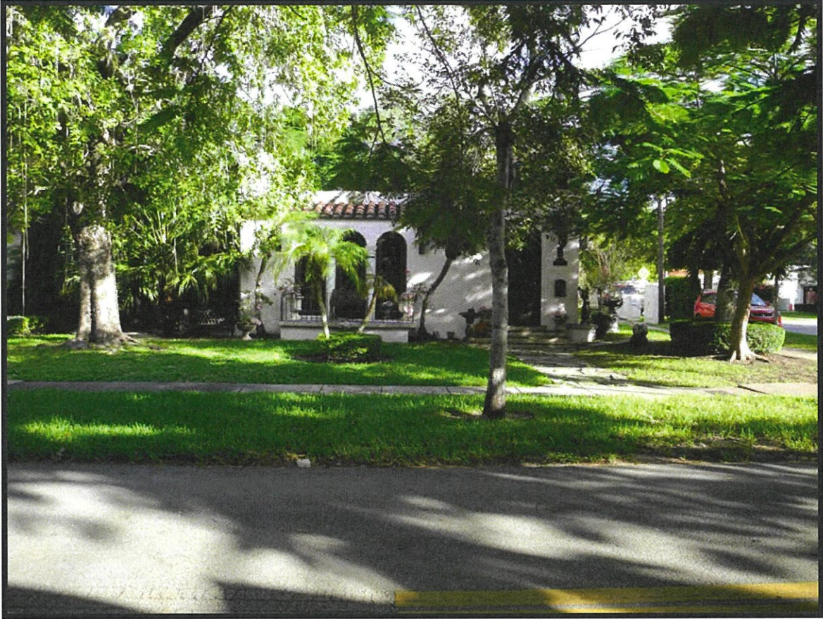
801 Majorca Avenue – Neighbor to the East