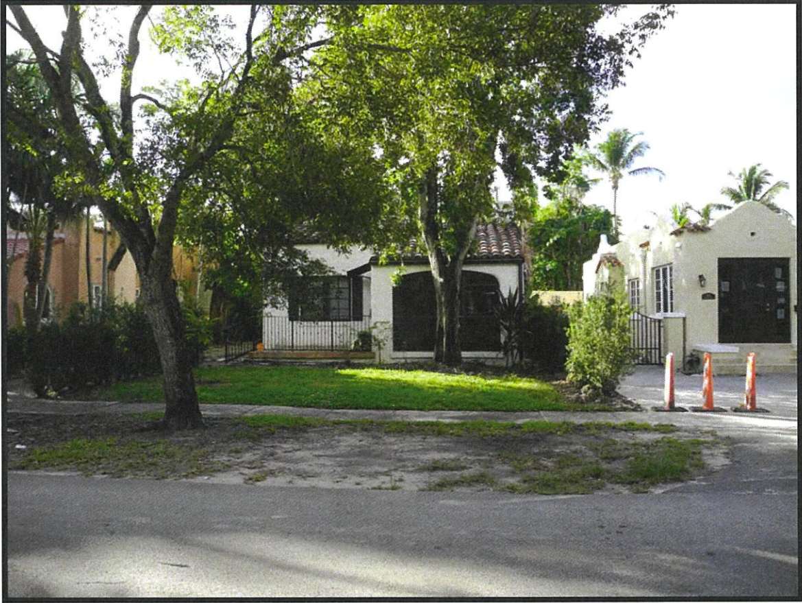
804 Majorca Avenue – Neighbor to the South across the street