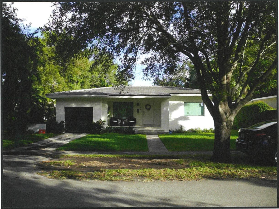
811 Majorca Ave – Neighbor to the West