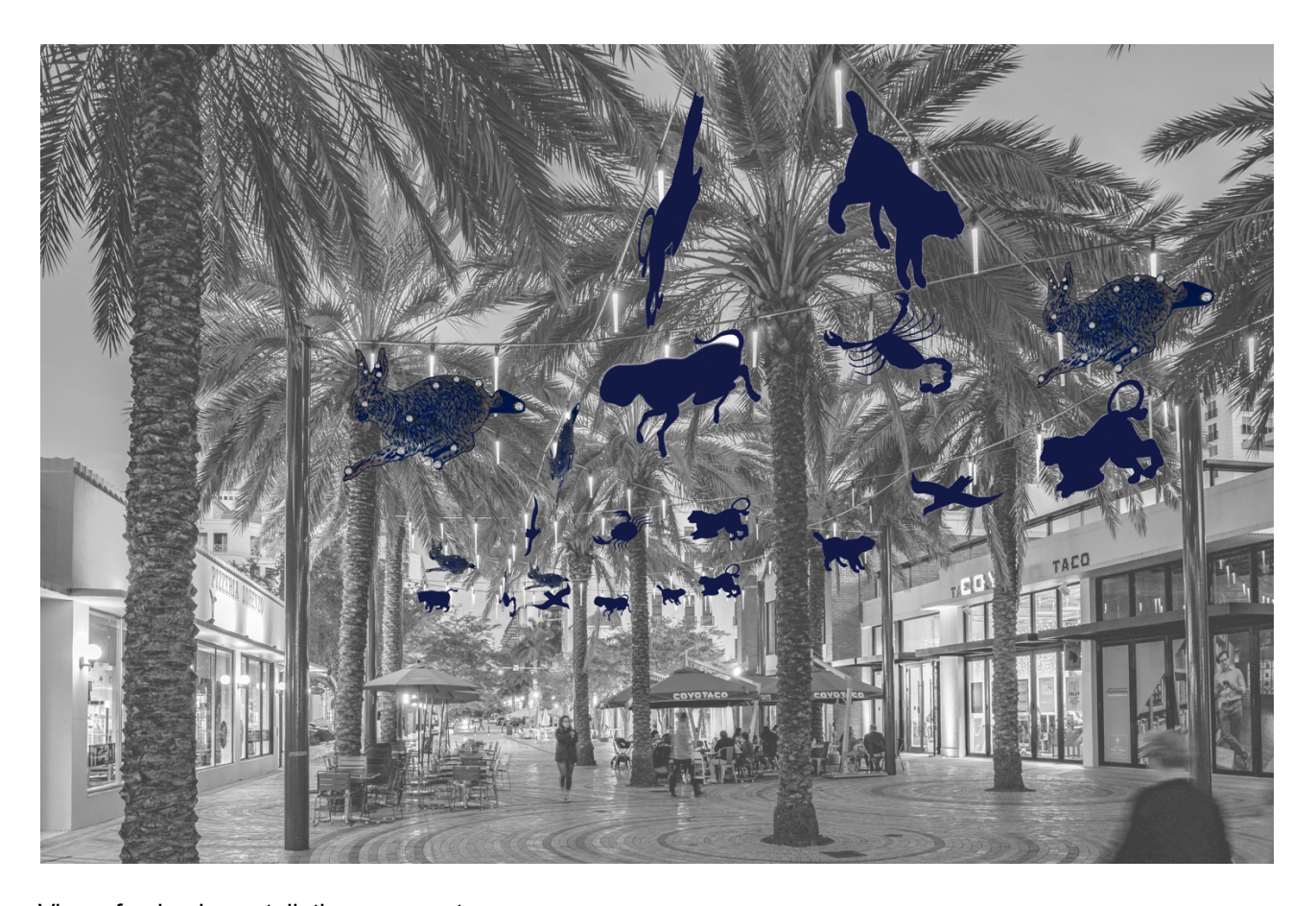
View of animal constellations concept