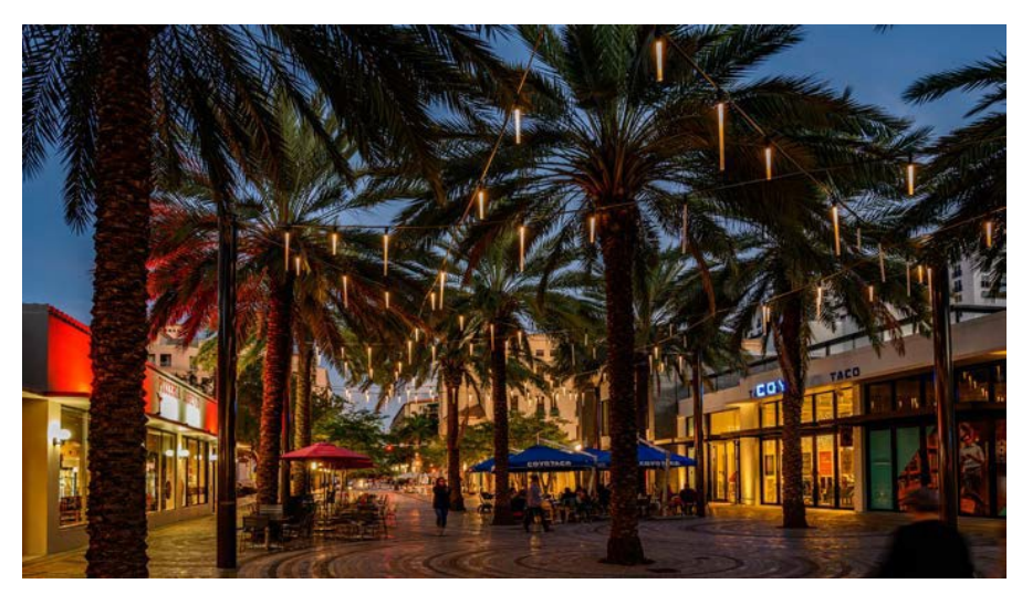
Photo of existing condition. Icicle lights to be changed with smaller bulbs to appear as stars.

In recognizing that downtown Coral Gables is surrounded by amazing nature, she wants to bring animals into the town through her constellations. Her work often comments on environmental stewardship and one's relationship with nature. She hopes that viewers will begin to see themselves differently as well as their town by transforming Giralda Plaza with the 42 unique artworks hung in tandem. They are made from dark blue transparent plexiglass sheets with permanent vinyl drawings bonded to the surface. These figures will also incorporate Swarovski crystals which will be embedded on both sides relating to stars and constellation patterns they suggest.