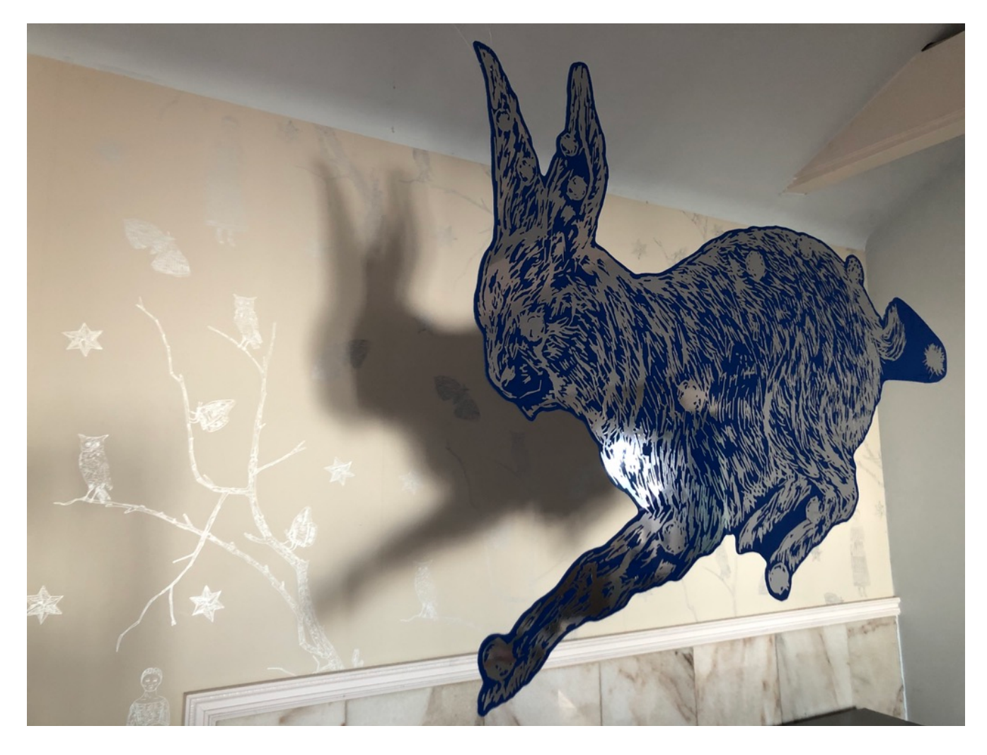
Prototype: View of animal constellations with mirrored drawing