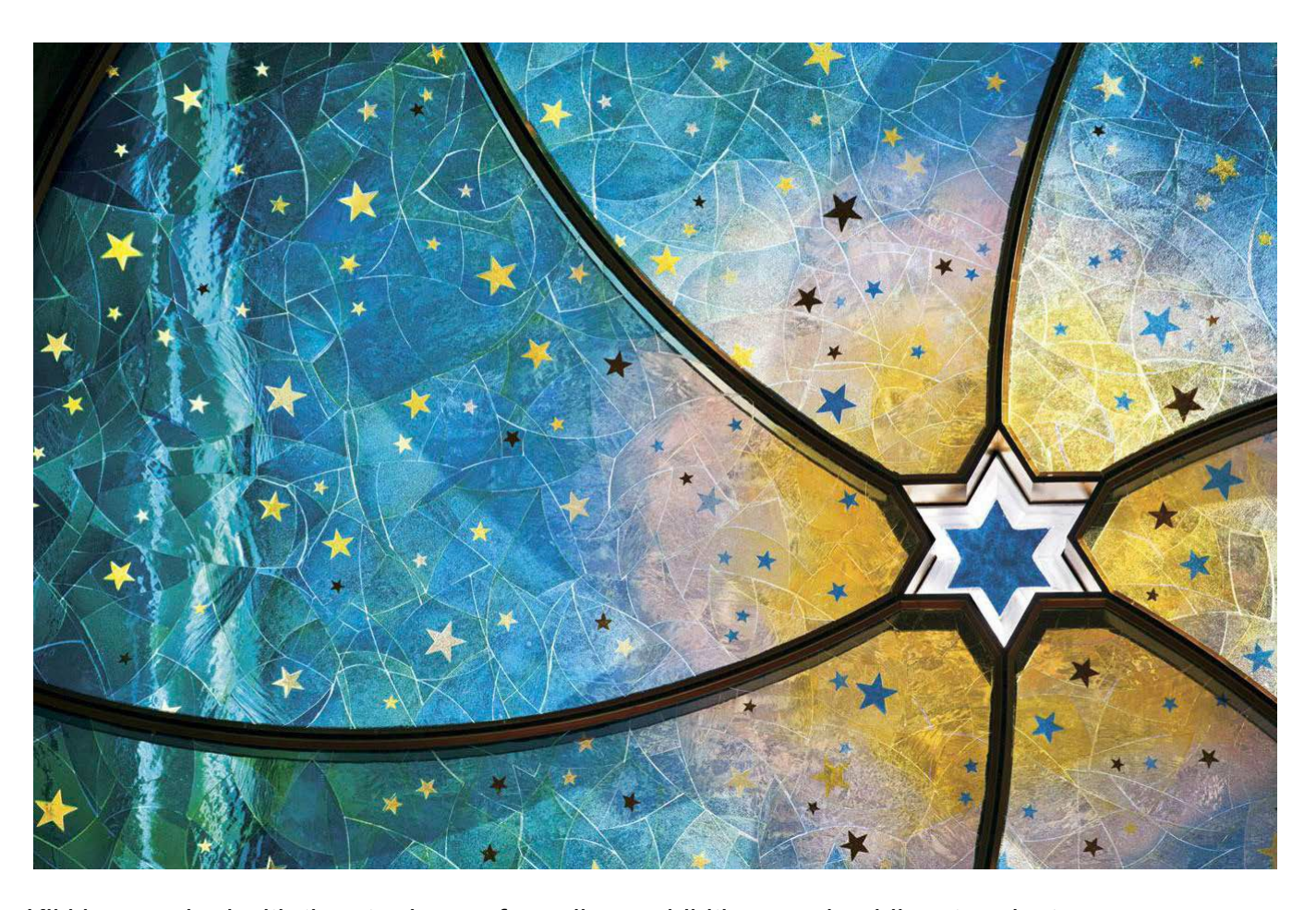
Kiki has worked with the star image for gallery exhibitions and public art projects.