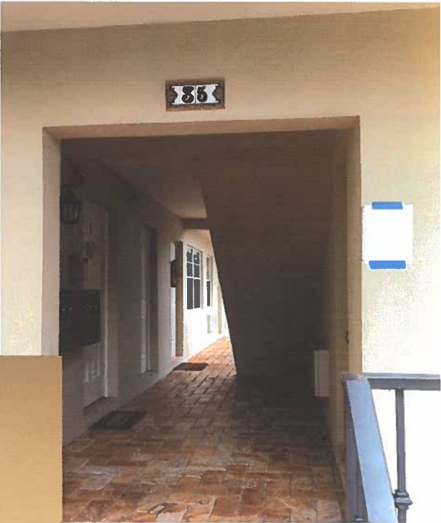
35 ANTILLA AVENUE