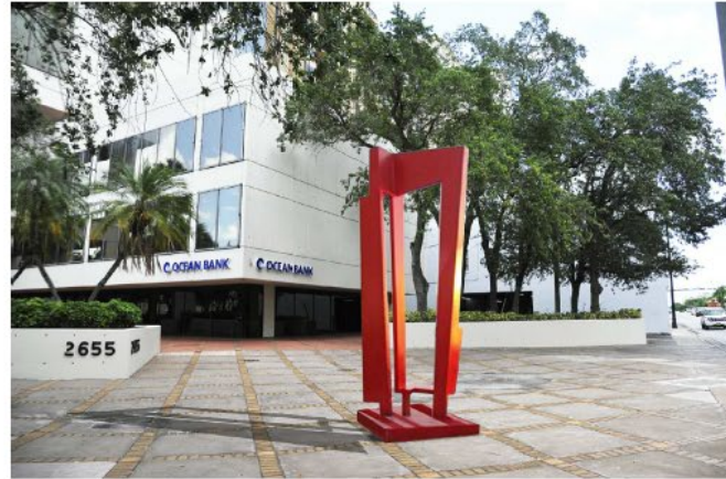
2 NORTH VIEW OF PLAZA A101 SCALE: NOT TO SCALE