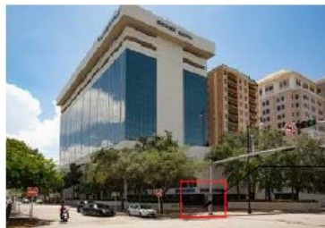
LOCATION OF SCULPTURE