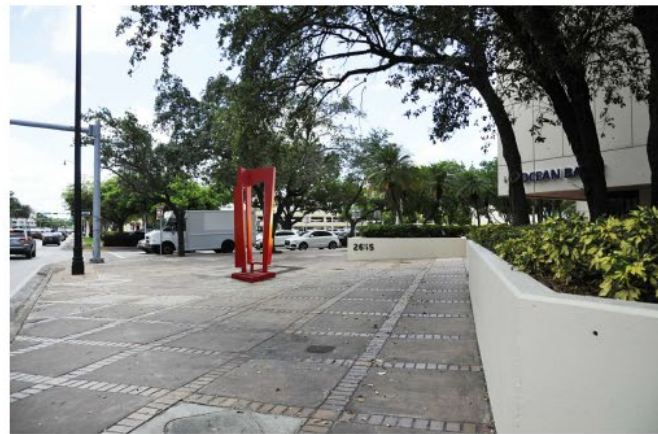
4 SOUTH VIEW OF PLAZA A101 SCALE: NOT TO SCALE

SCULPTURE INFORMATION ARTIST: CARLOS ALBERT ANDRES TITLE: "MARCO DE LO INVISIBLE" TECHNIQUE: PAINTED CORTEN STEEL SIZE: 157,48" X 59" X 32,6 " YEAR: 2019