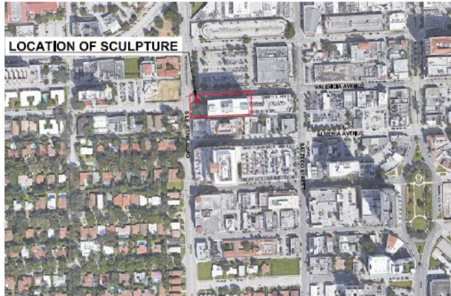
1 VICINITY MAP A101 SCALE: NOT TO SCALE