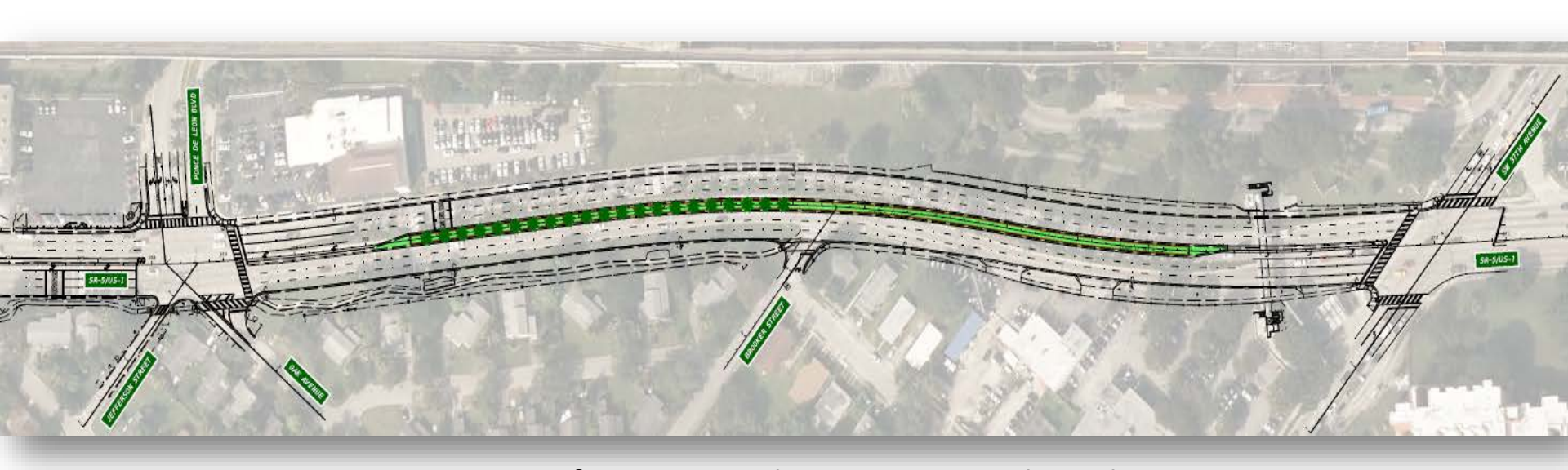
US-1 from Ponce de Leon to Douglas Rd