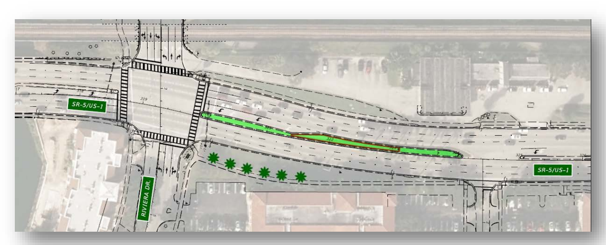
US-1 at Riviera Drive