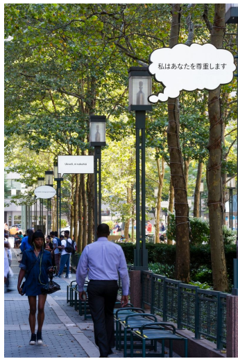
"The Truth Is..." 2015, Installation at MetroTech Commons, Brooklyn, NY