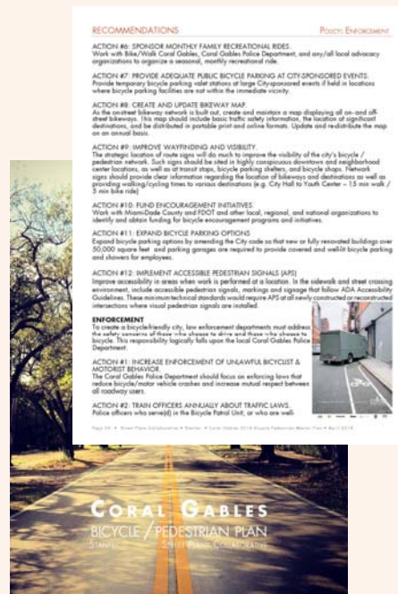
Bicycle Master Plan