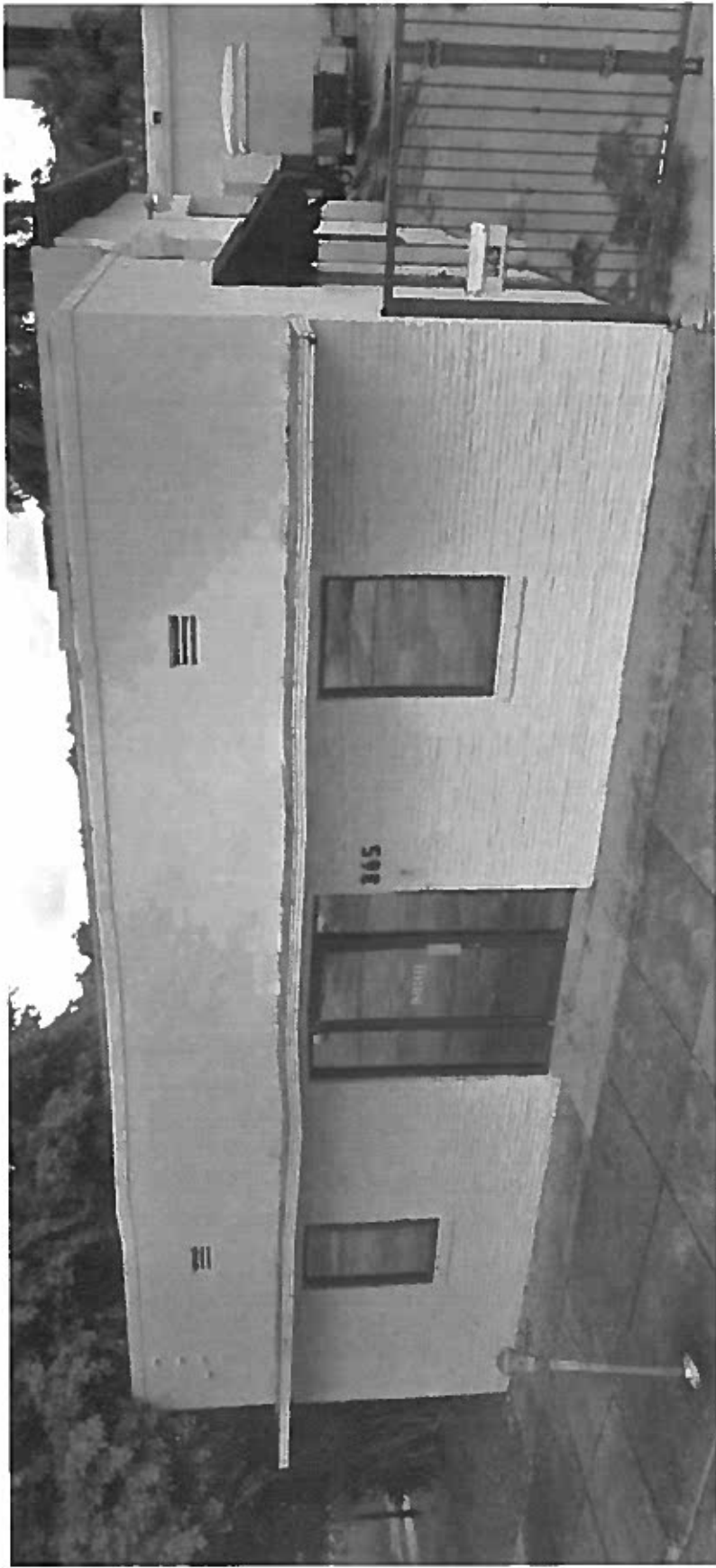
365 Greco Ave