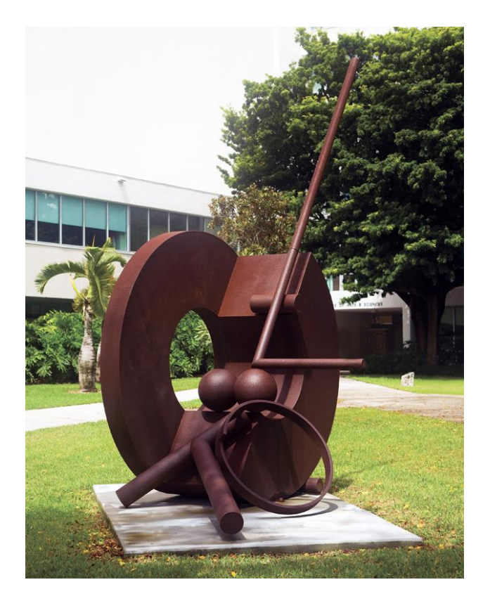
Fletcher Benton, Donut with Balls Number 28