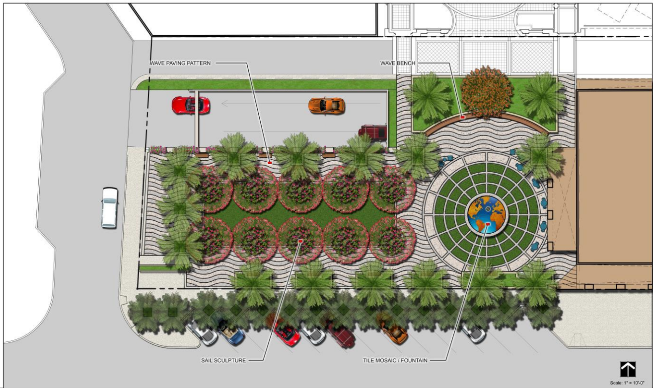
Site Plan of Proposed Plaza