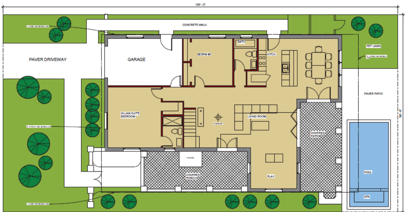
FIRST FLOOR PLAN ABOVE

The quantity of first floor SF is 1,530 (unfinished garage not included), and second floor is 1,430 SF (open terraces not included). Therefore, the FAR (floor area ratio) proposed is 2,960 SF divided by 5,000 = .592