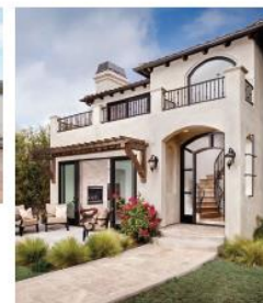
ROOF TERRACE & FINISHES CHARACTER EXAMPLE