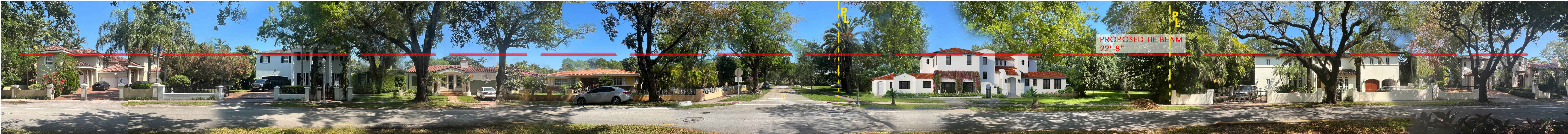
ALHAMBRA CIRCLE CONTEXTUAL VIEW - PROPOSED