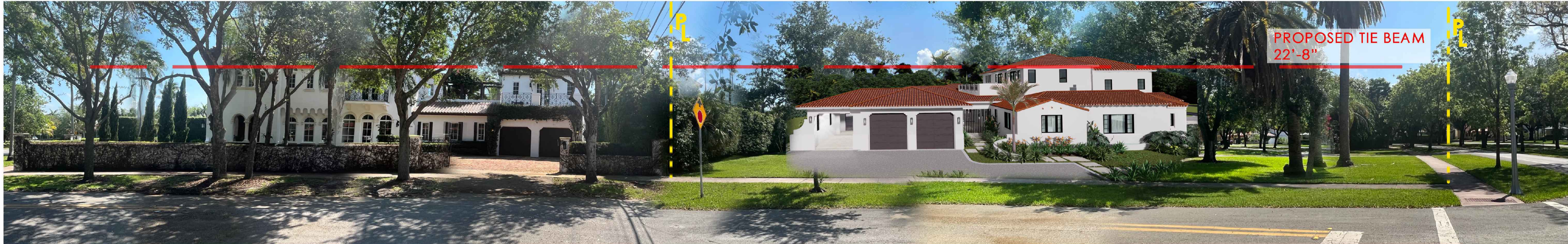
GREENWAY COURT CONTEXTUAL VIEW - PROPOSED