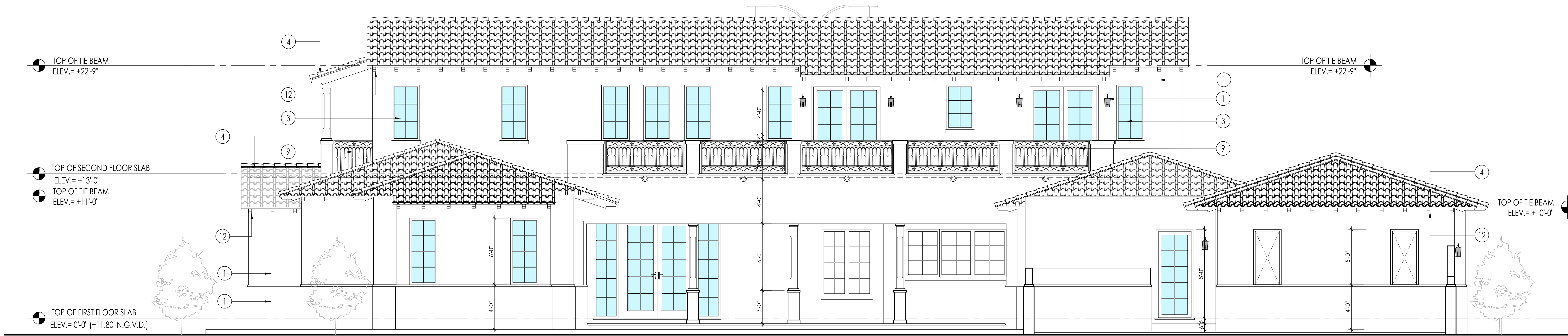
PROPOSED SOUTHEAST SIDE ELEVATION SCALE: 1/4" = 1'-0"