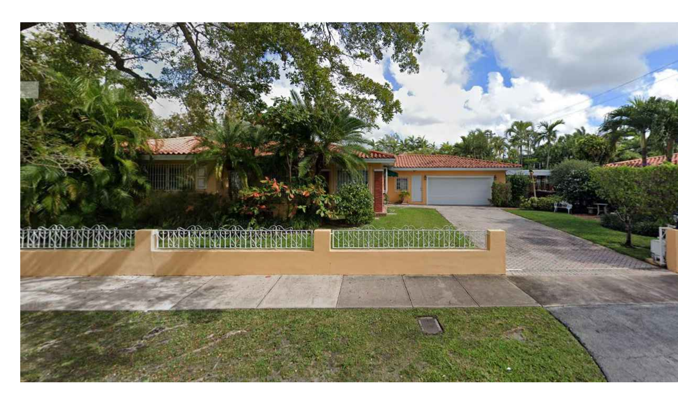
NEIGHBORS' HOUSE ON THE FRONT