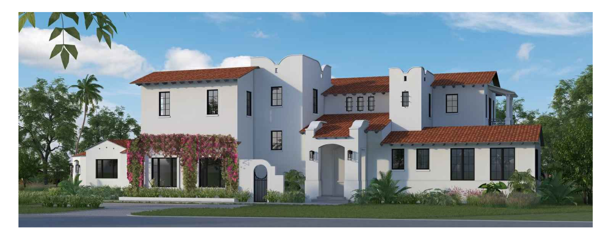
PROPOSED DESIGN ALHAMBRA FRONT