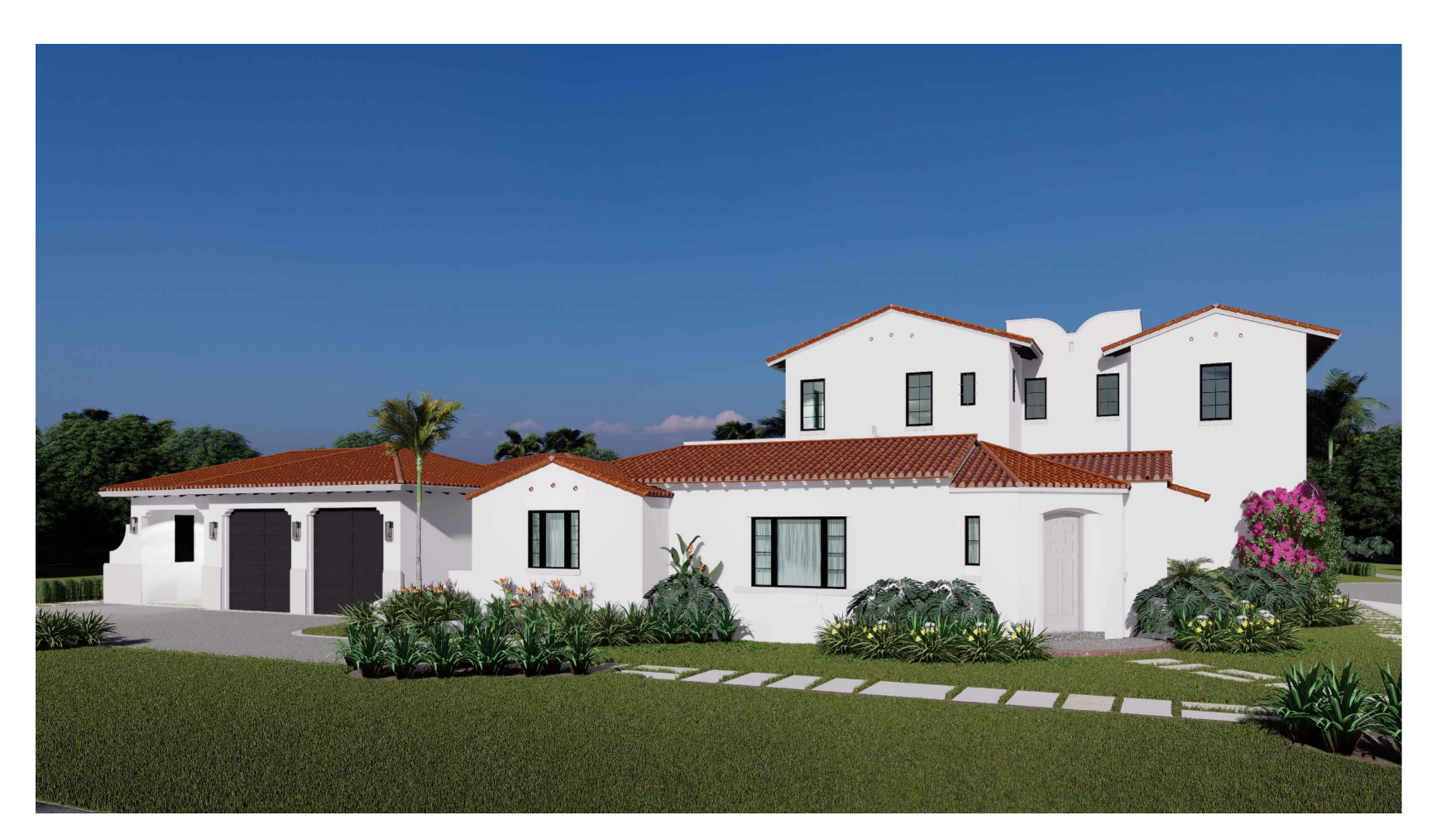
PROPOSED DESIGN GREENWAY FRONT