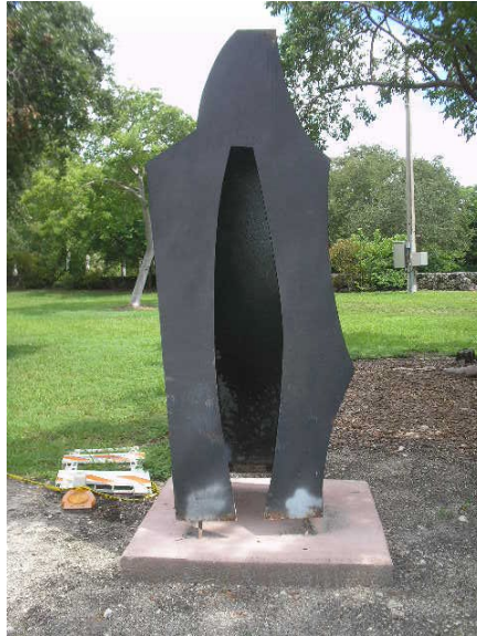
At time of acquisition