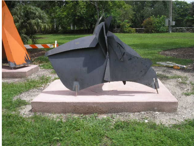
At time of acquisition