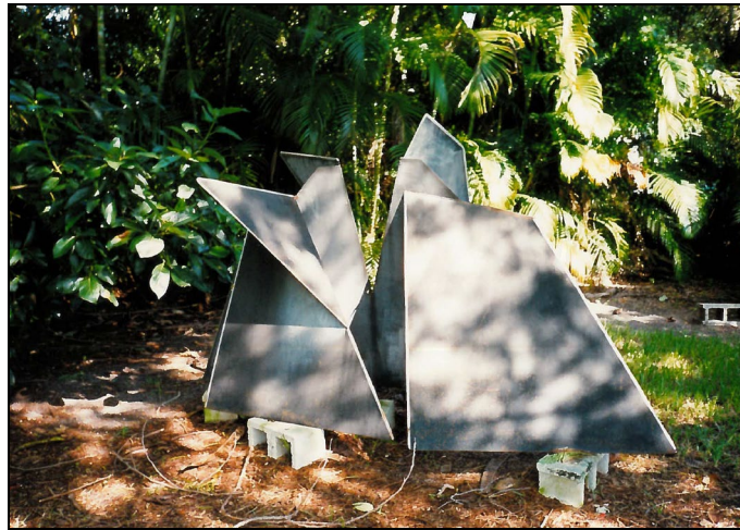
At time of acquisition