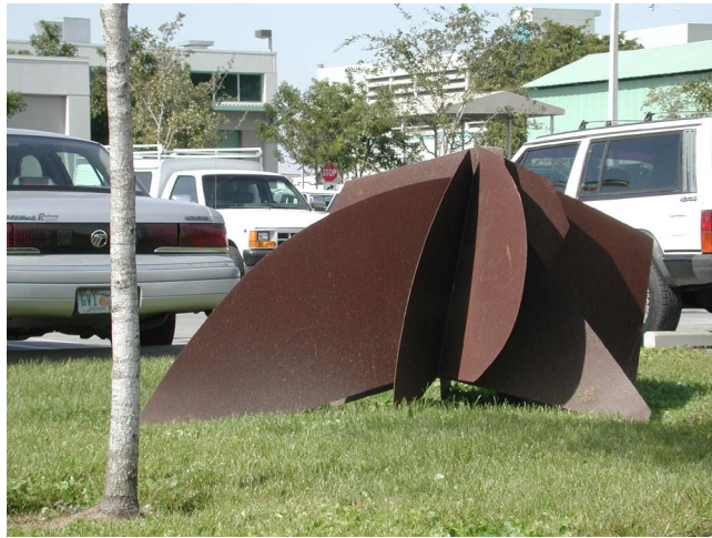
At time of acquisition