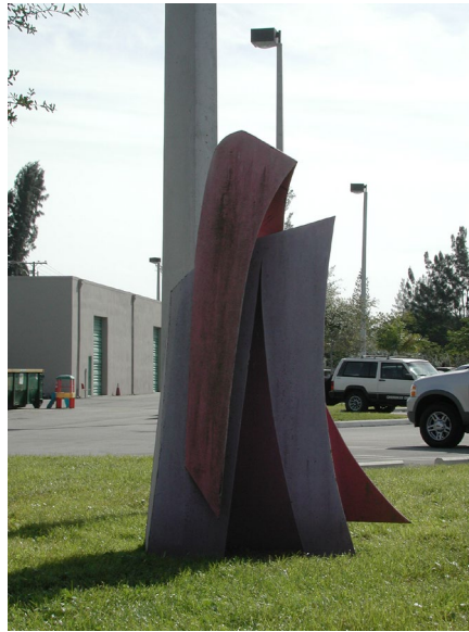
At time of acquisition