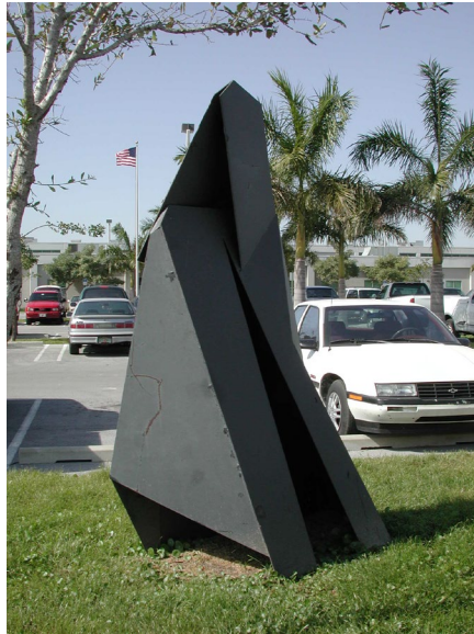
At time of acquisition