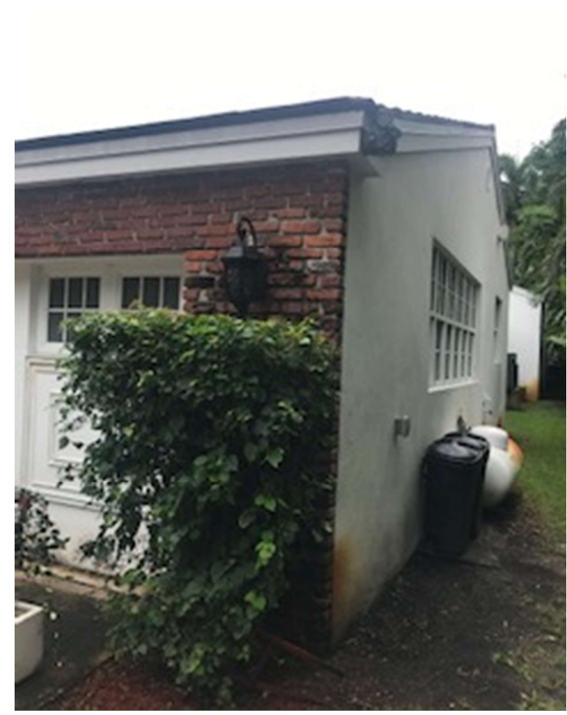
Before – left, After - right