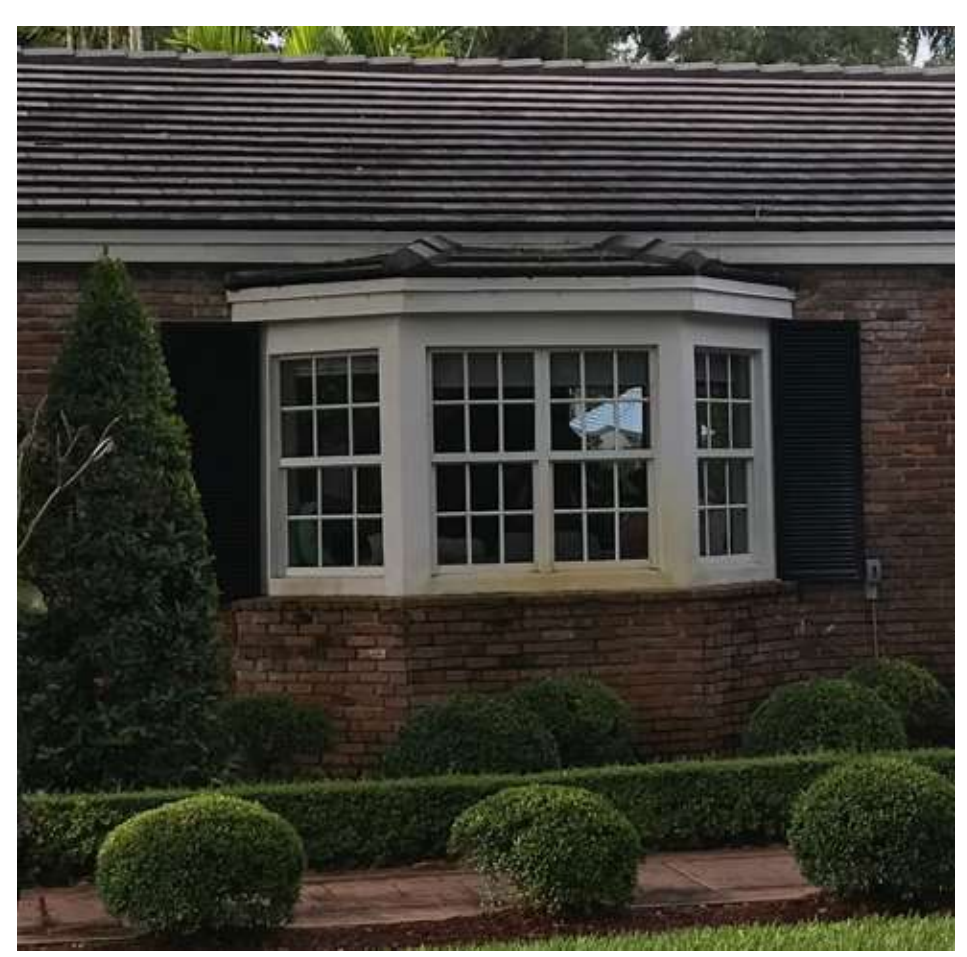
Before – left, After - right