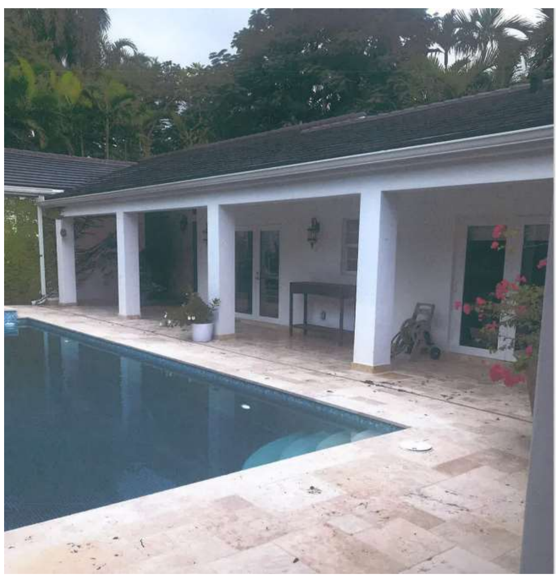
Before – left, After - right