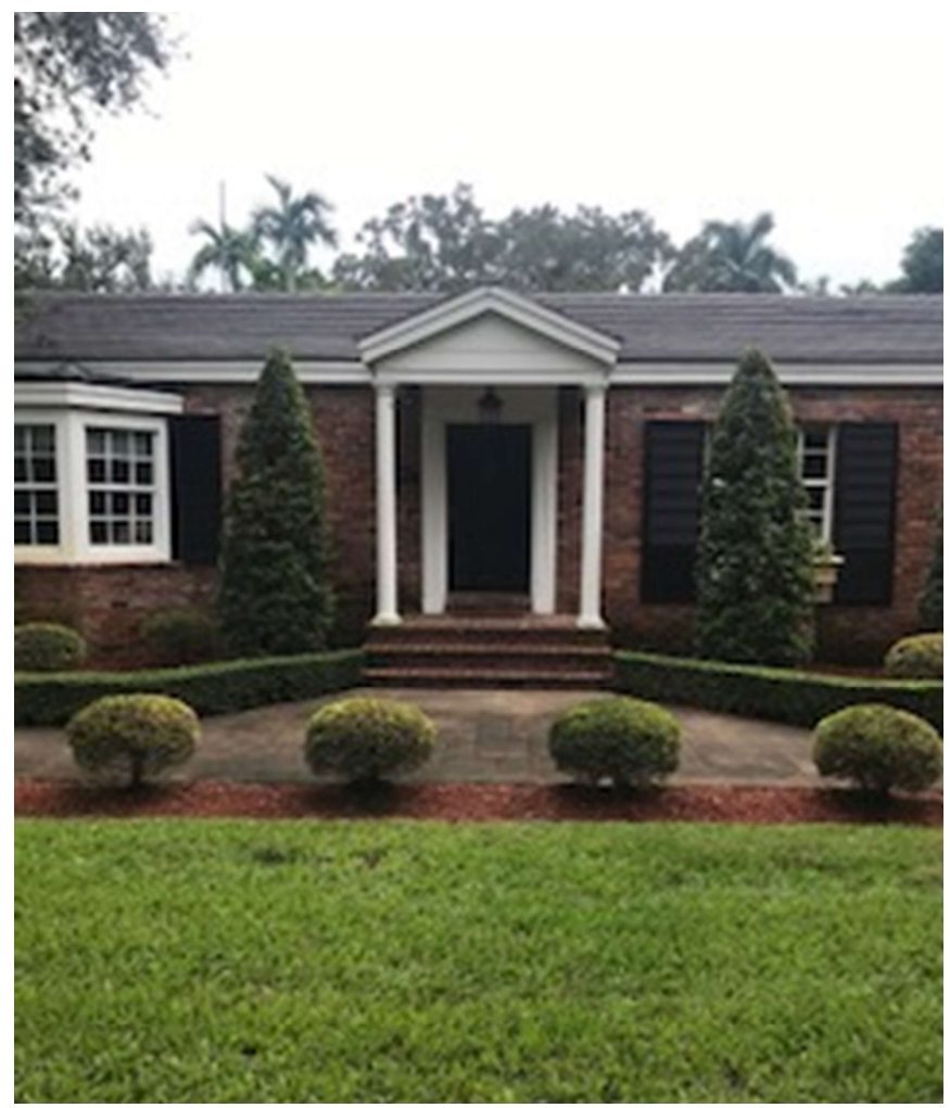
Before – left, After - right