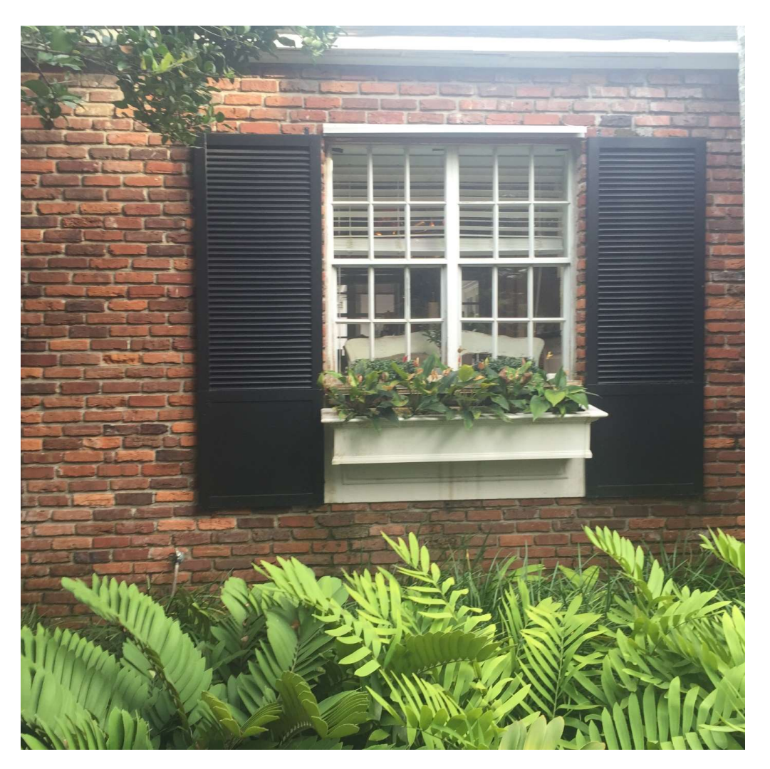
Before – left After - right