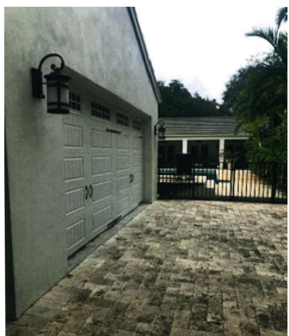
Before – left, After - right