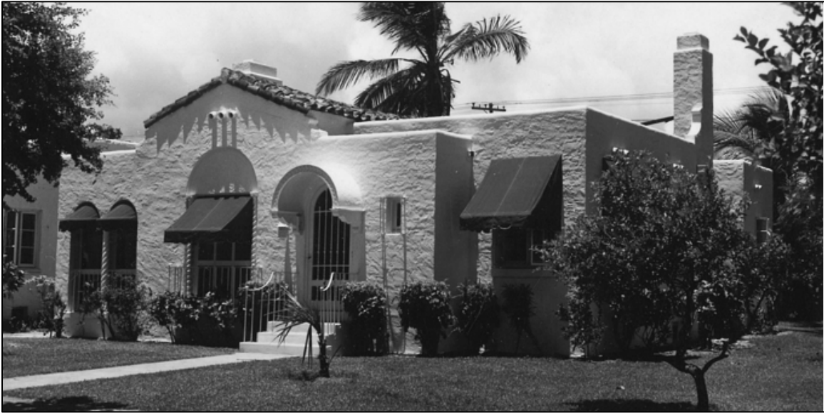
Figure 1: ca. 1940s photo