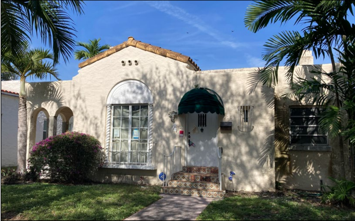
Figure 3: Current Photo, December 2023