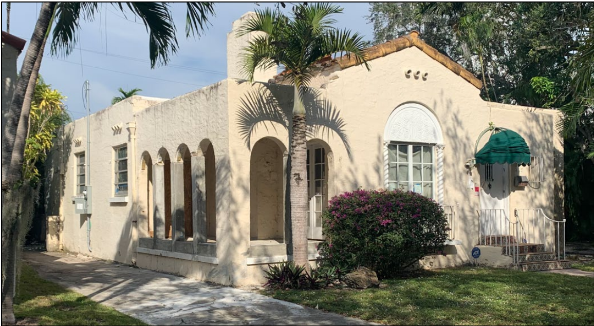
Figure 4: Current Photo, December 2023