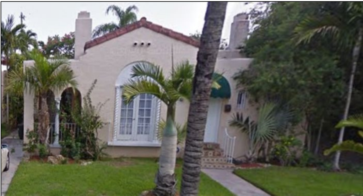
Figure 2: Photo, June 2009