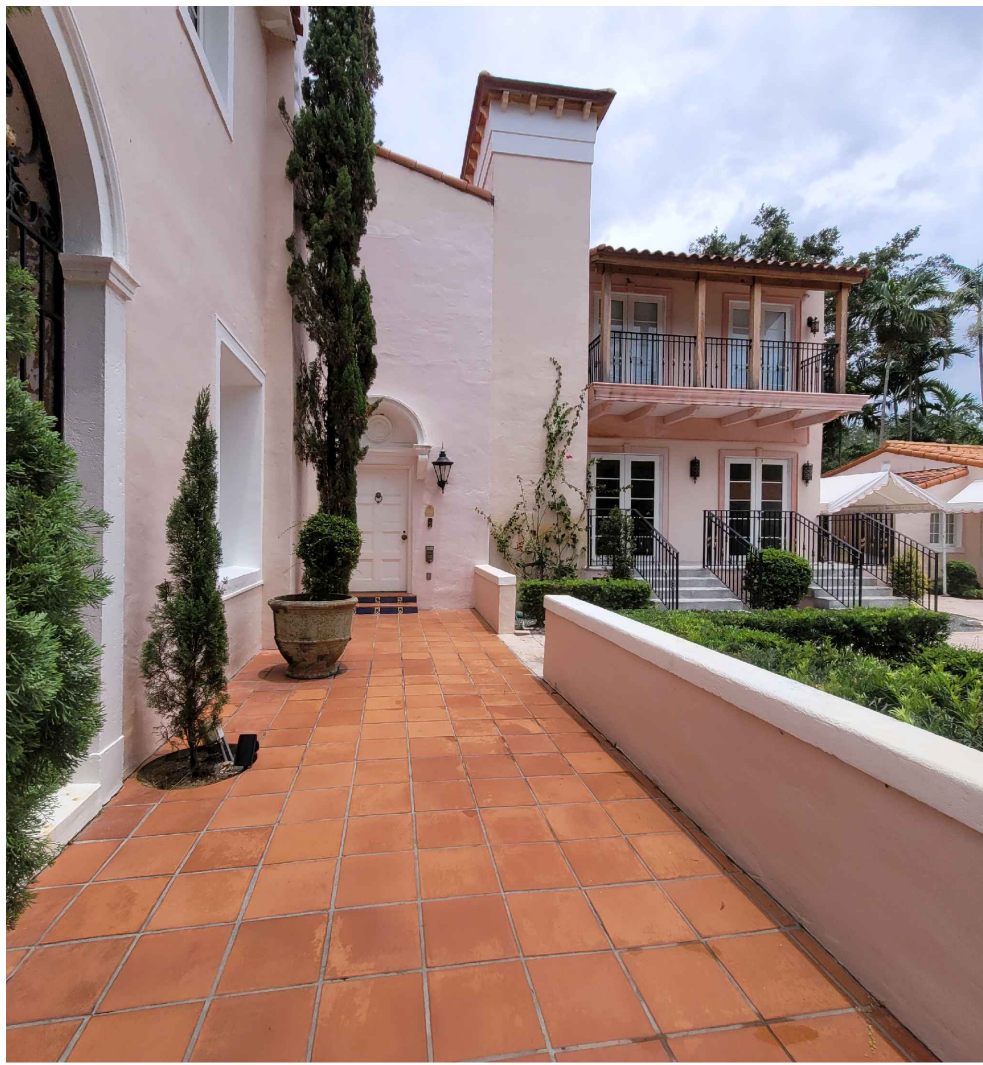
EXISTING HOUSE PICTURES