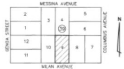
LOCATION SKETCH N.T.S.

LOT 9, IN BLOCK 39, OF REVERSED PLAT OF CORAL GABLES GRANADA SECTION, ACCORDING TO THE PLAT THEREOF, AS RECORDED IN PLAT BOOK 8, AT PAGE 113, OF THE PUBLIC RECORDS OF MIAMI-DADE COUNTY, FLORIDA.