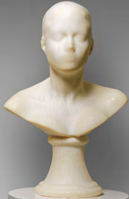
Detail view: Lick and Lather , 1993