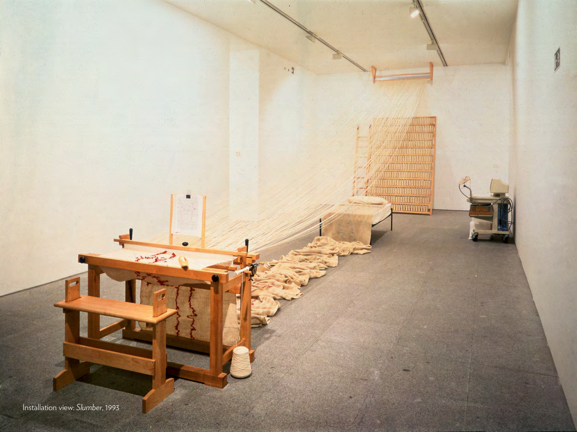
Installation view: Slumber , 1993