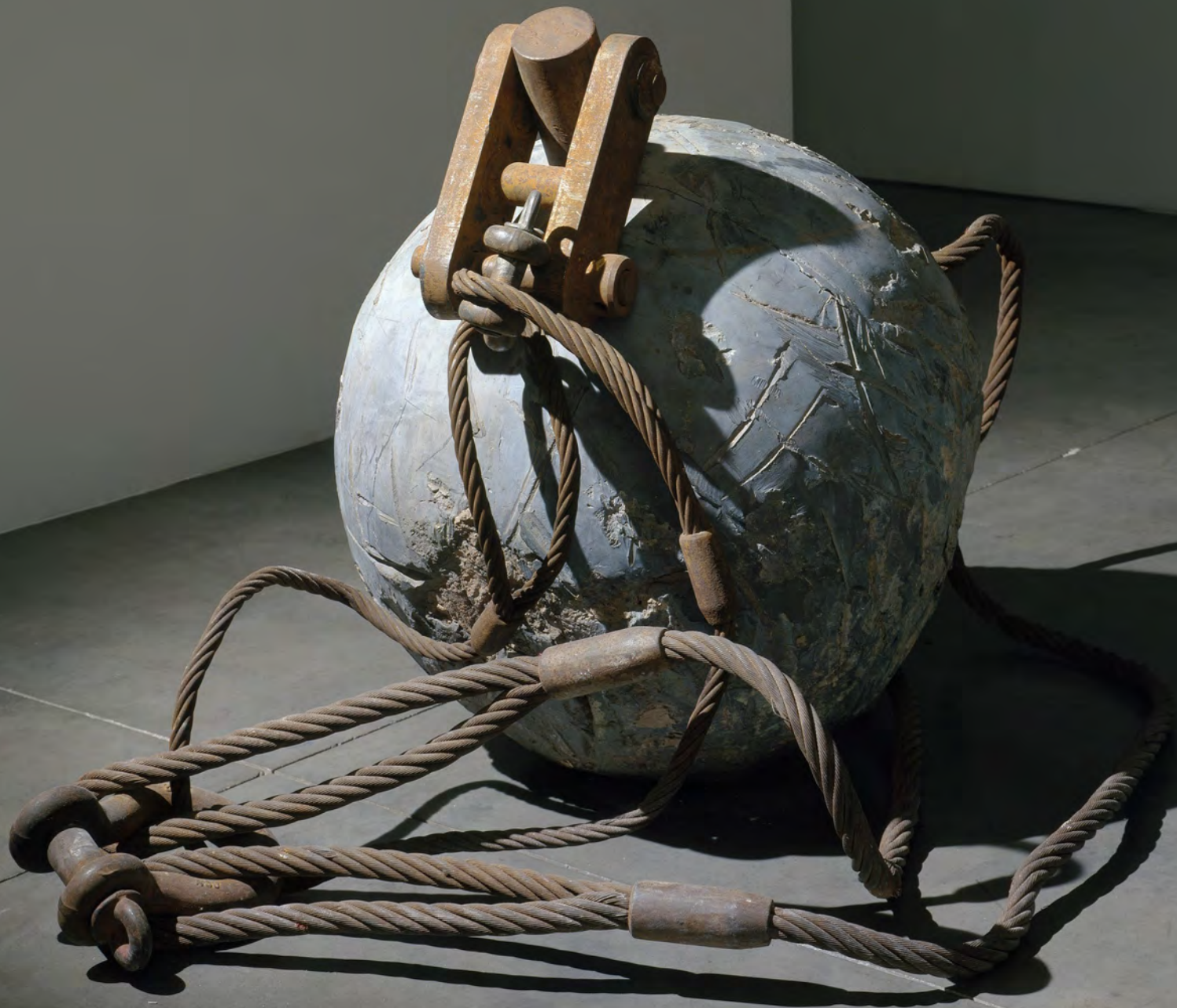
Detail view: Tear , 2008