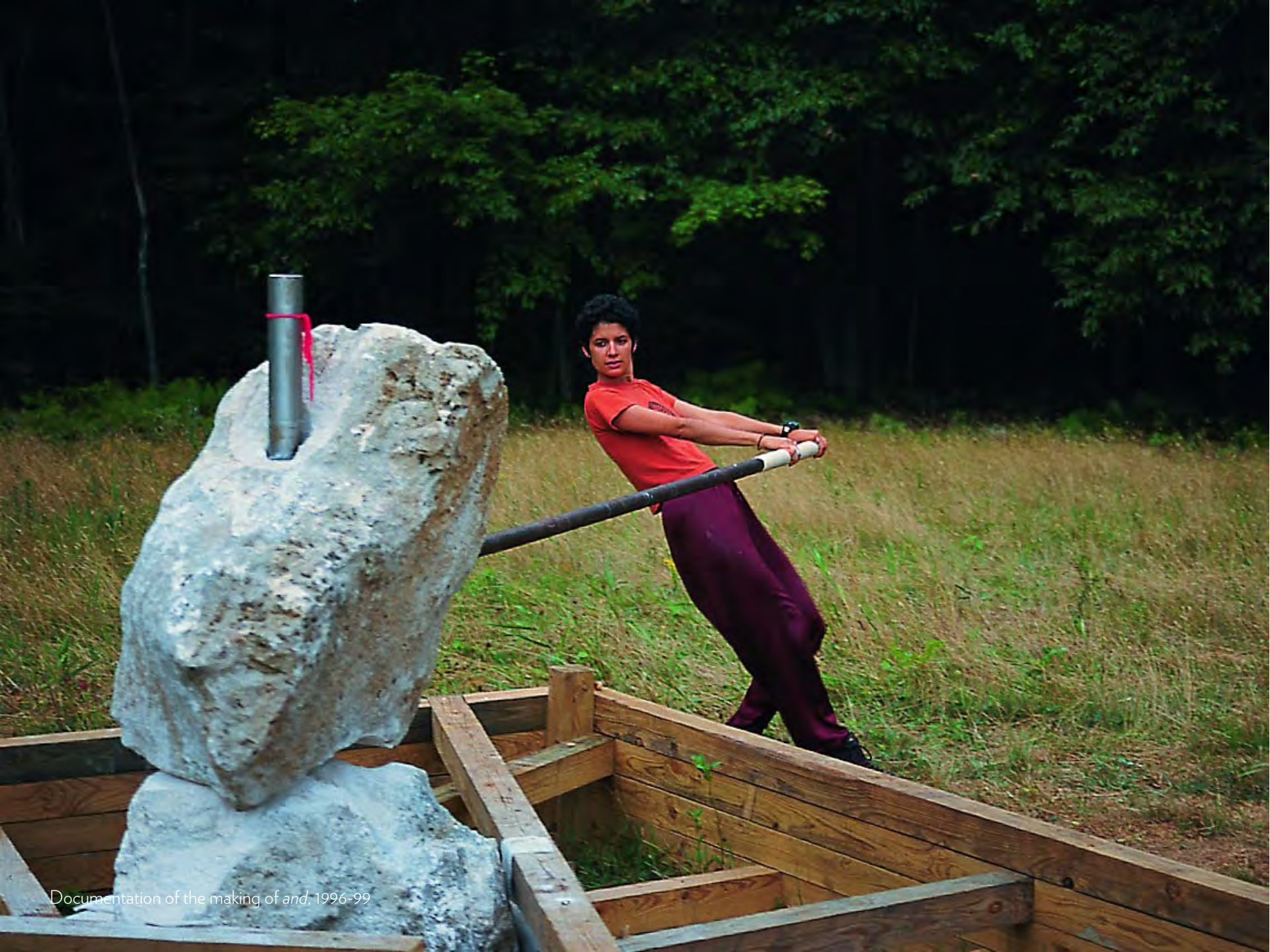
Documentation of the making of and , 1996-99