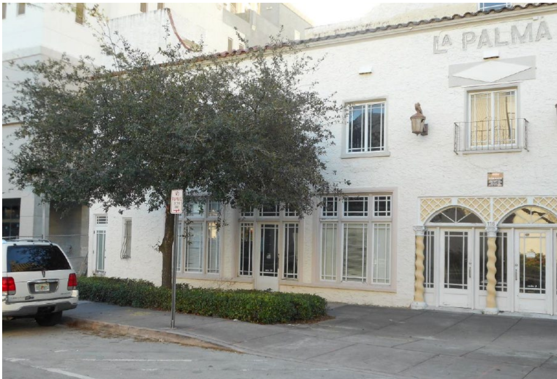
North Façade (east end) – Before