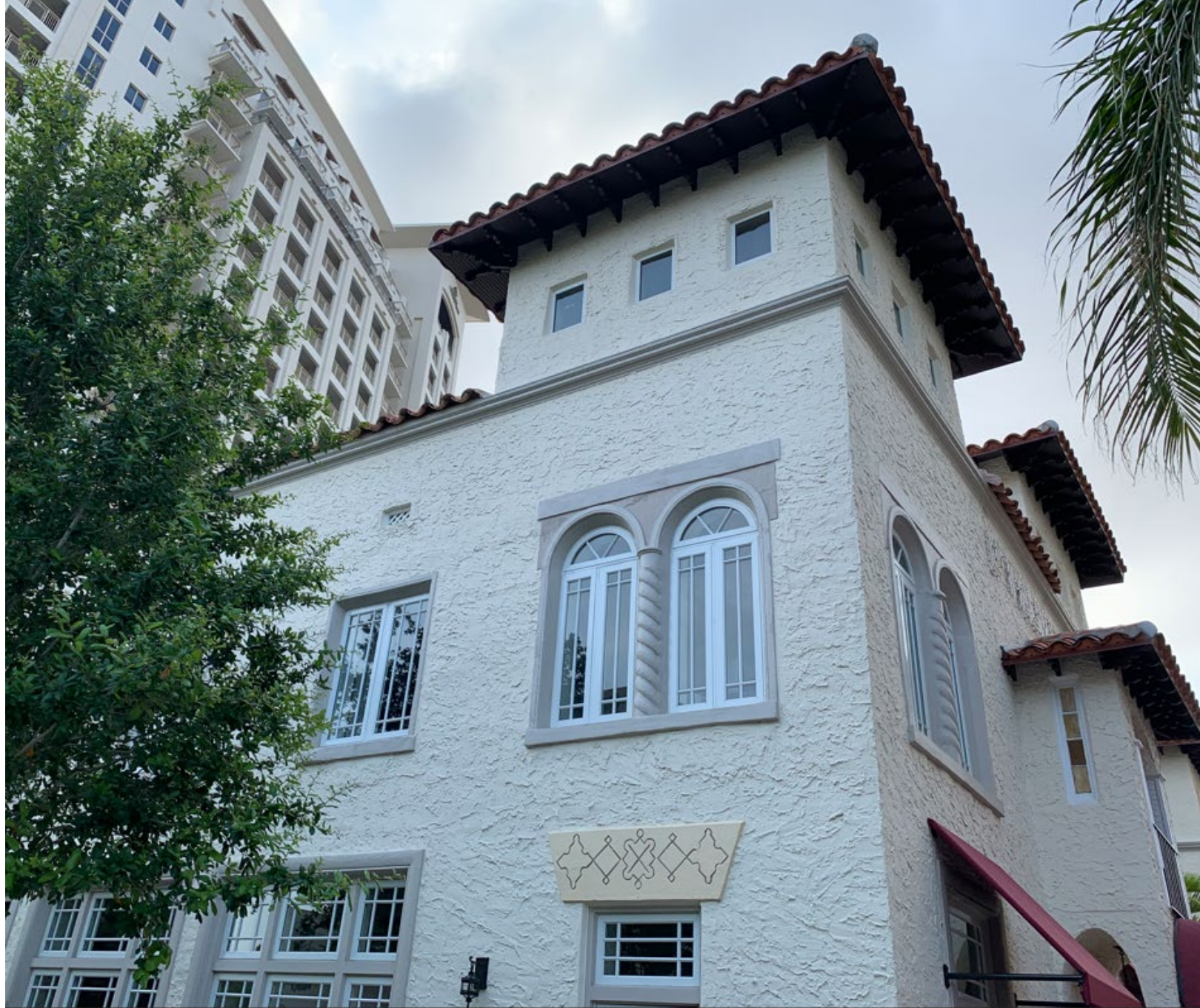
Northwest Corner Detail – After