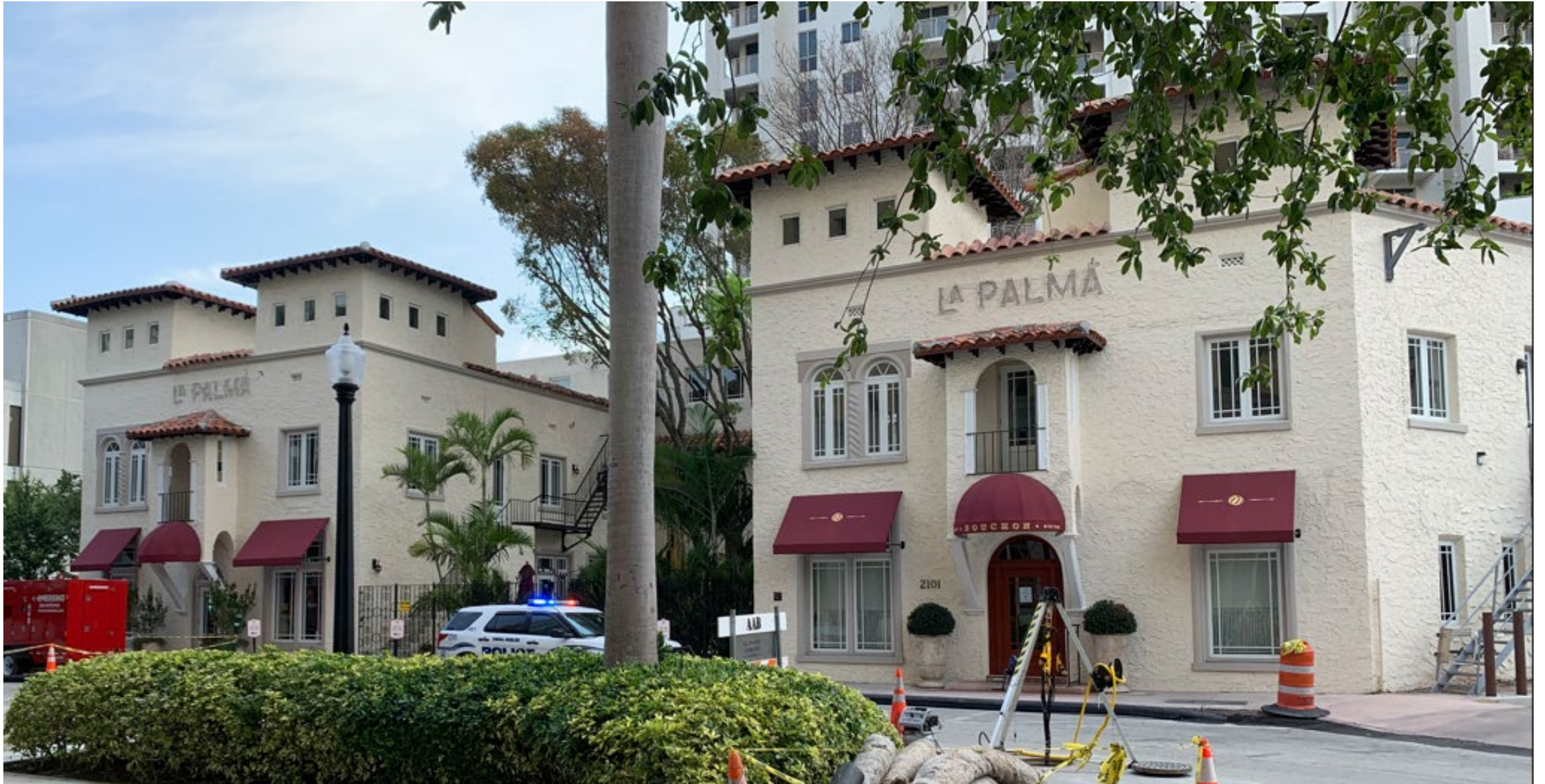
West Façade / Southwest Corner – After