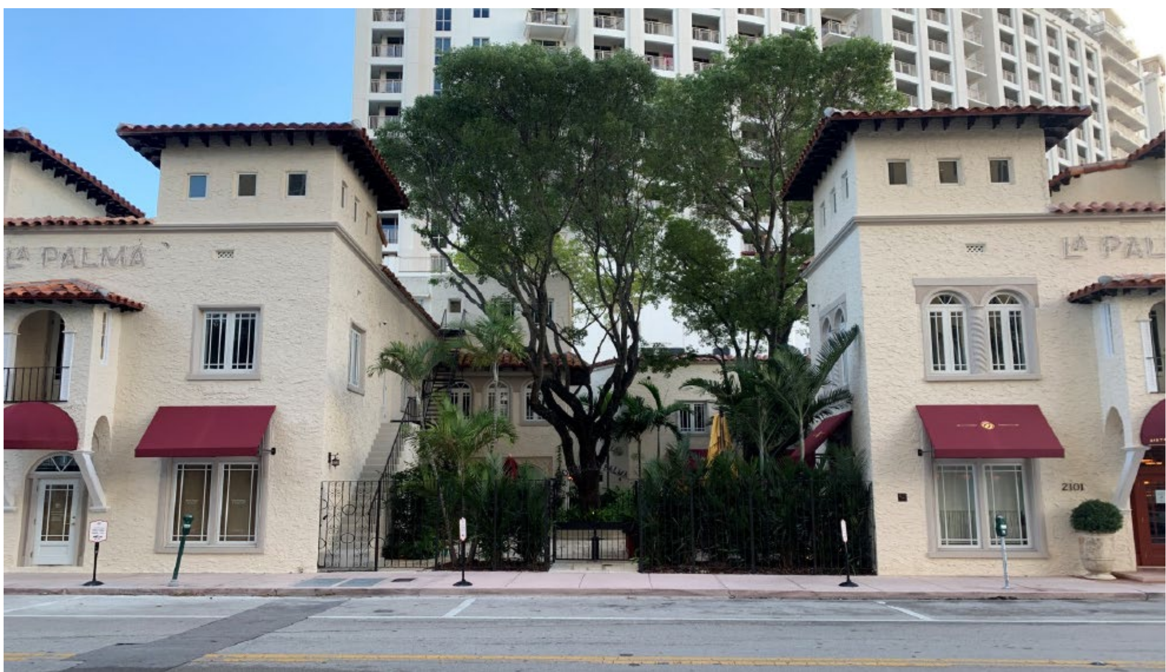
West Façade – After