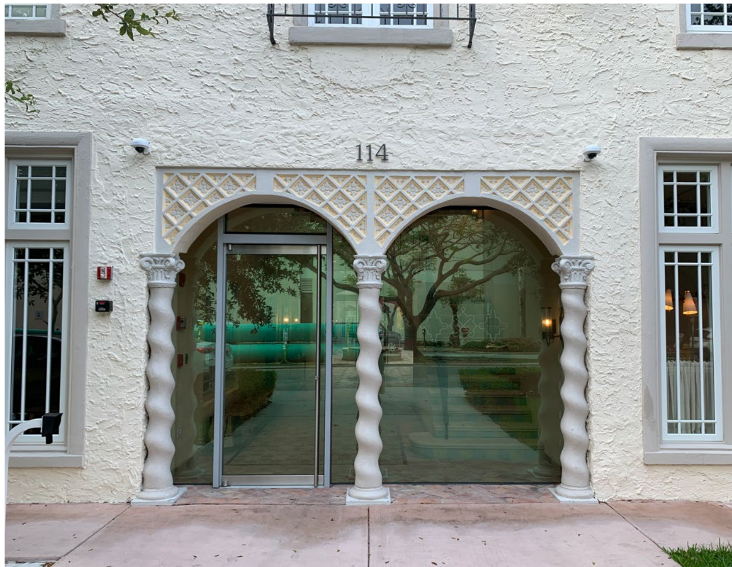
North Façade Main Entry - After