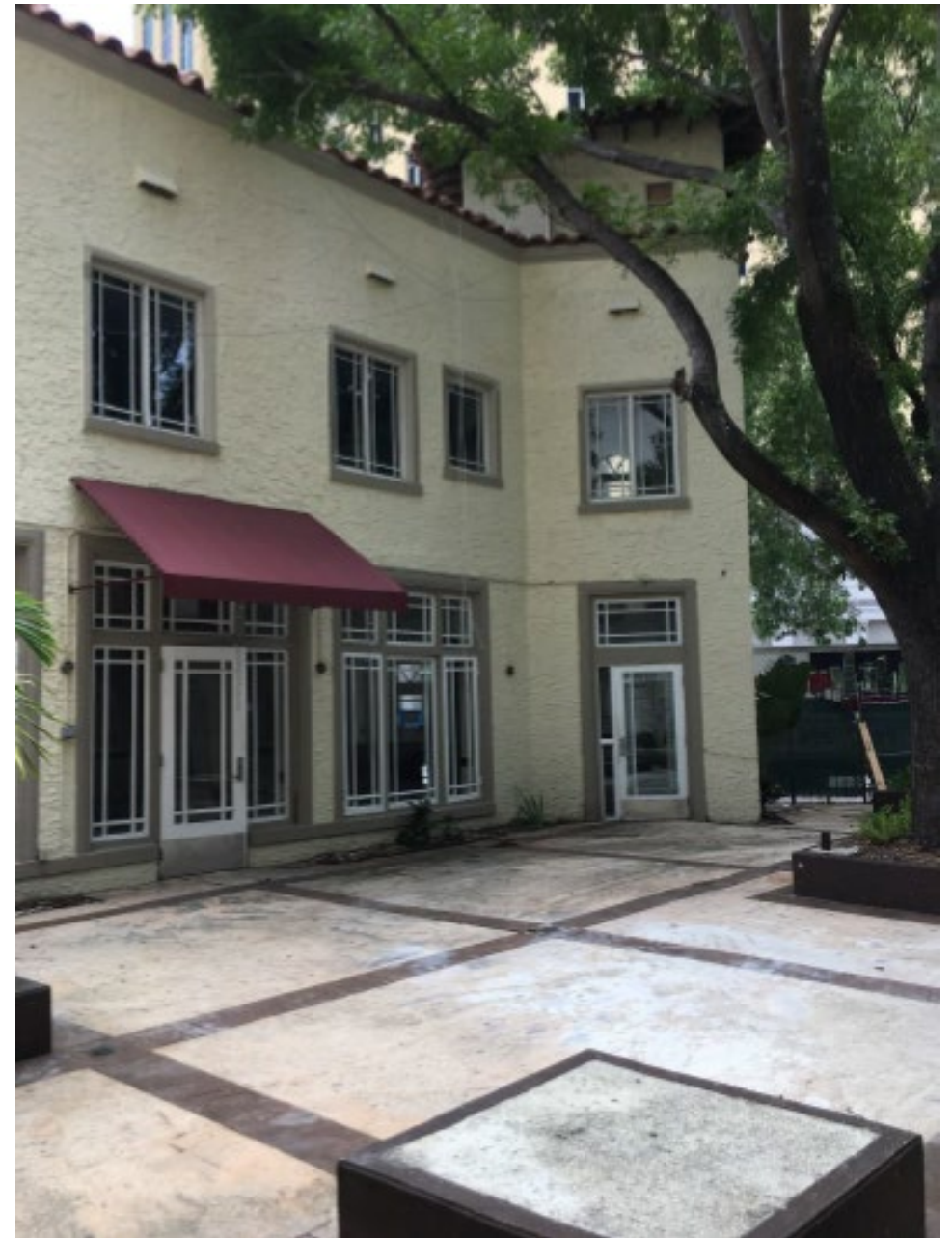
Courtyard Looking South – Before