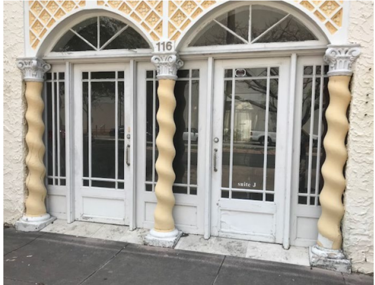
North Façade Main Entry - Before