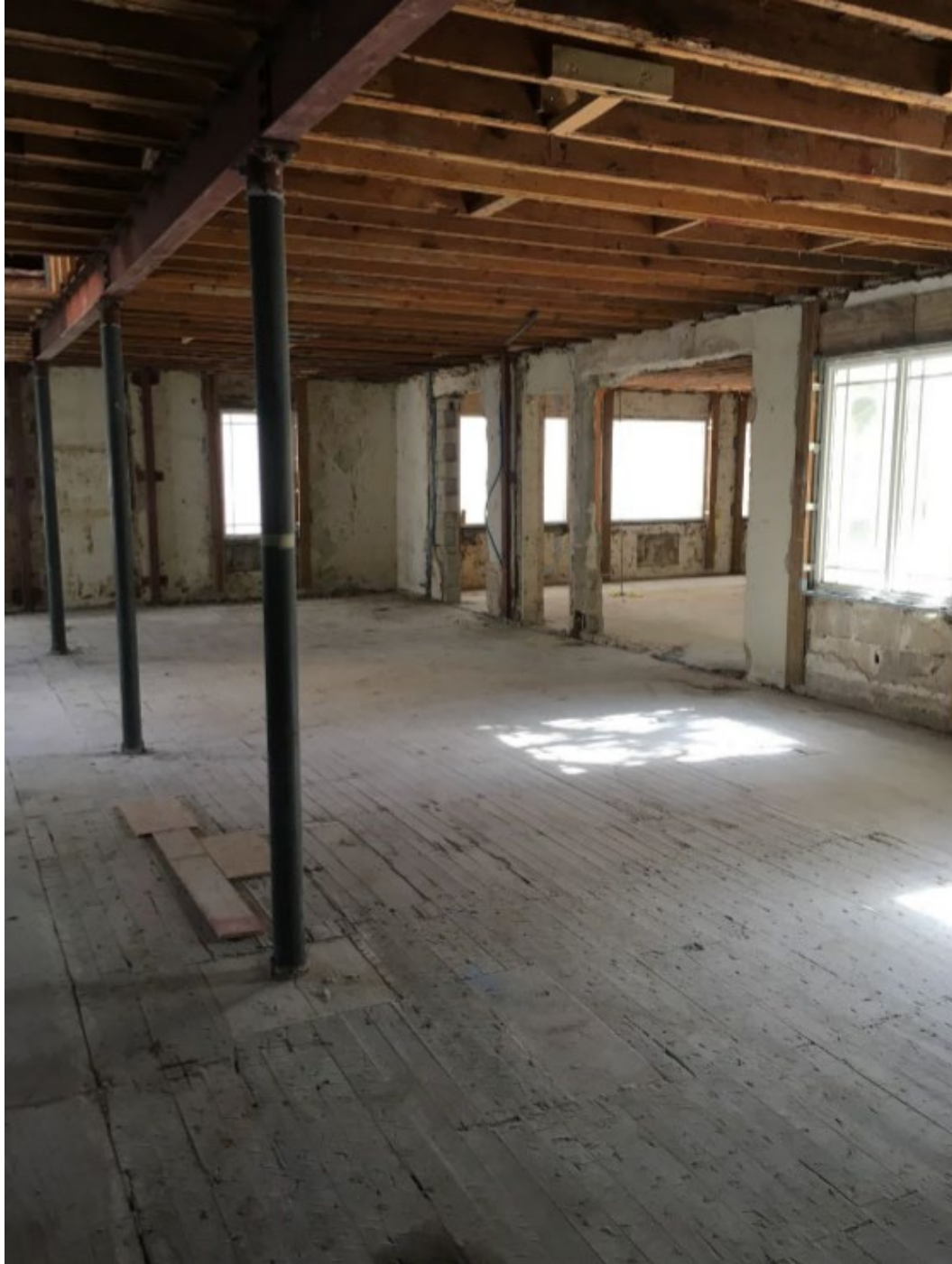
Second Floor Near Lobby (Typical Second Floor Condition Before - Left) & After (Right)