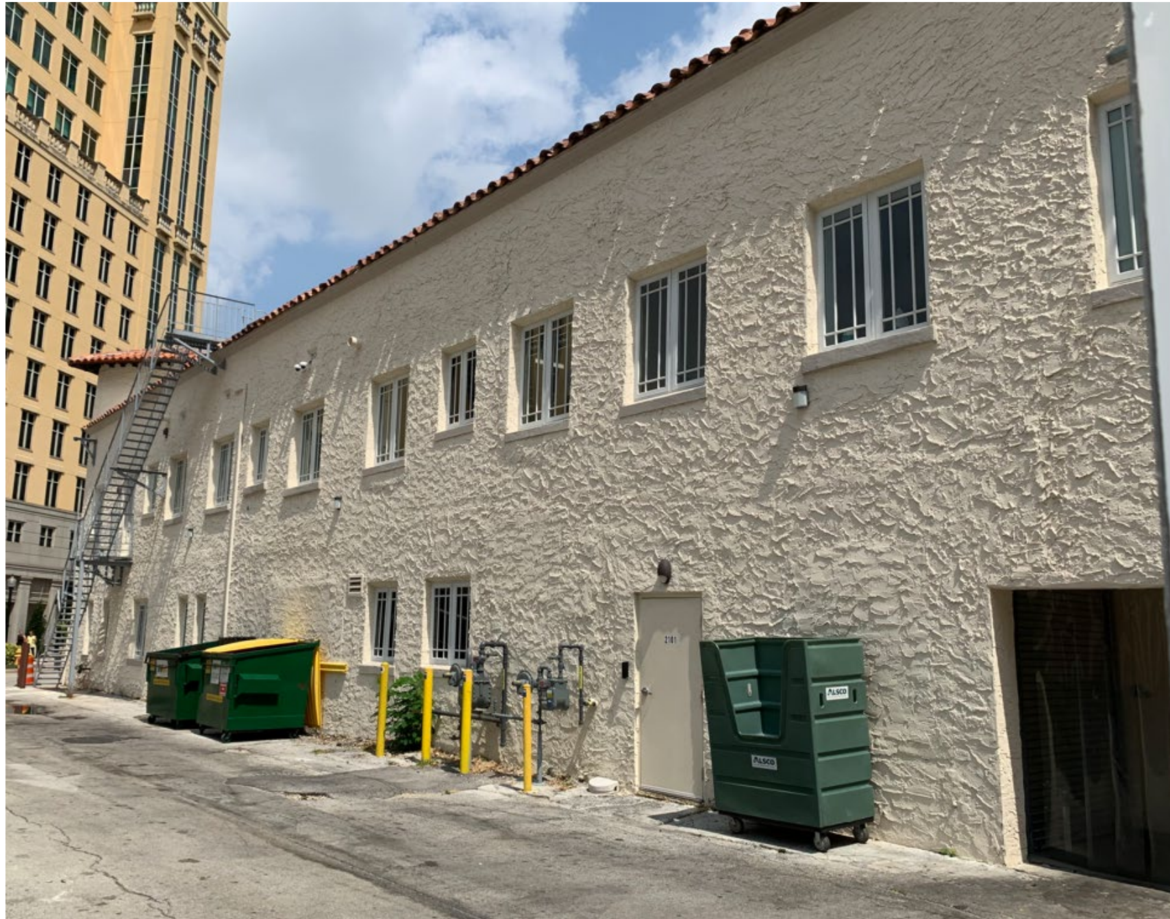
South Façade (Alley)– After