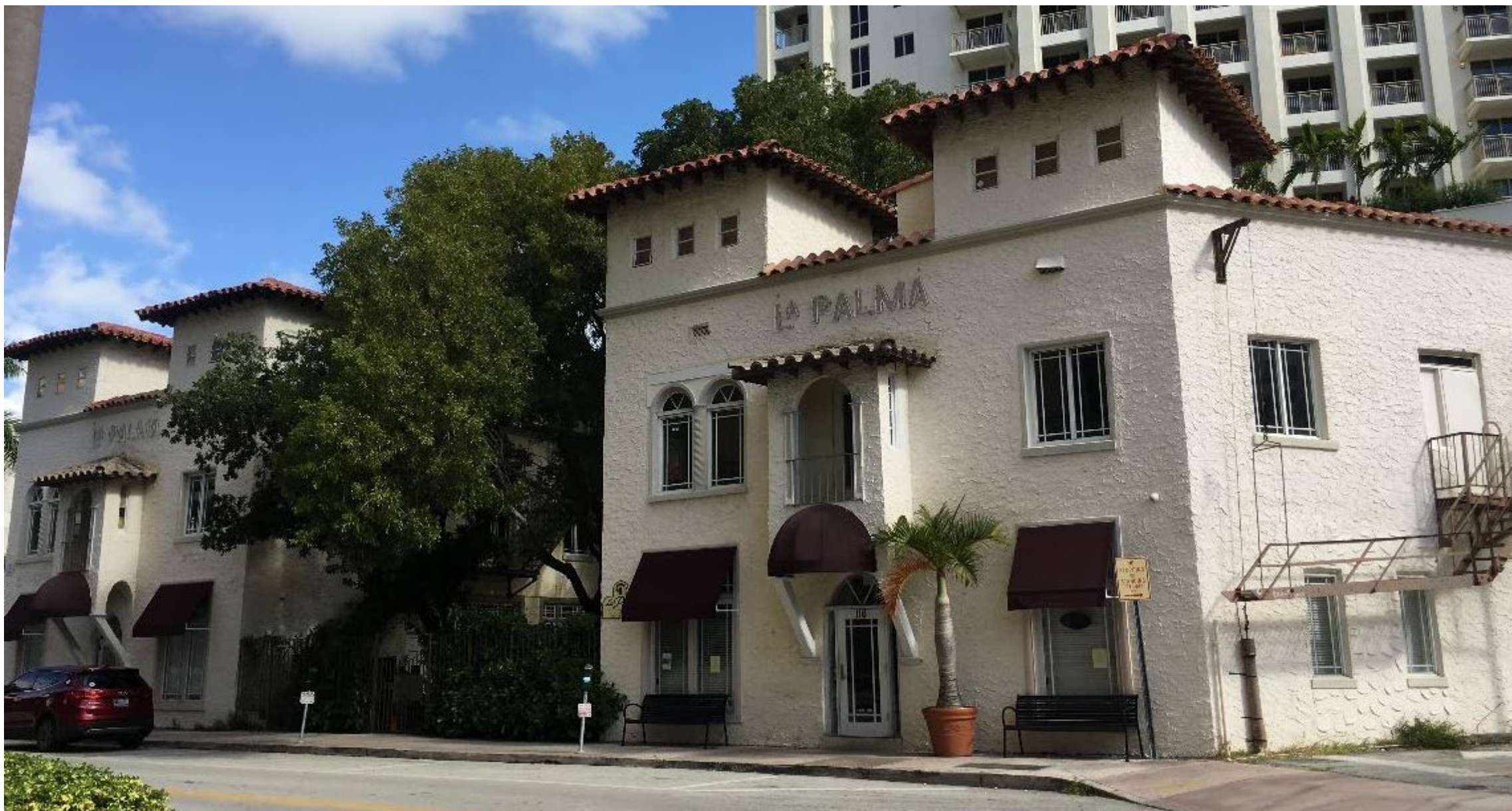
West Façade / Southwest Corner – Before