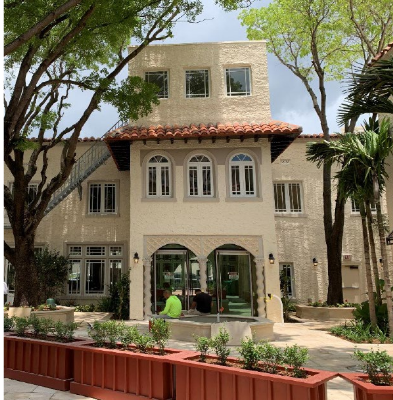
Courtyard Looking North – Before (Left) and After (Right)