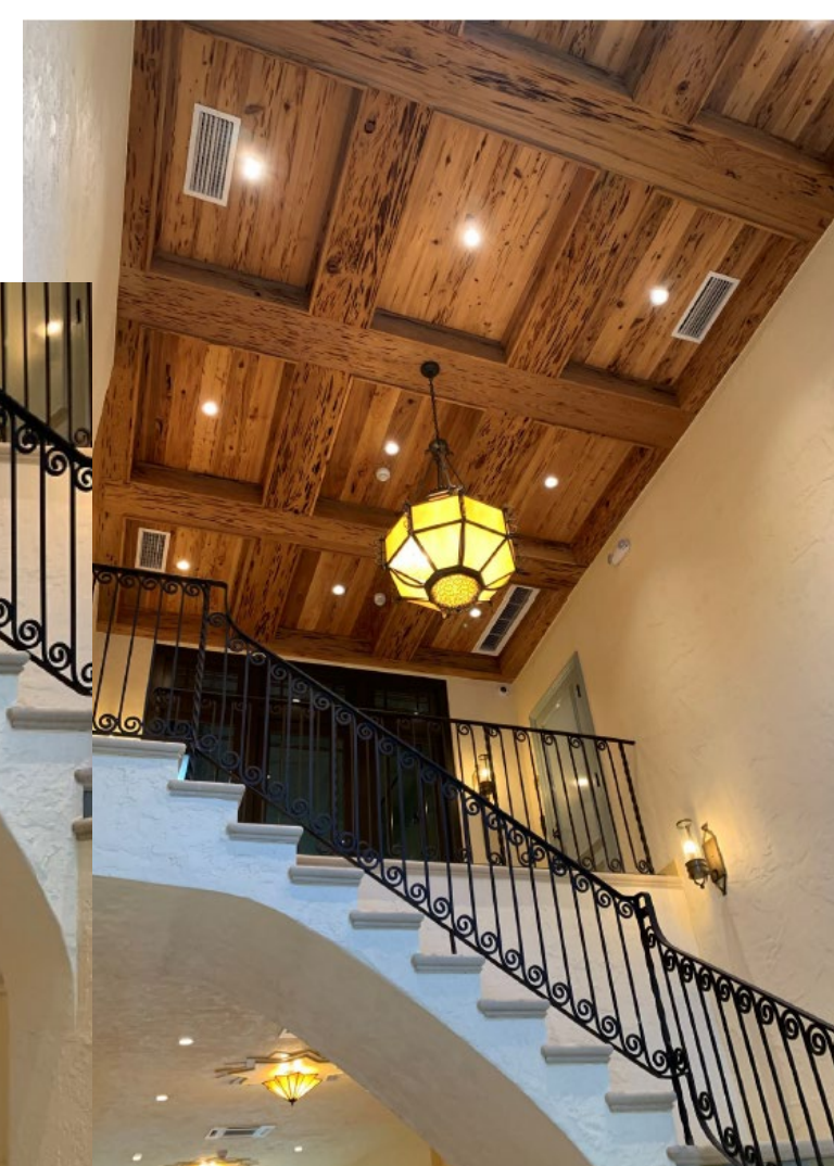
Entrance Lobby – Before and After