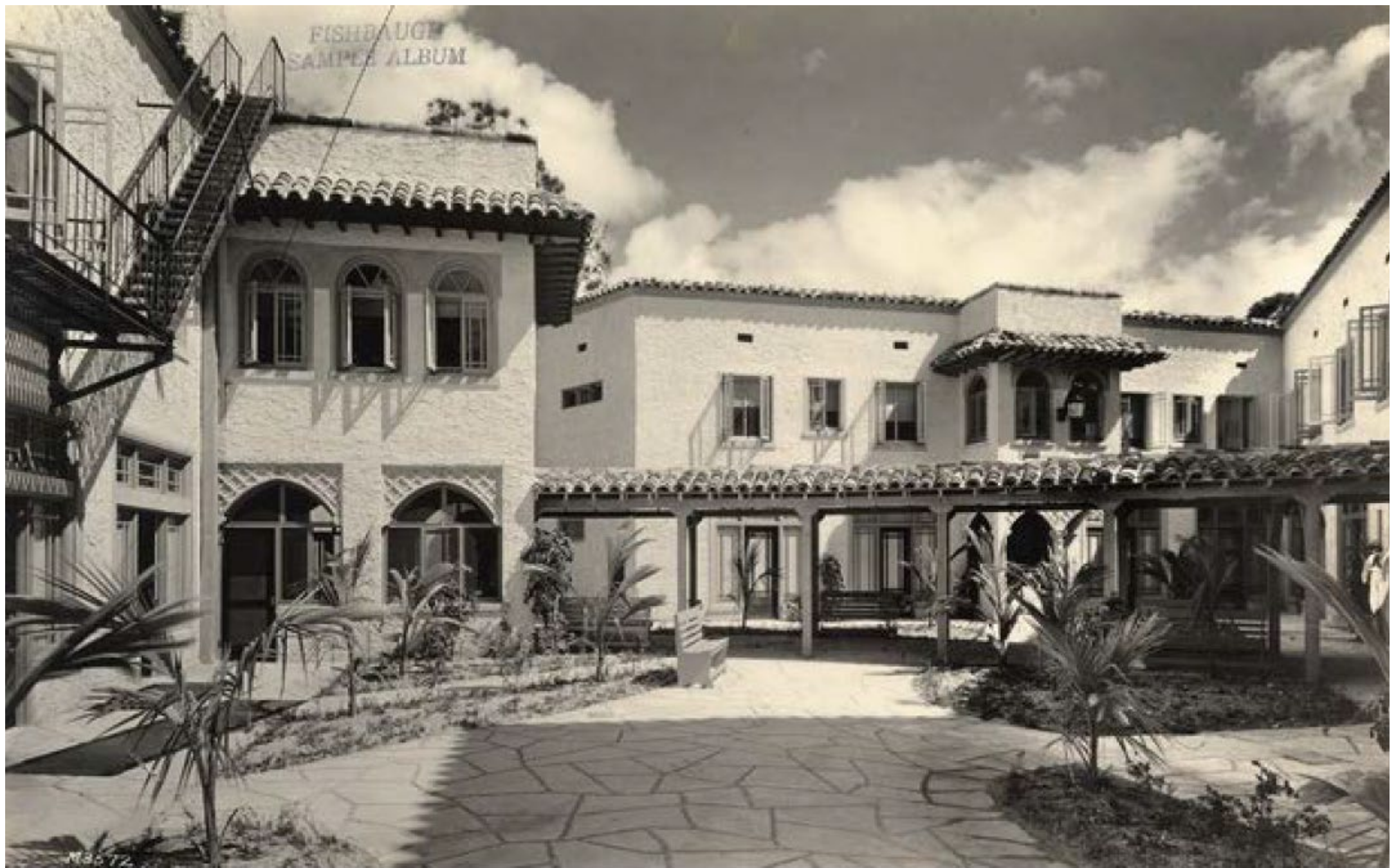
Courtyard Looking East – 1920s