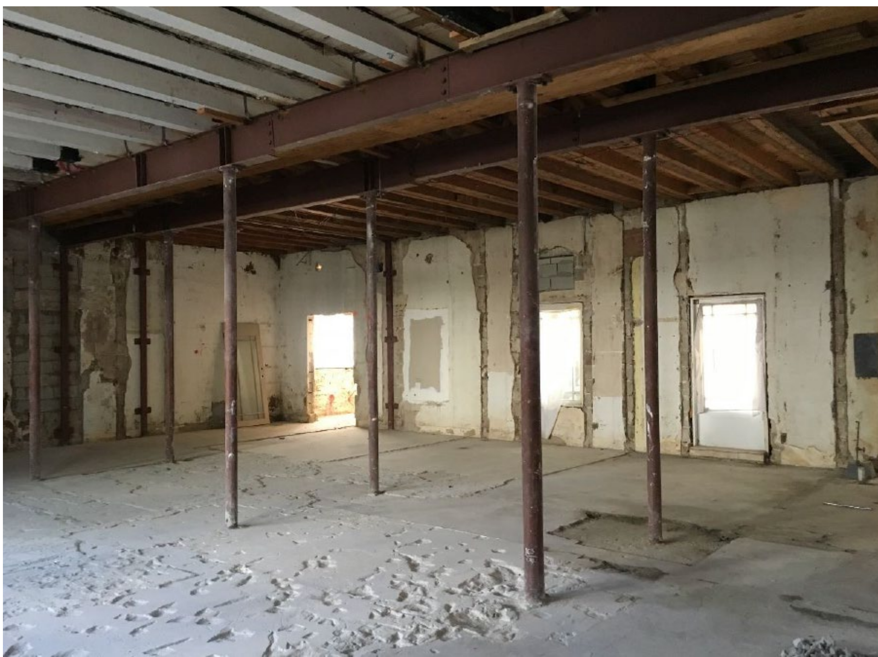
Northwest Corner Interior (Typical First Floor Condition) – Before