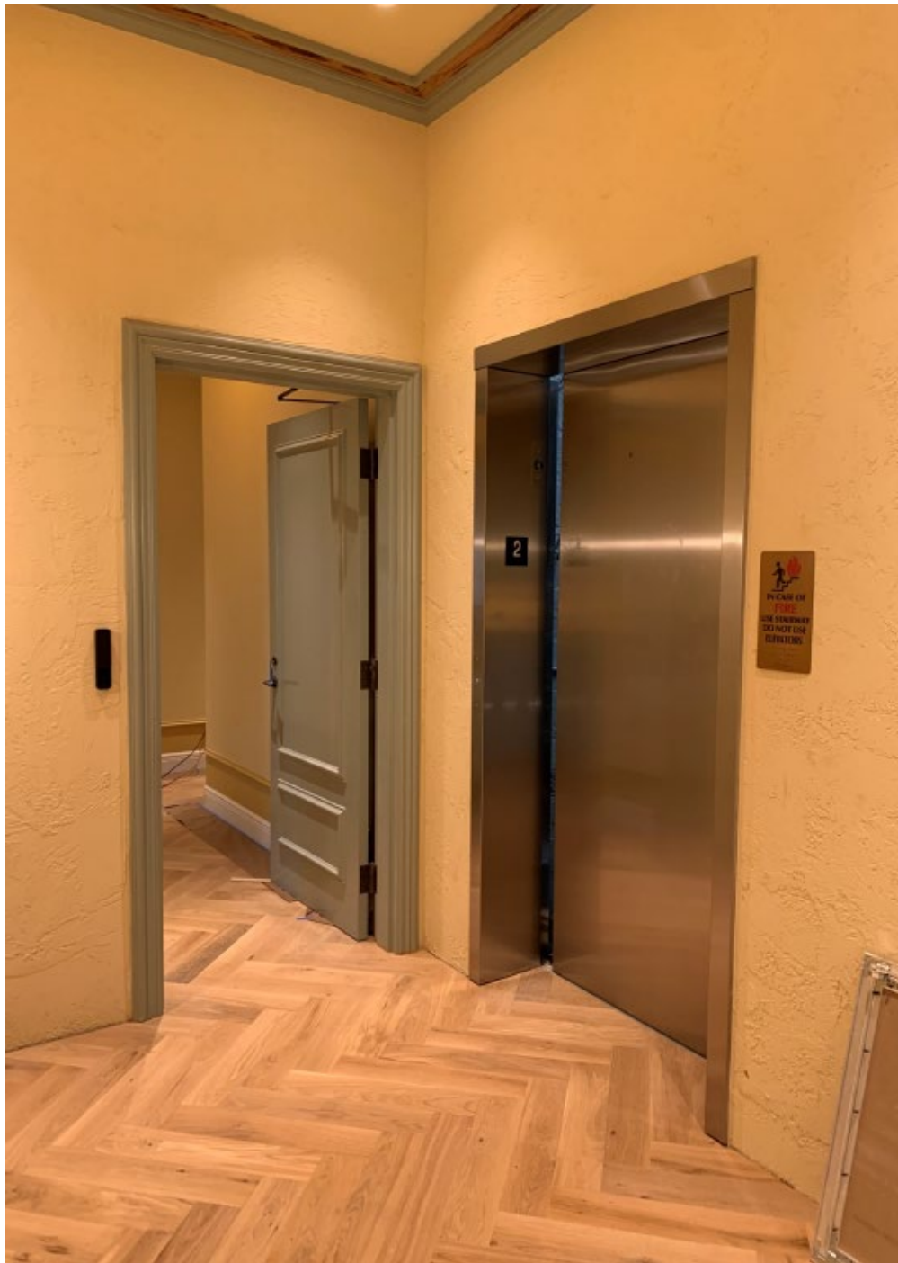
Second Floor Looking North (Typical Second Floor Condition Before - Left) & After (Right)