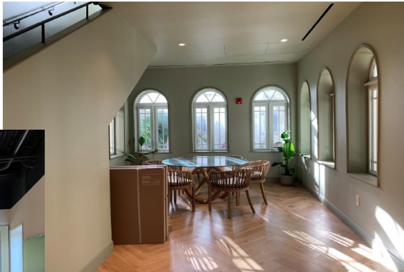
Second Floor Offices – After