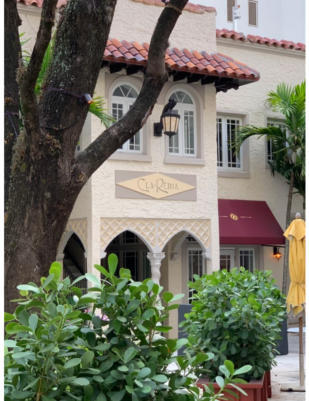
Courtyard Looking North – Before (Left) and After (Right)