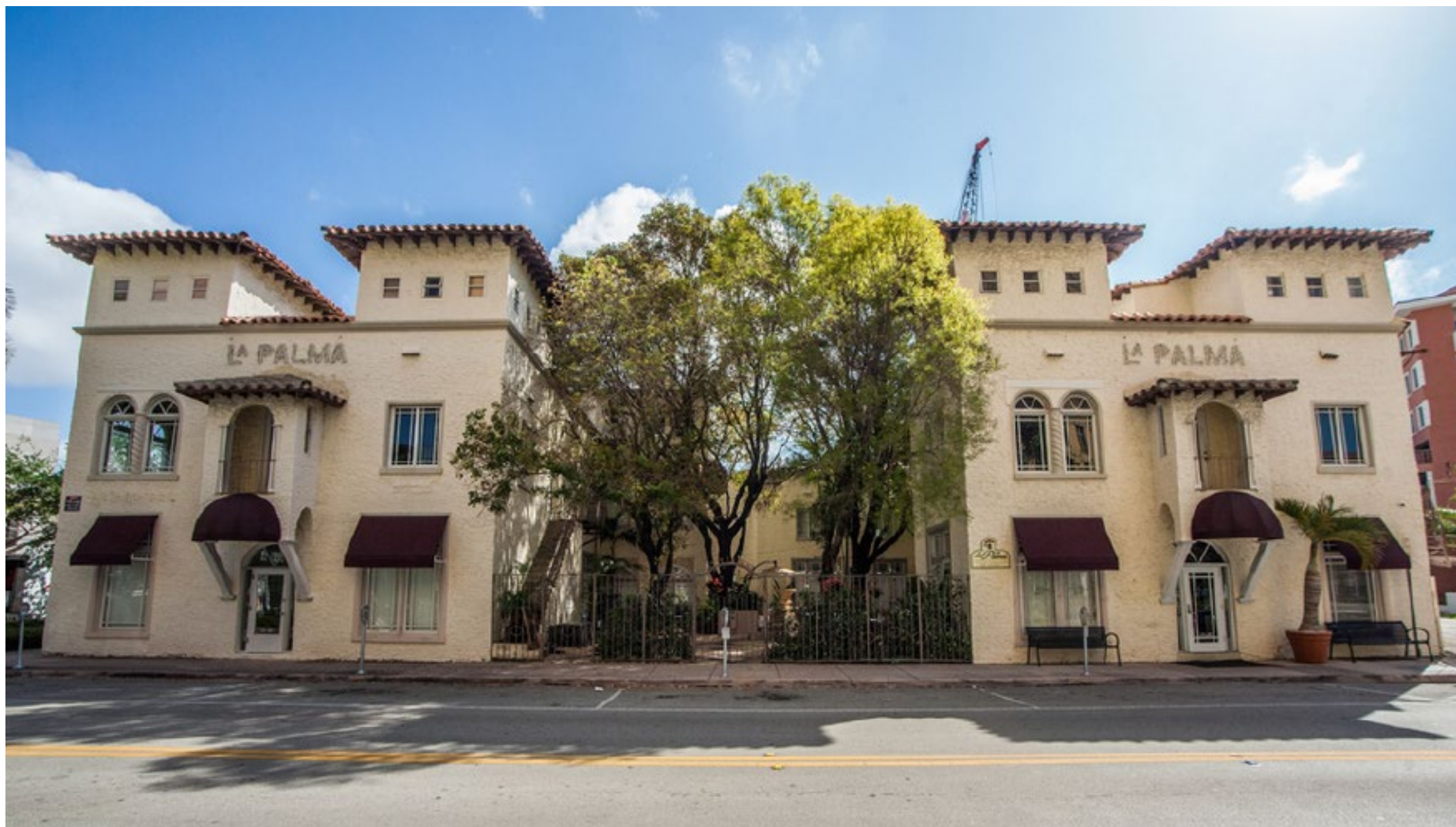
West Façade – Before