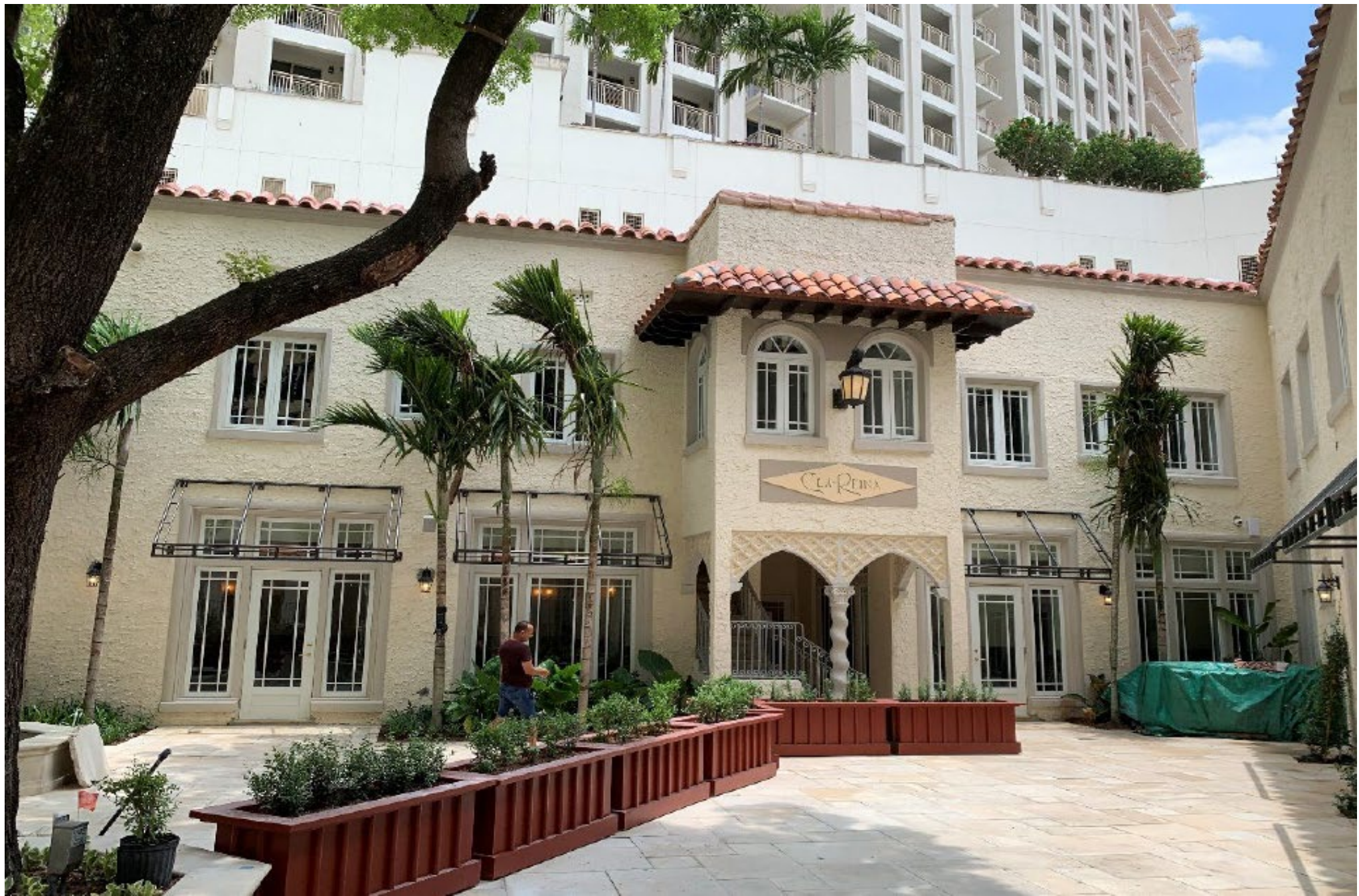
East Facade – After