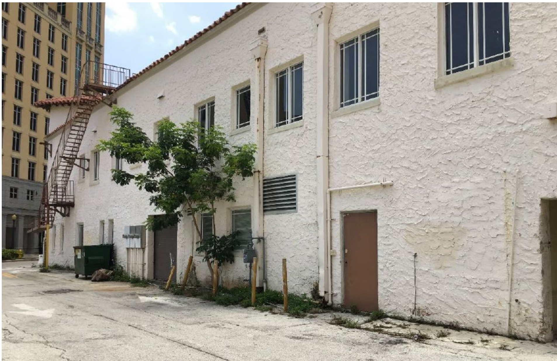
South Façade (Alley) – Before