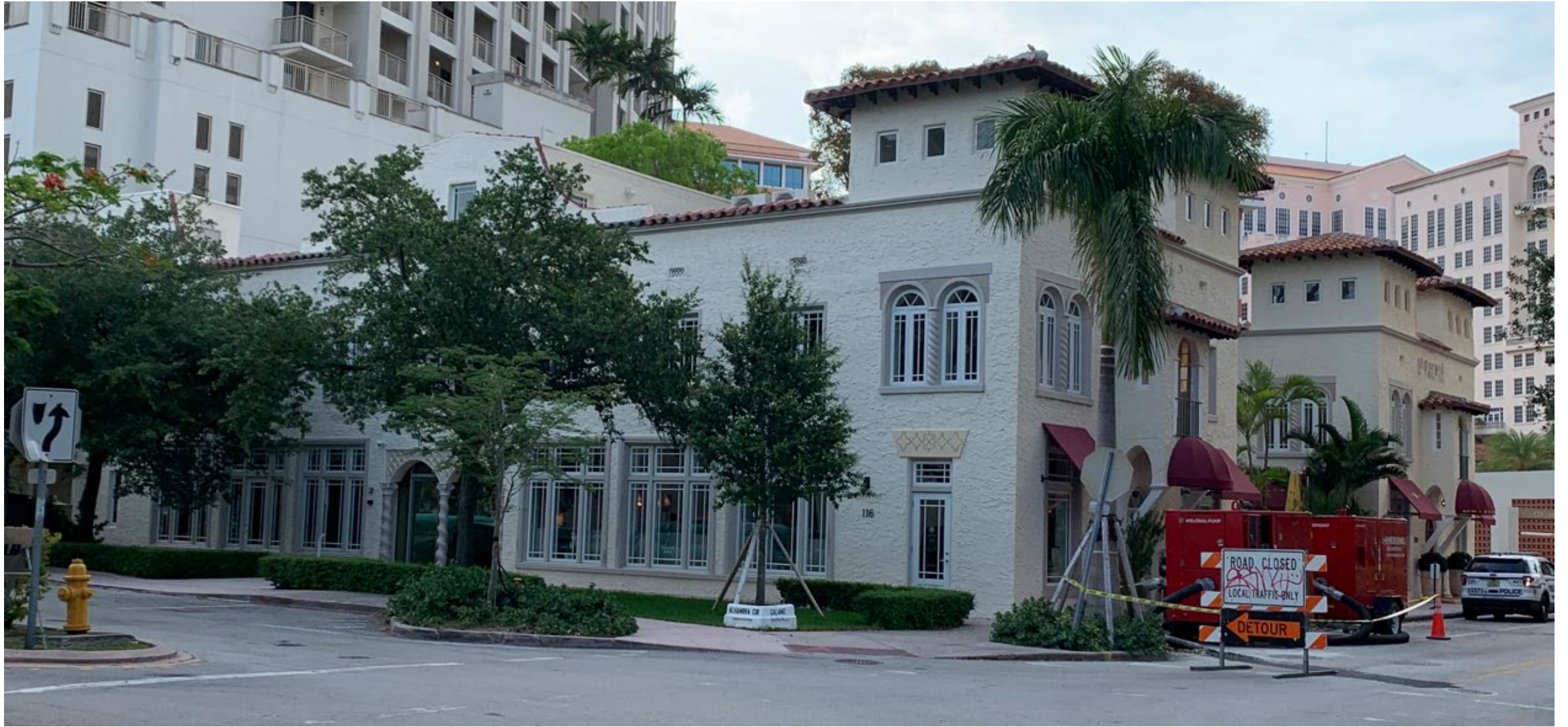
Northwest Corner – After