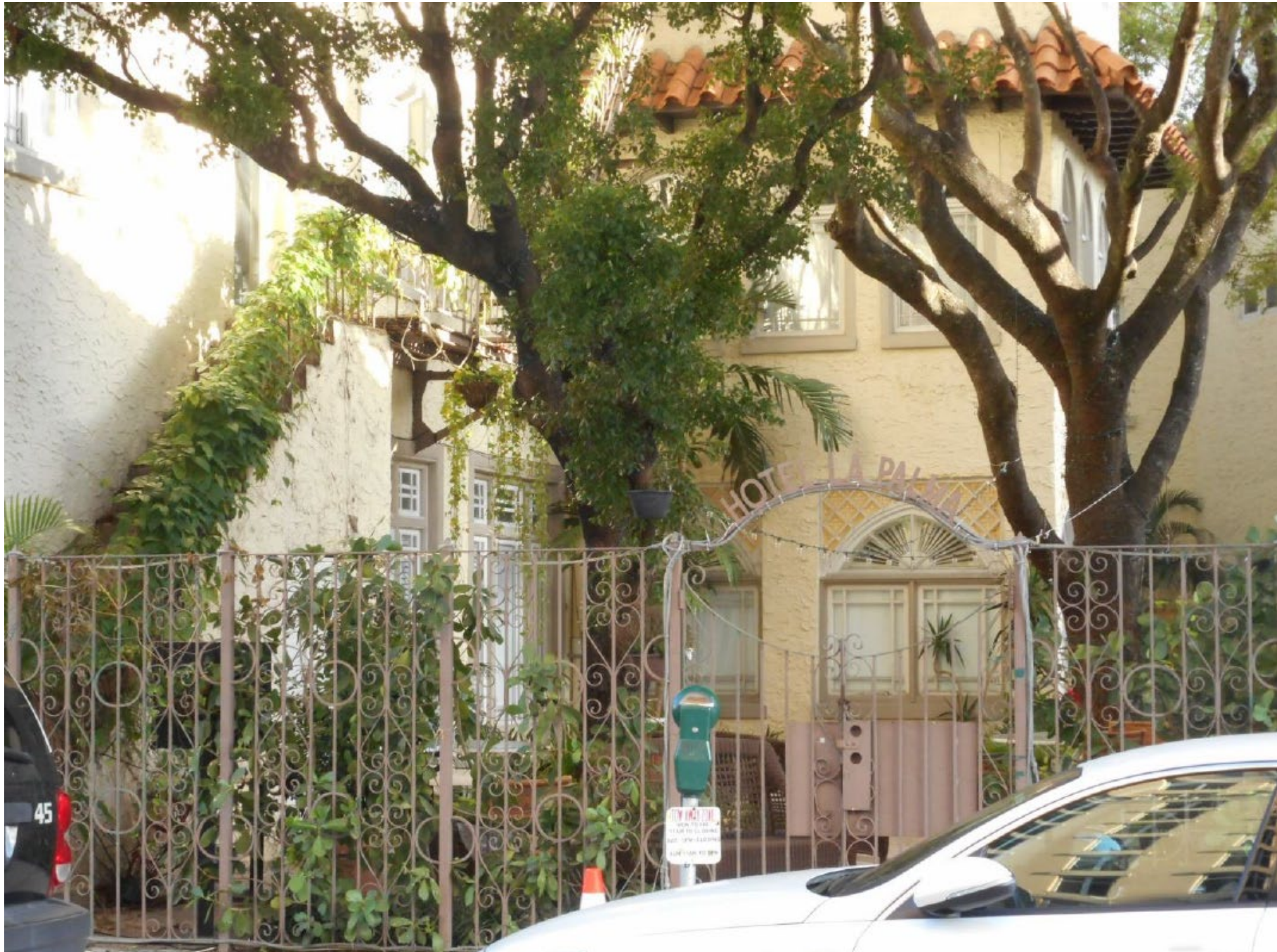
West Façade (looking into courtyard) – Before