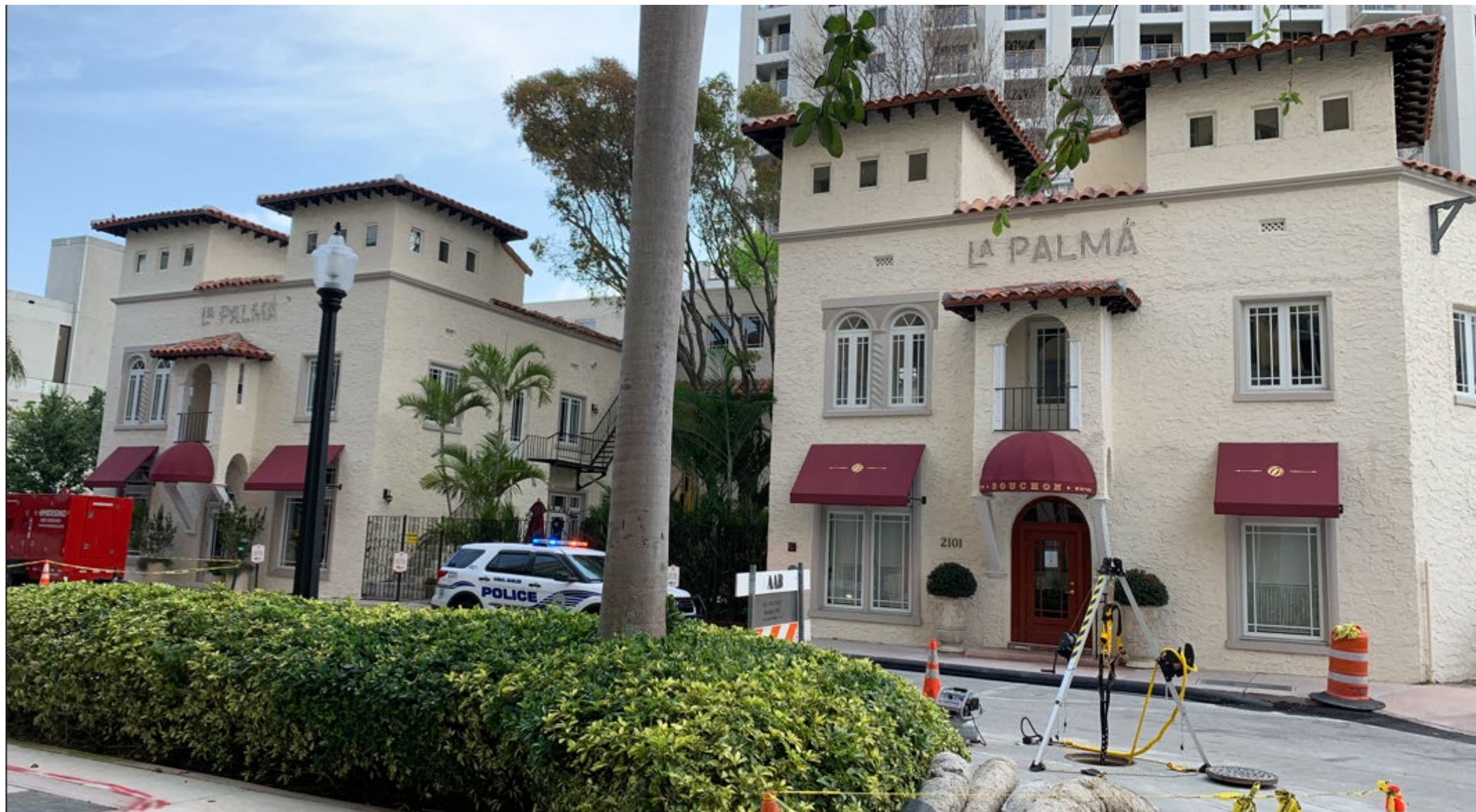
West Façade – After