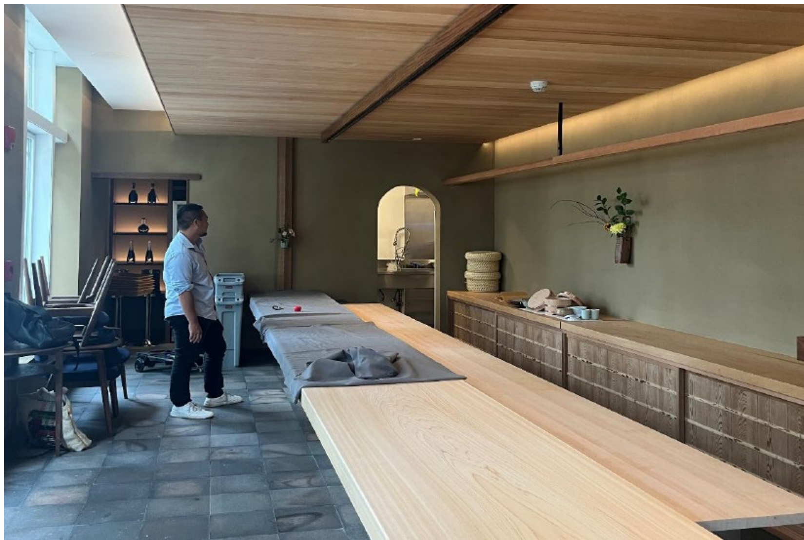
Northwest Corner Interior (Tenant Buildout) – After