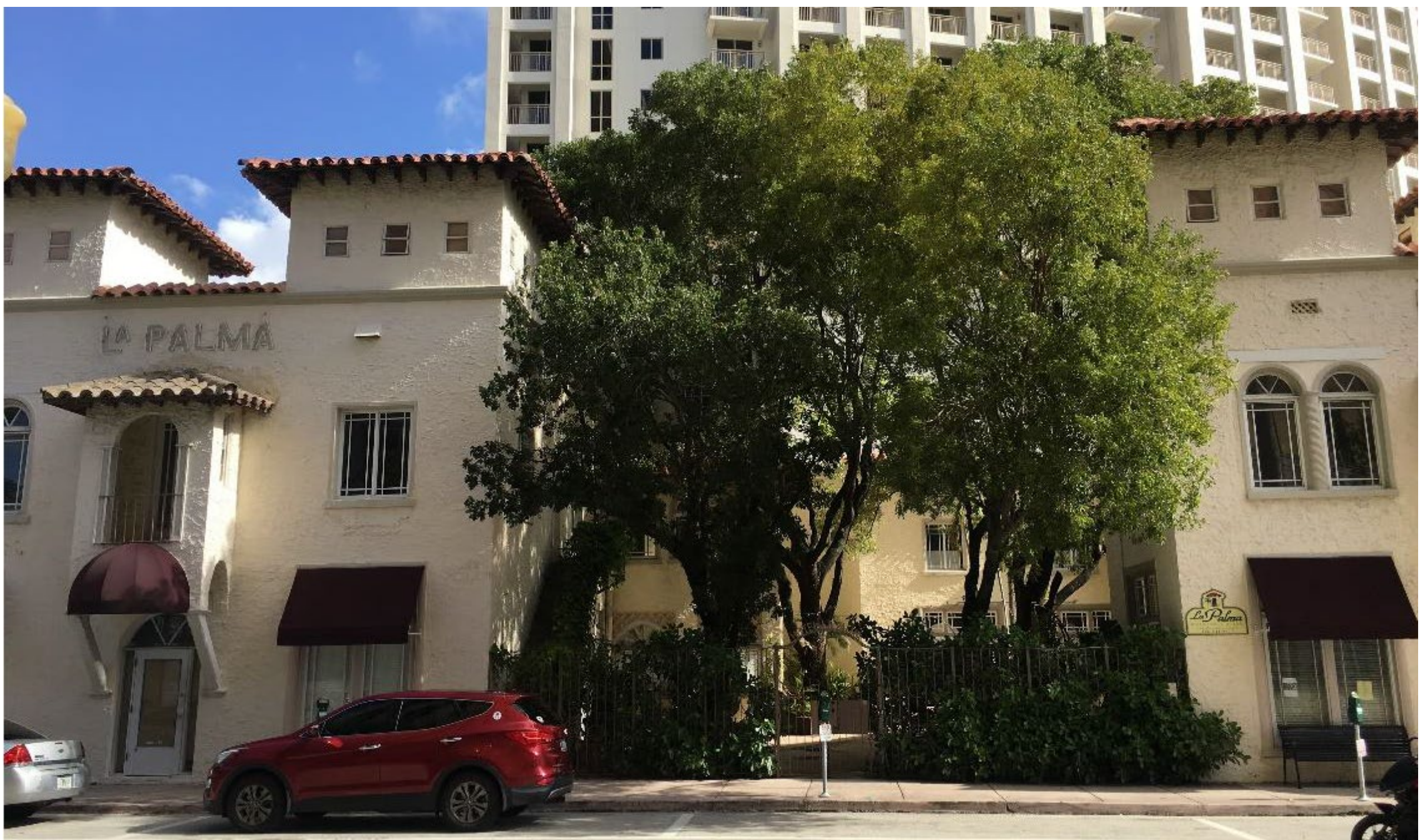
West Façade – Before