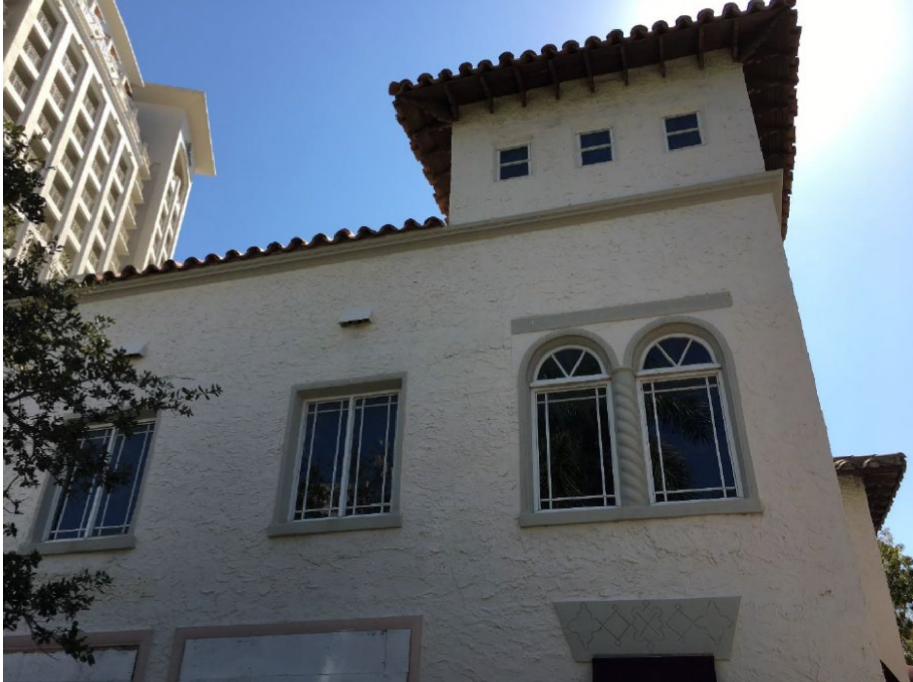
Northwest Corner Detail – Before