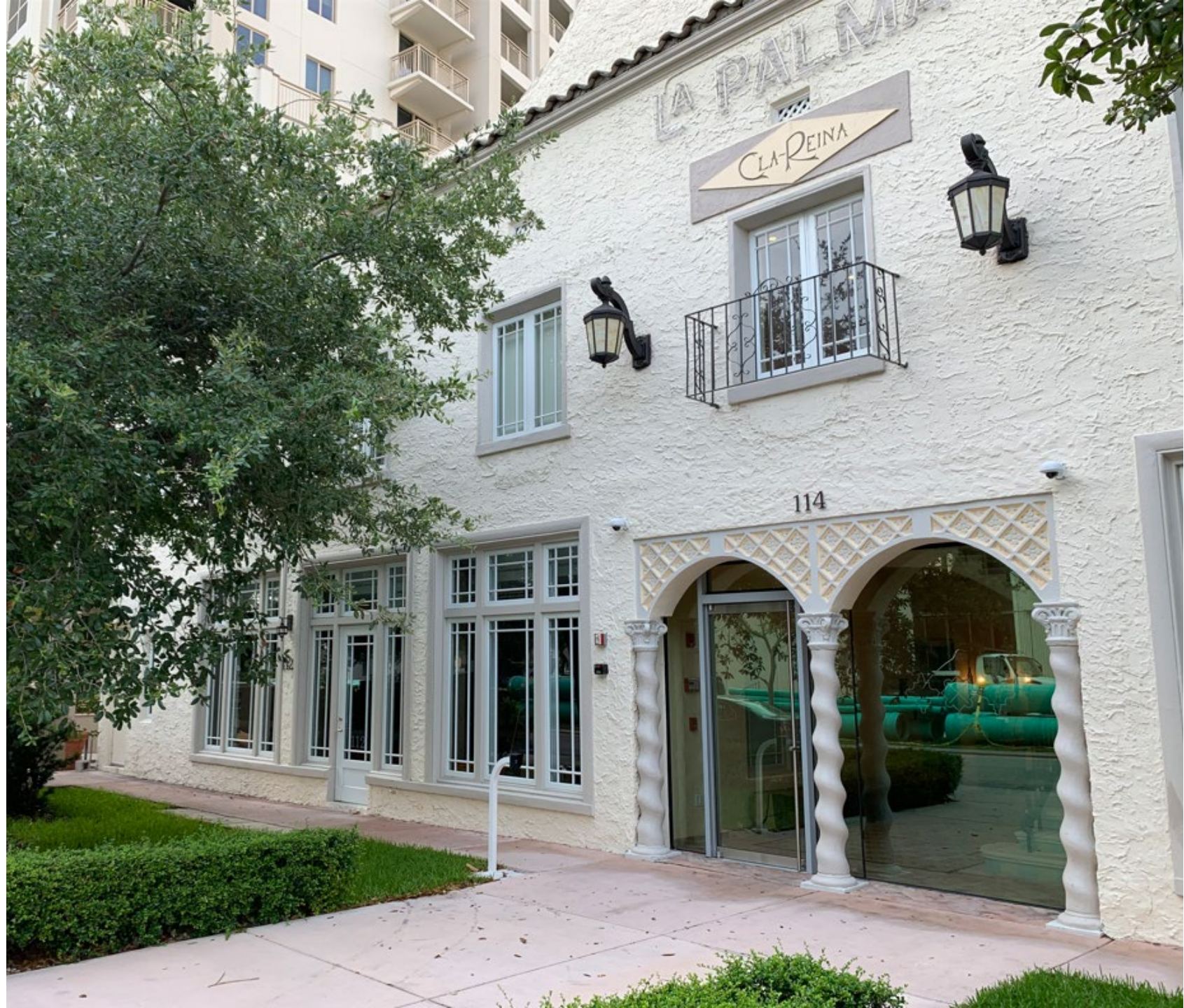
North Façade (east end) – After