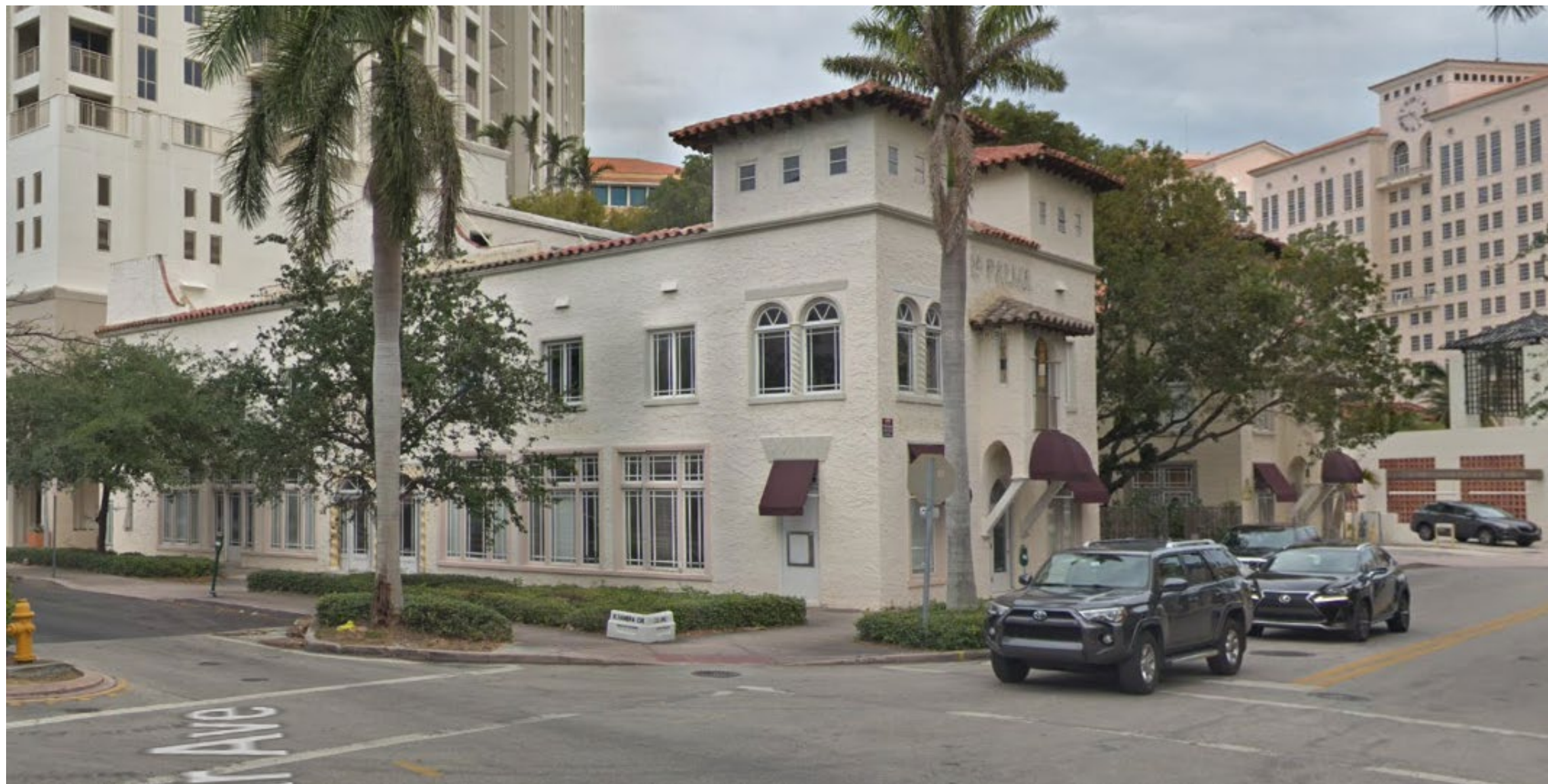
Northwest Corner – Before