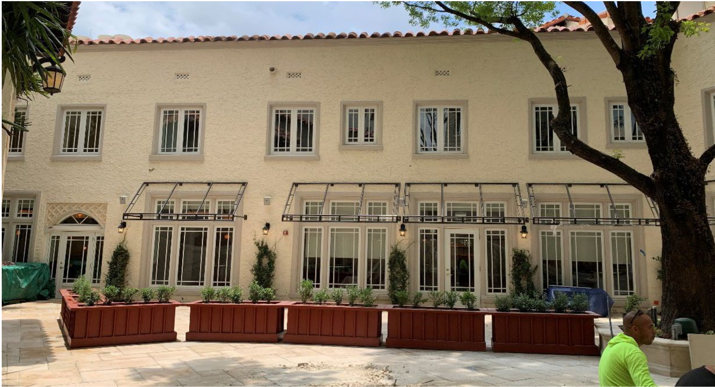
Courtyard Looking South –After