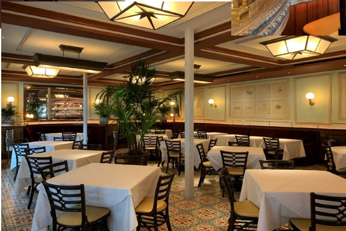
South Wing (Southwest Corner) – Before & After