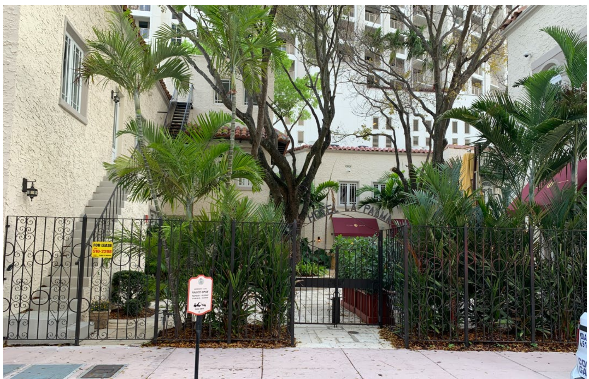
West Façade (looking into courtyard) – After