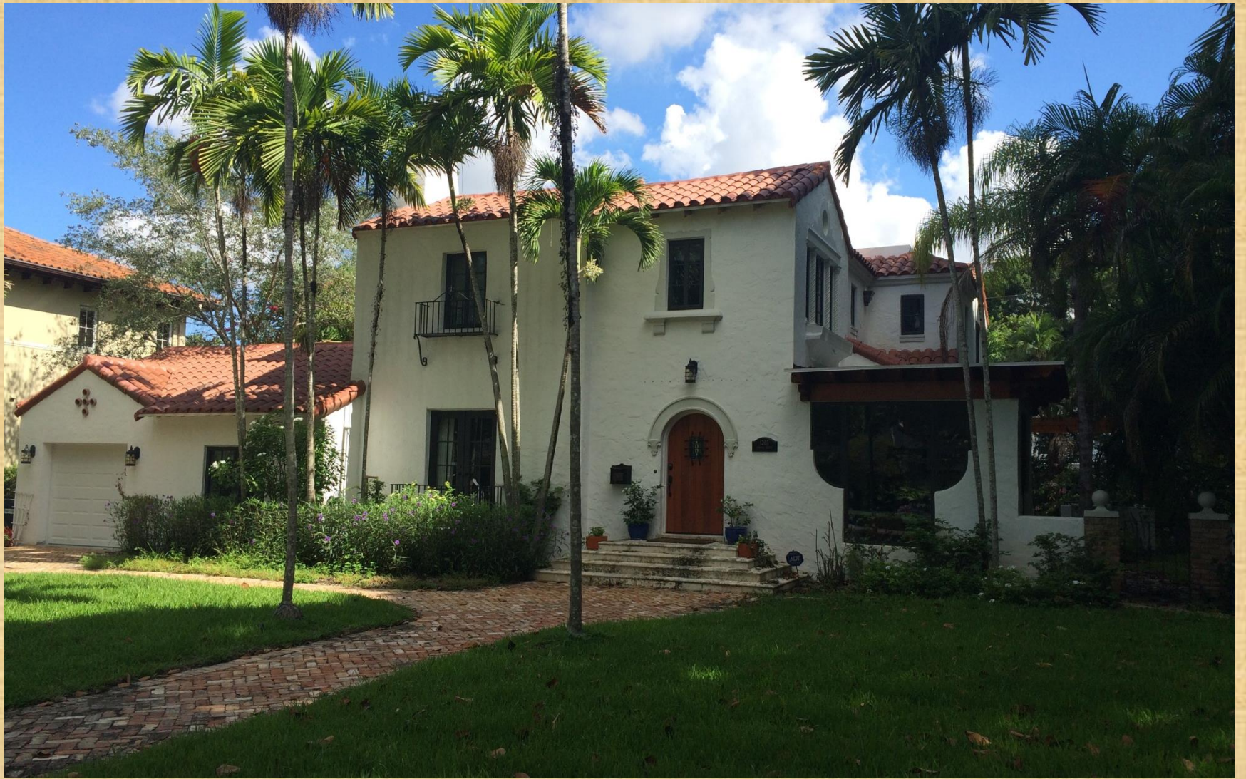
South Façade - After