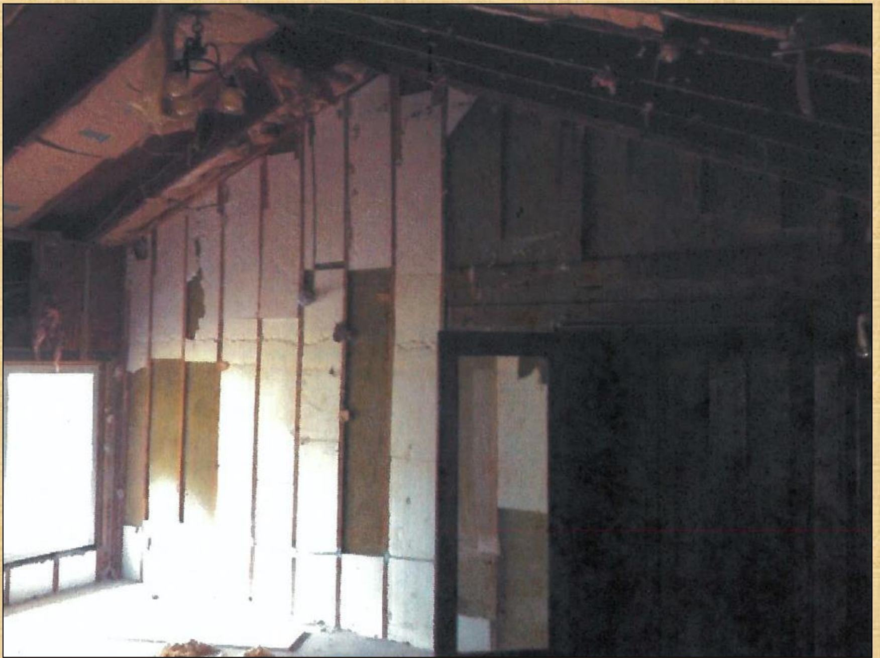
Library - Before