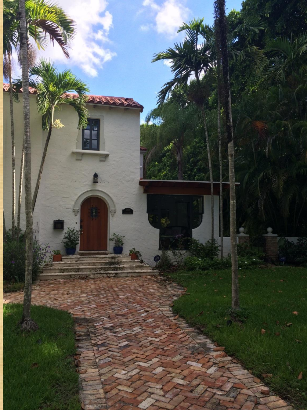
South Façade - After