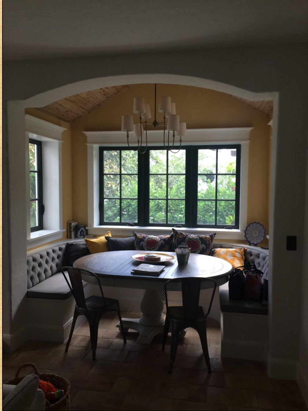
Breakfast Nook Area - After