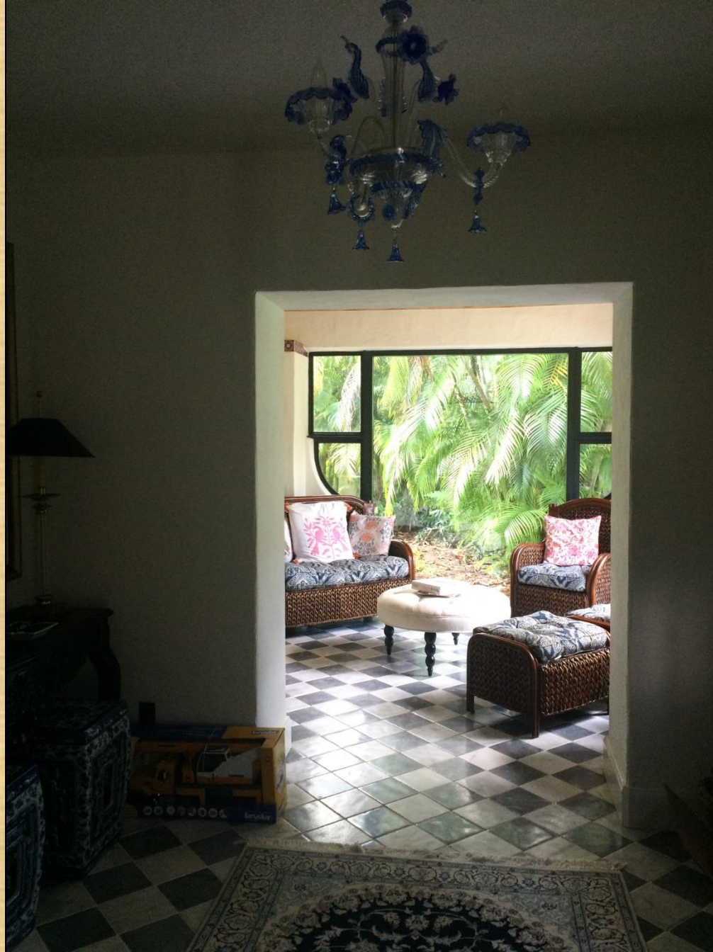
Entry & Enclosed Porch - After