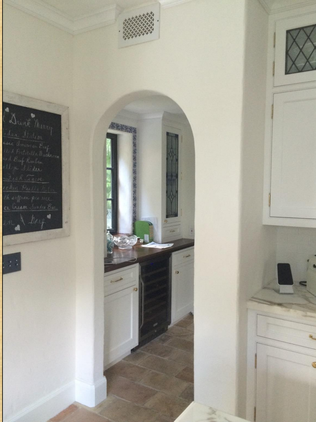
Kitchen Area - After