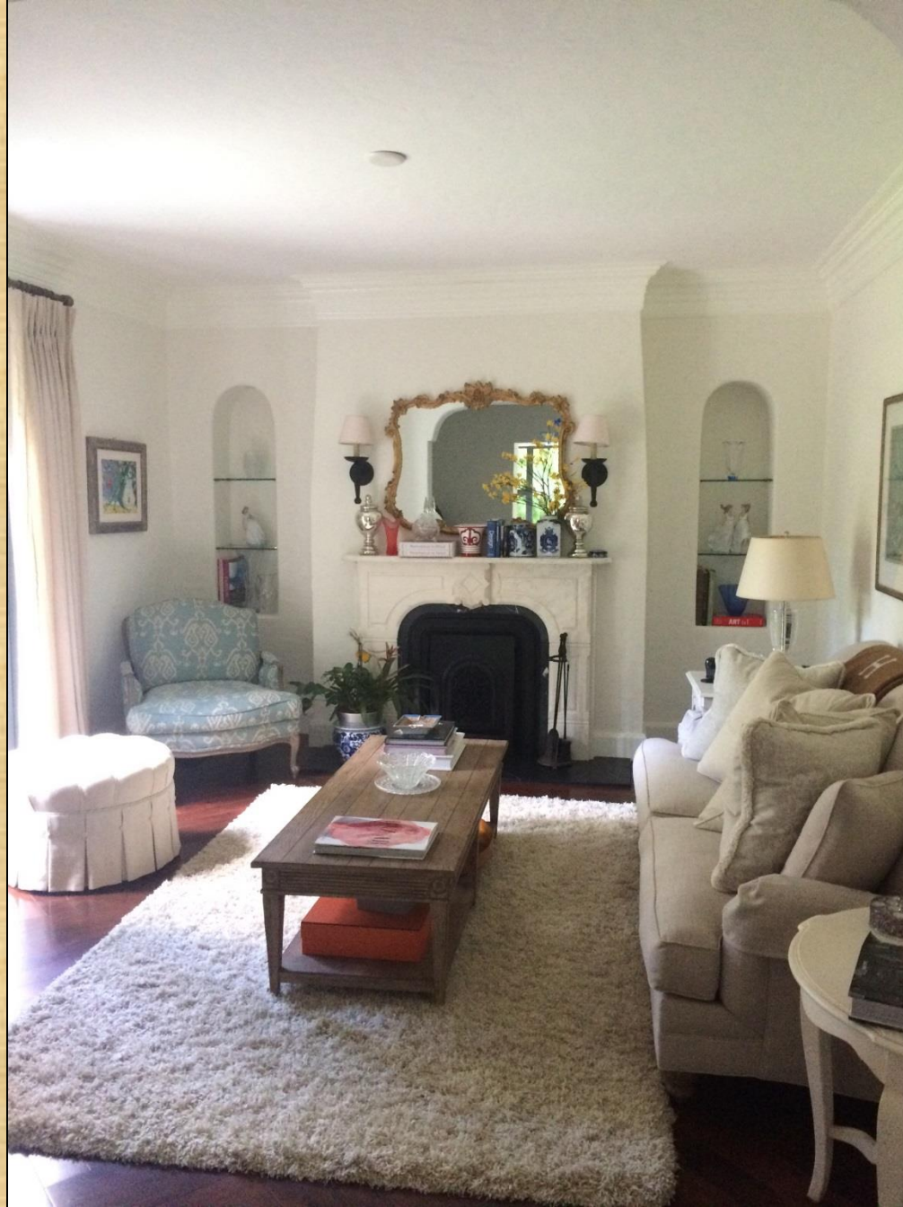
Living Room - After