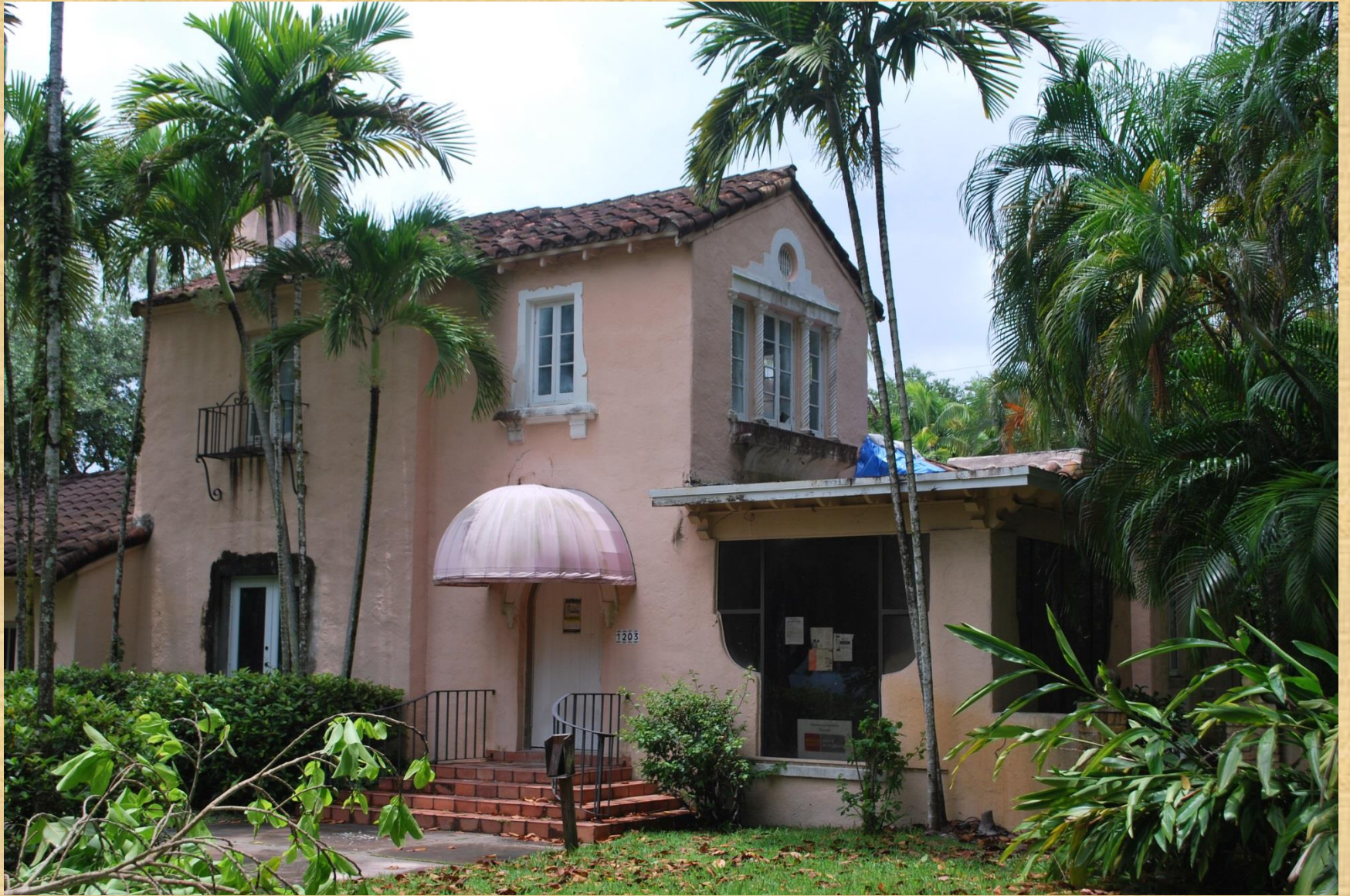
South Façade - Before