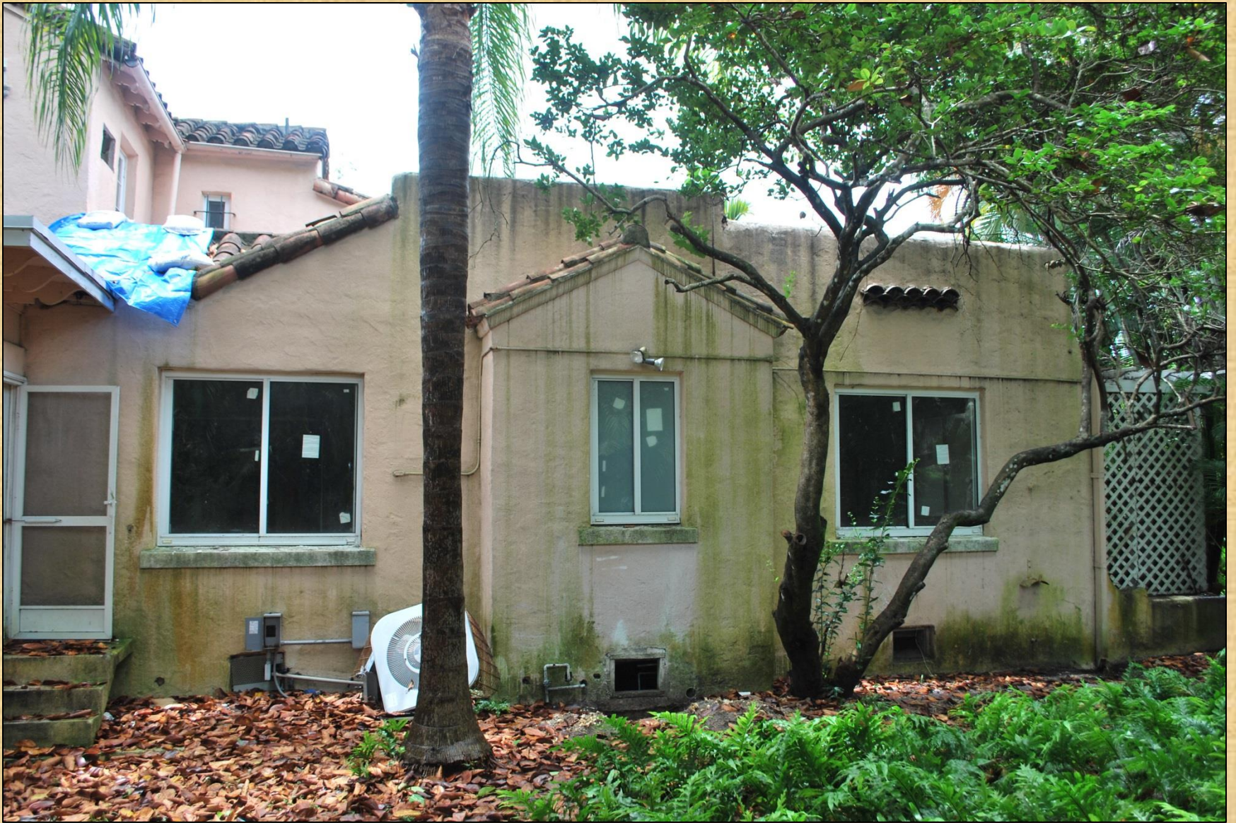
East Façade - Before