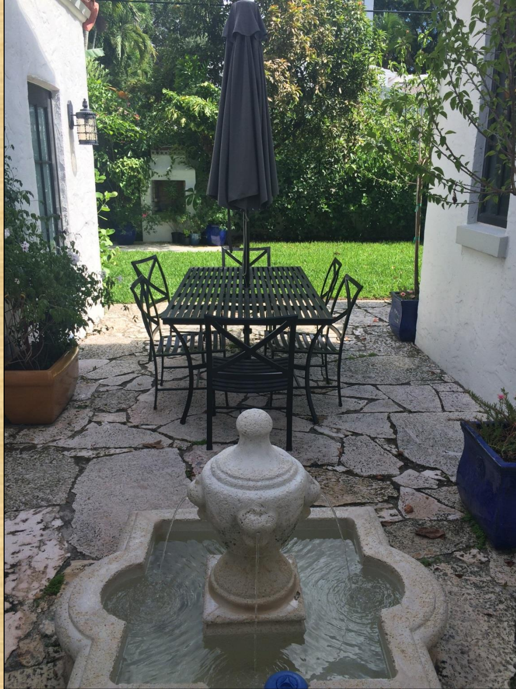
North Façade – Courtyard After