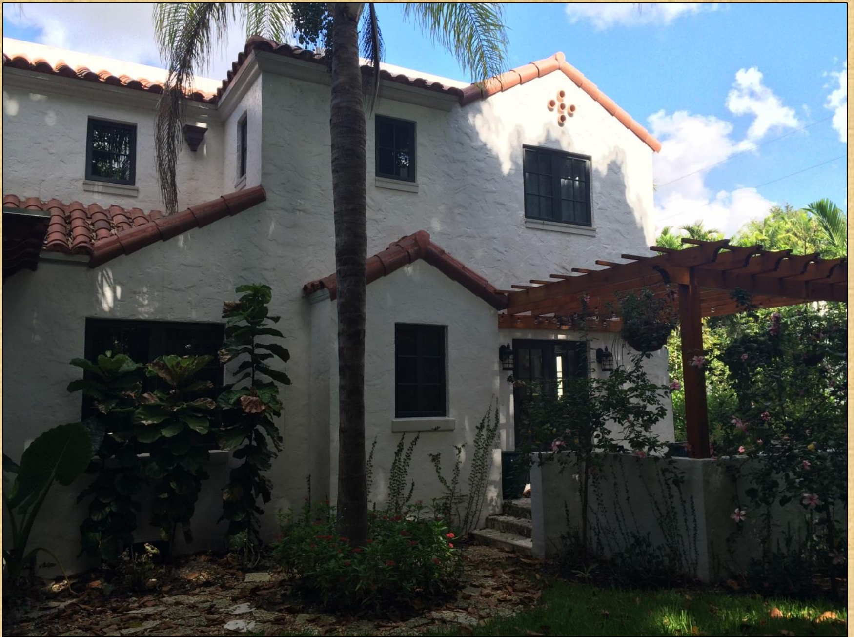
East Façade - After