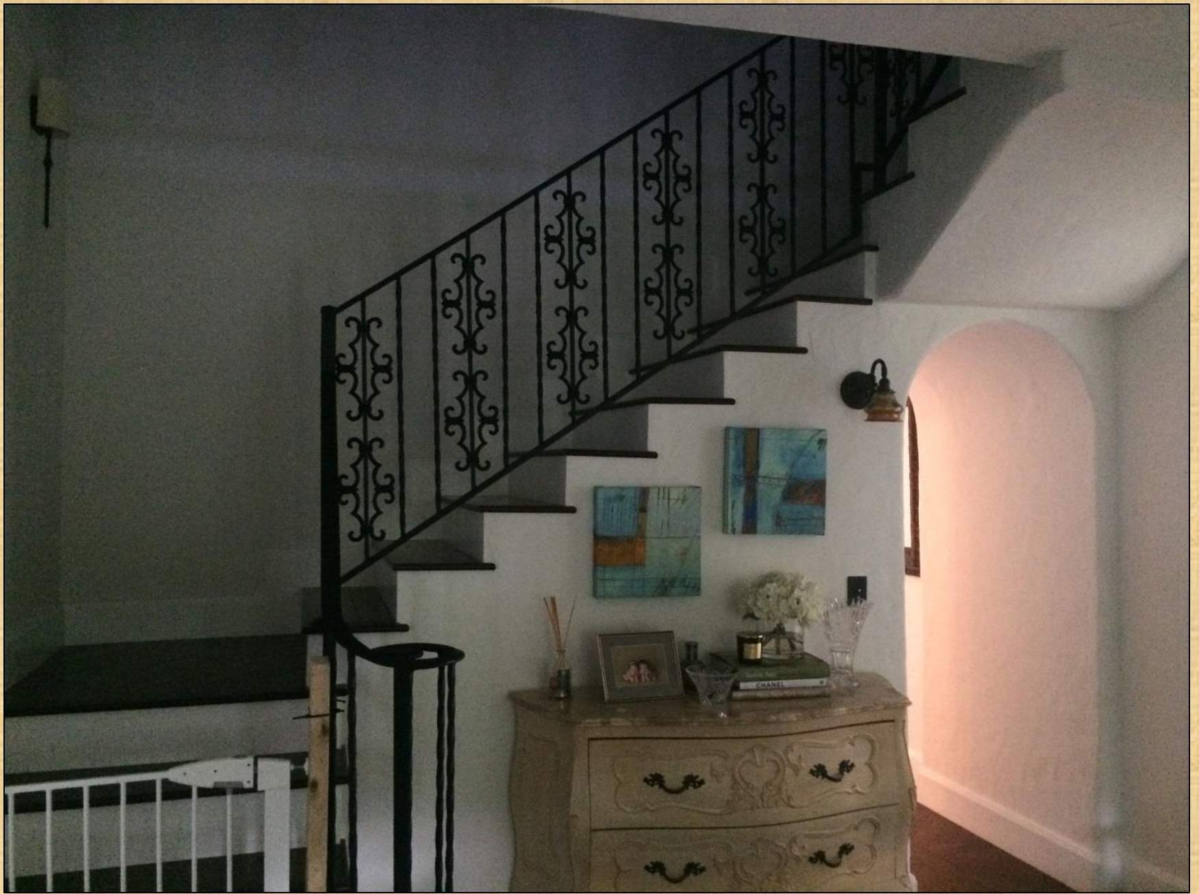
New Stair - After