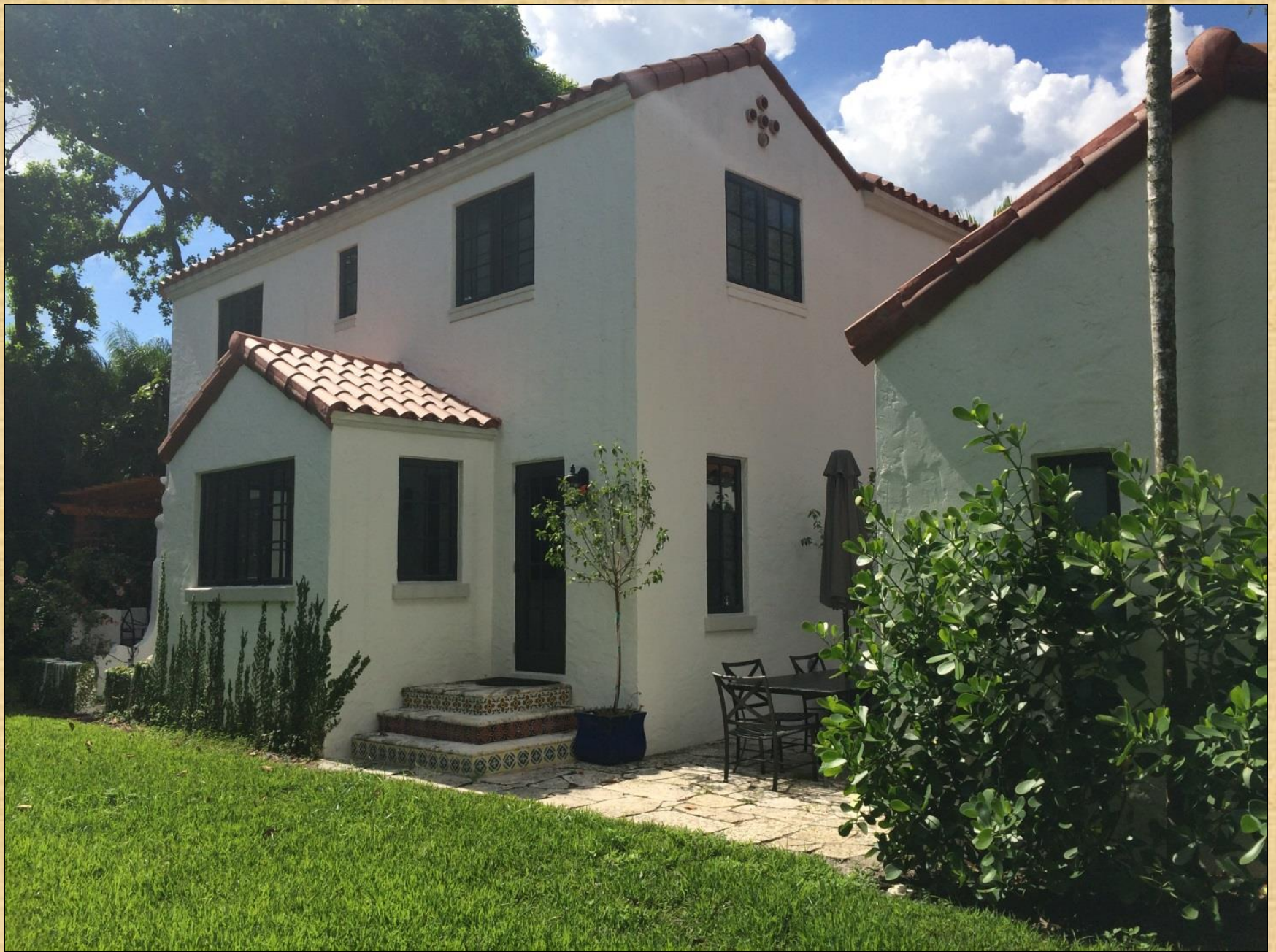
North Façade - After