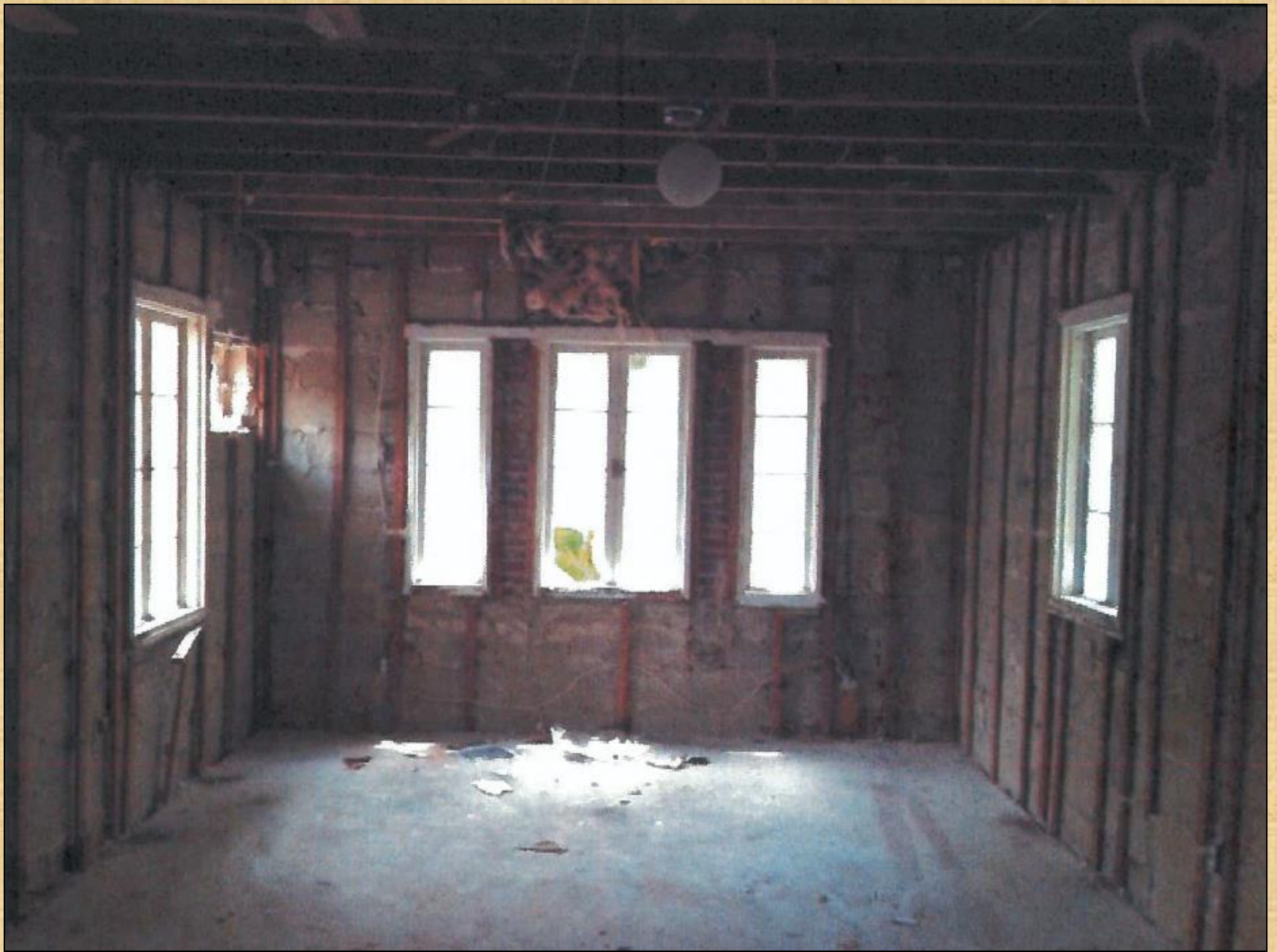
Master Bedroom - Before