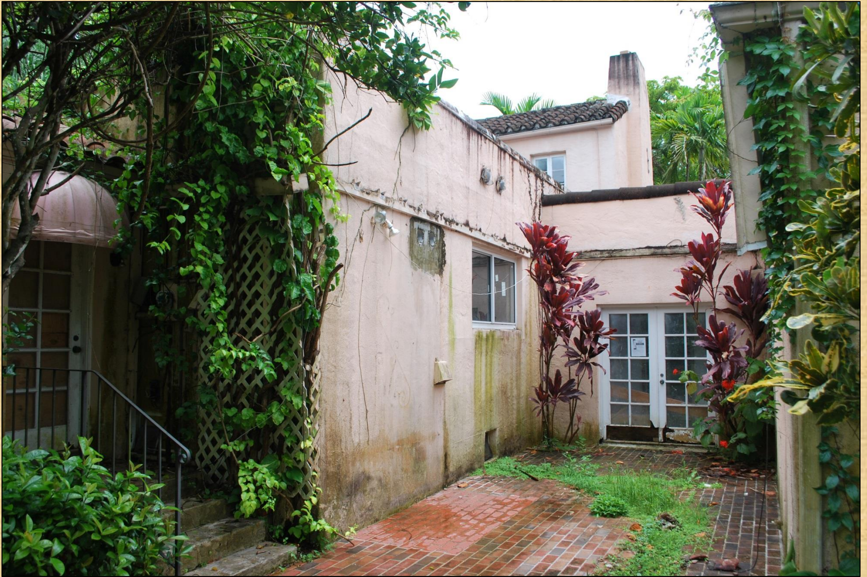
North Façade – Courtyard Before