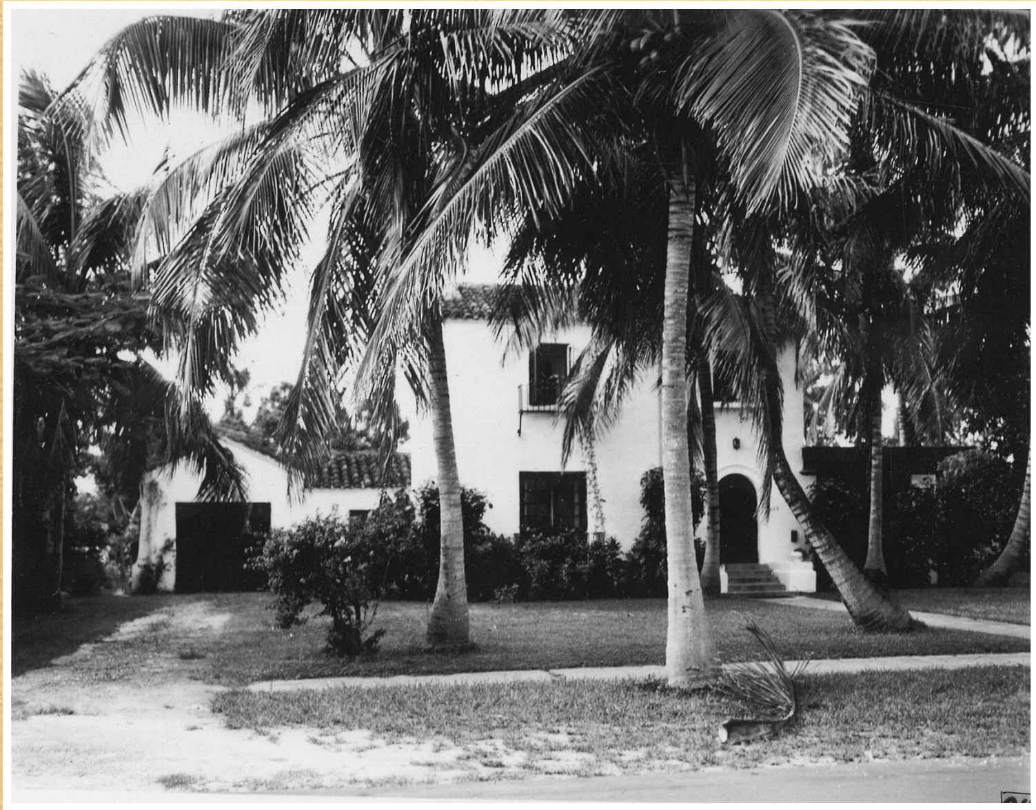
ca. 1940s photo of 1203 Asturia Avenue