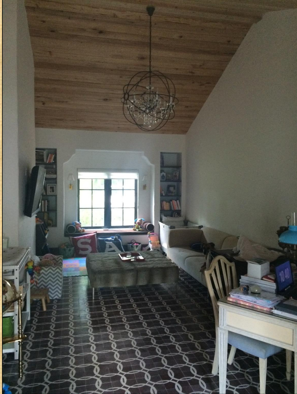
Library - After