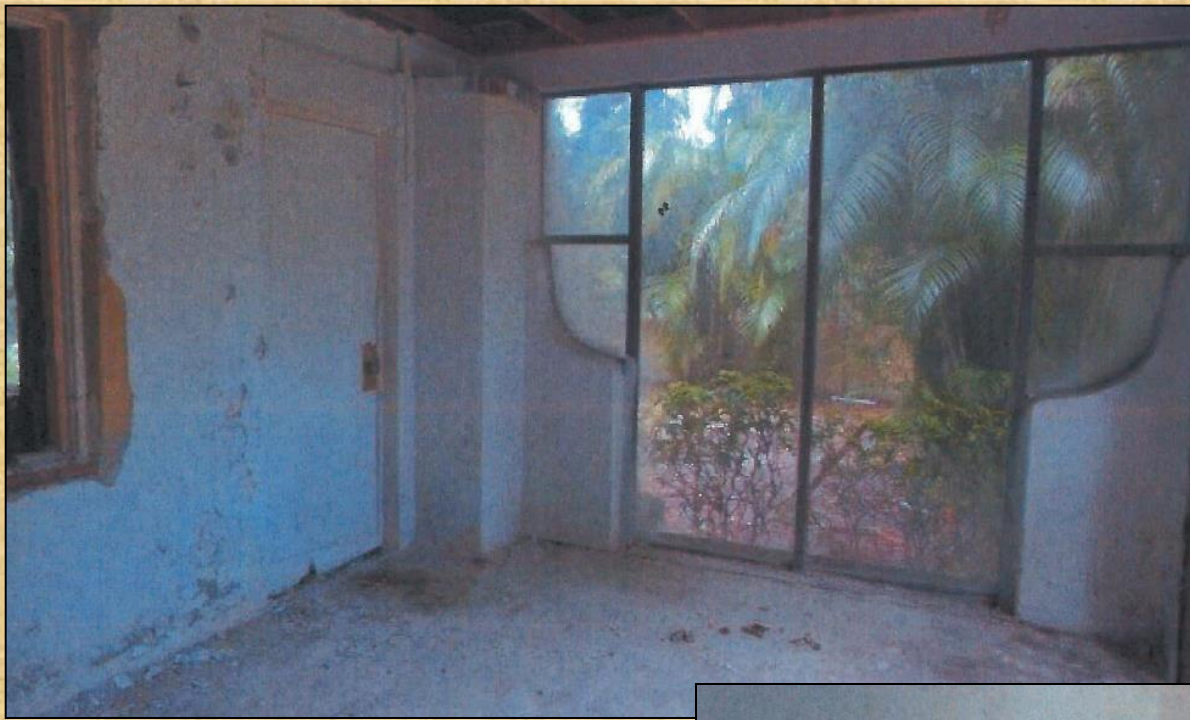
Enclosed Porch - Before