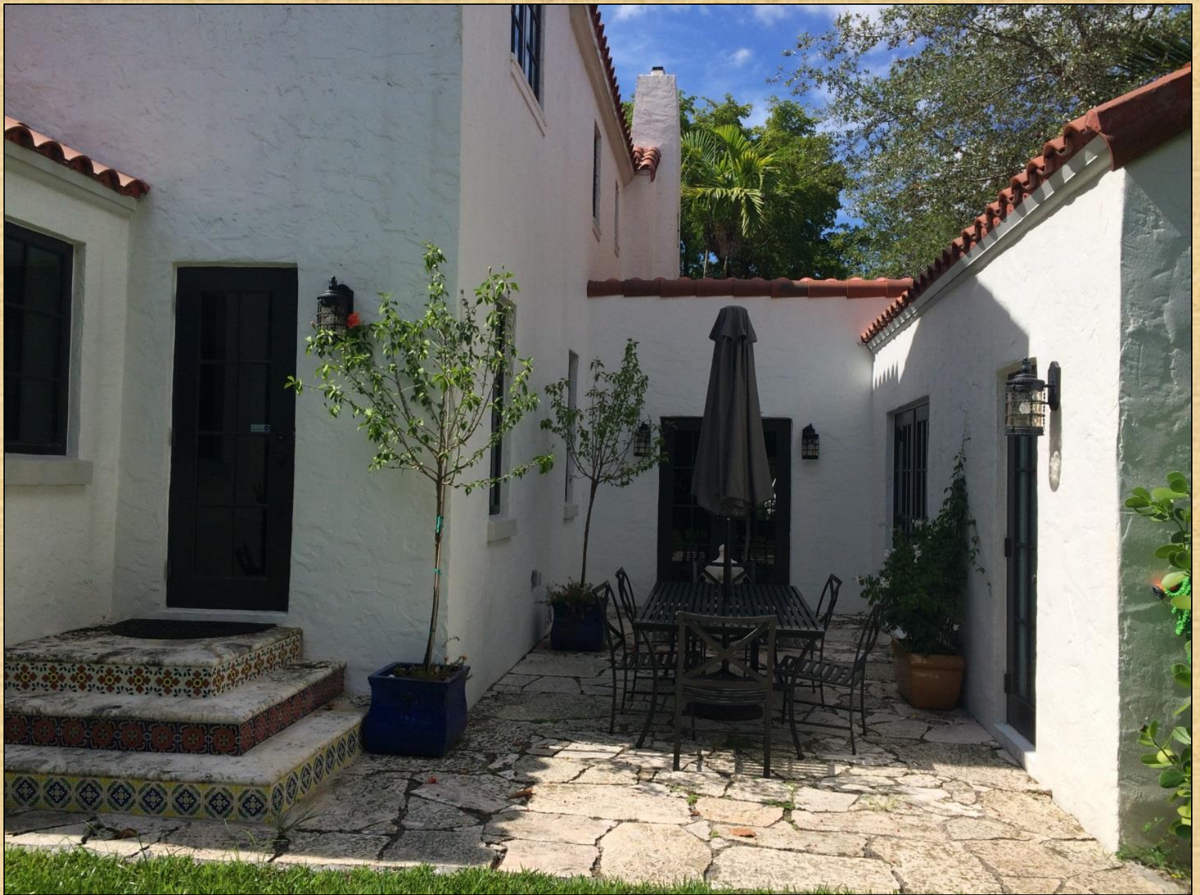
North Façade – Courtyard After