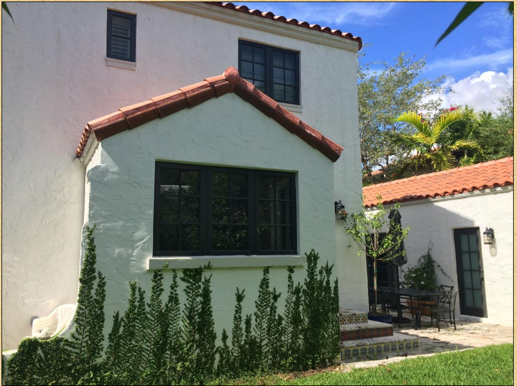
North Façade - After