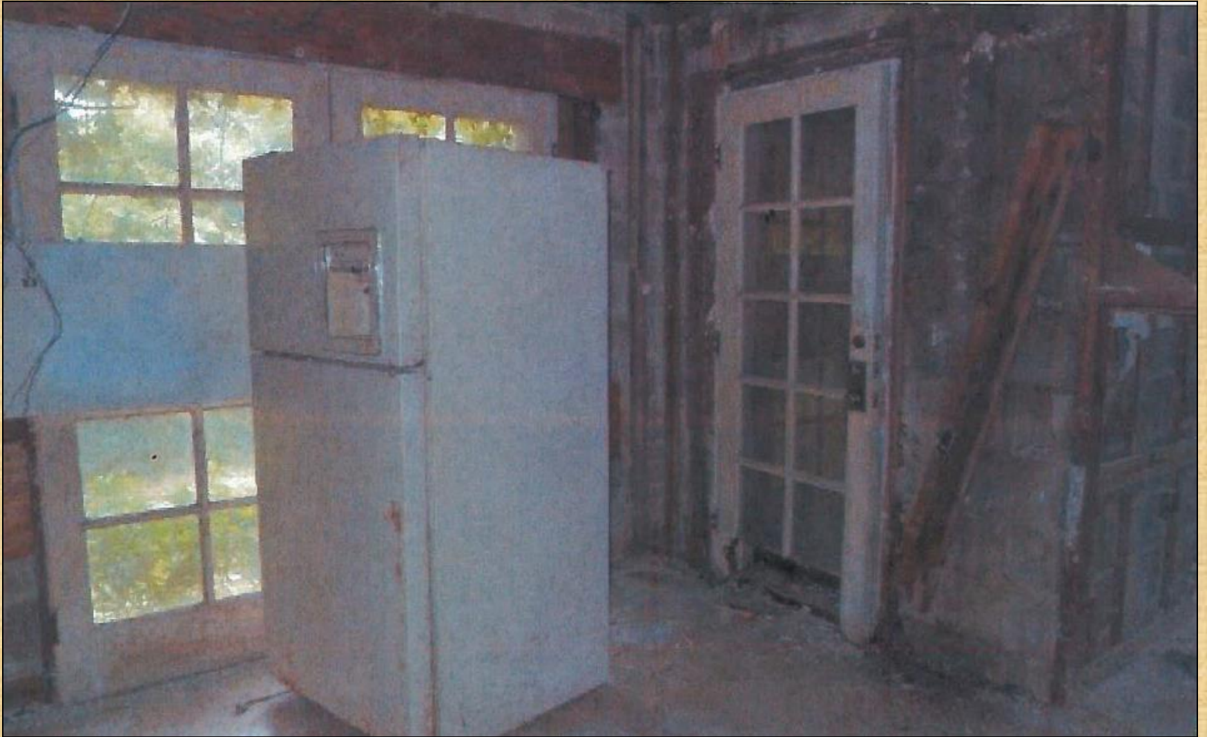
Breakfast Nook Area - Before