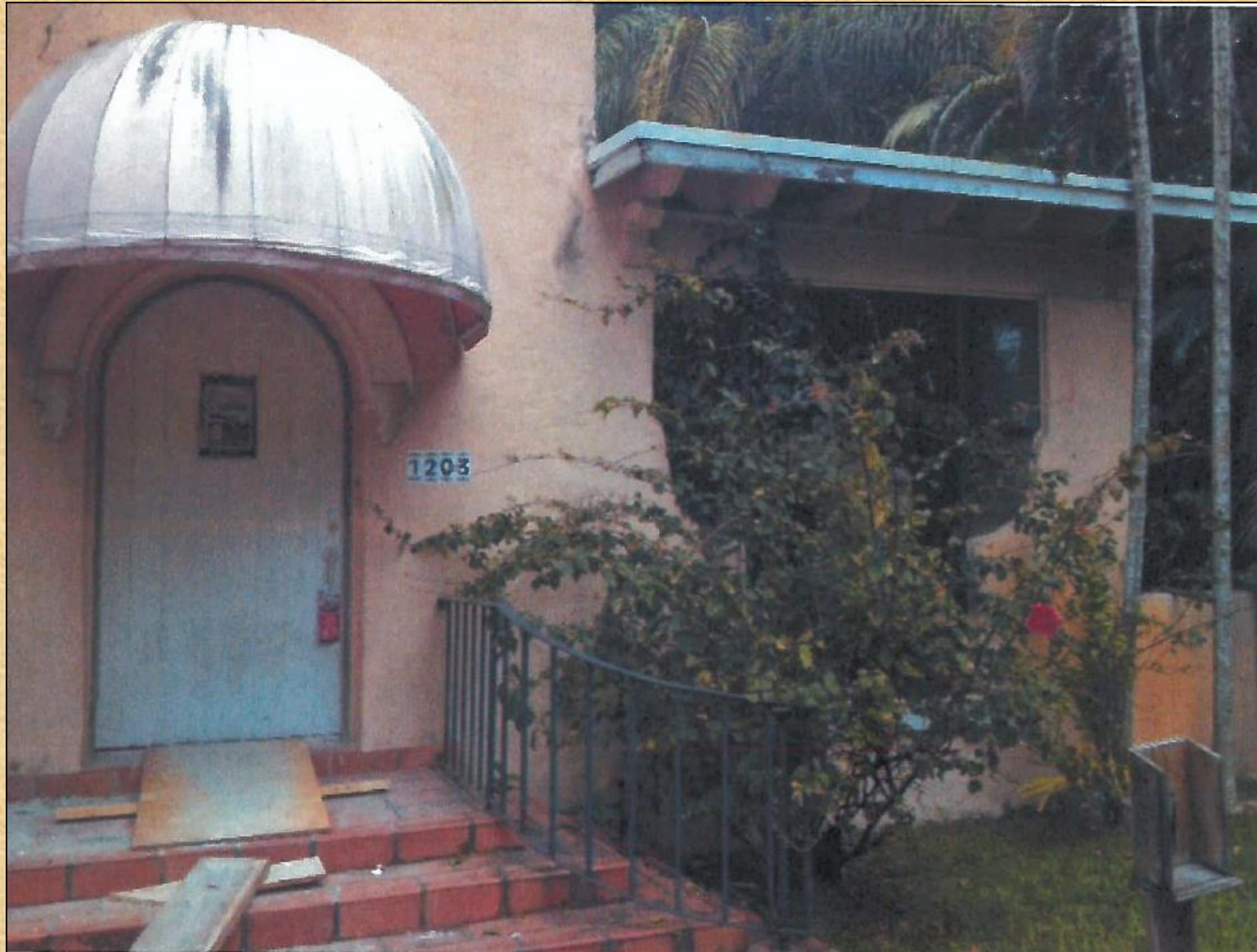
South Façade - Before