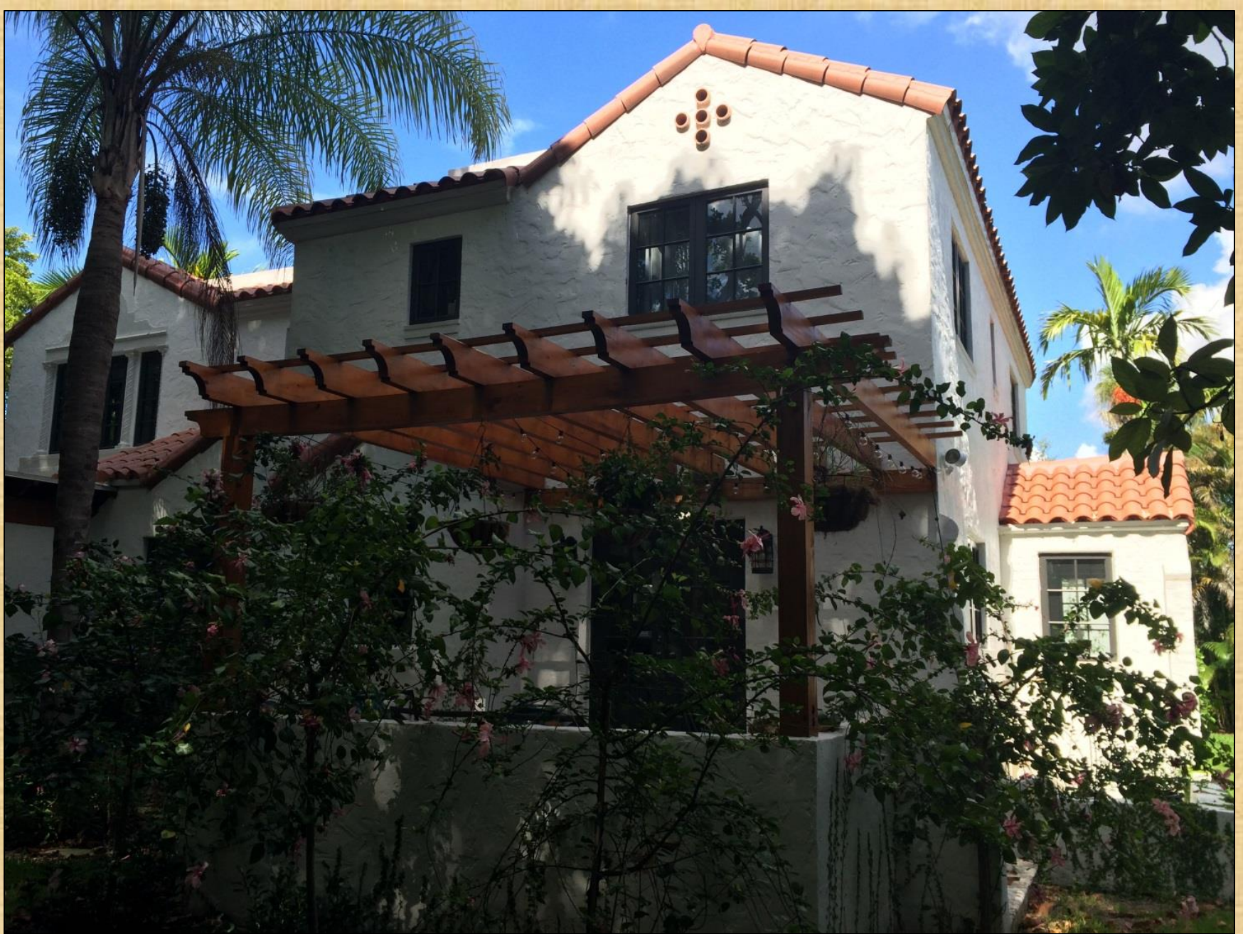
East Façade - After