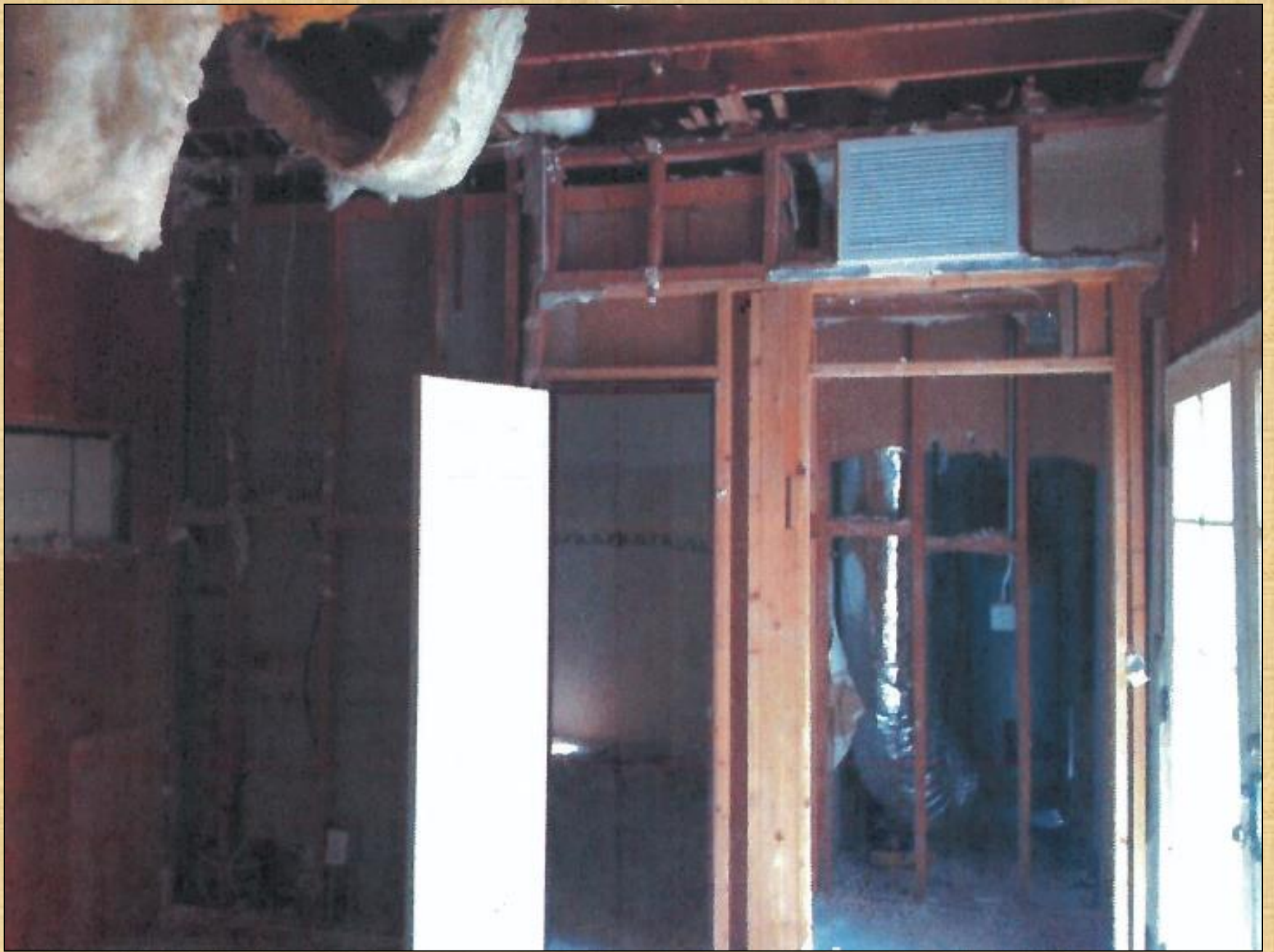
Study - Before