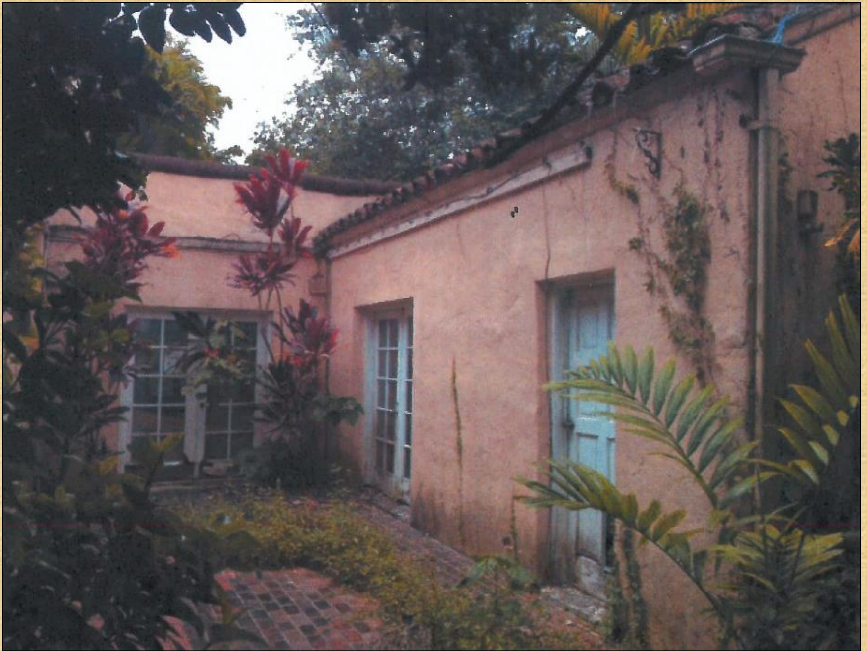
North Façade – Courtyard Before