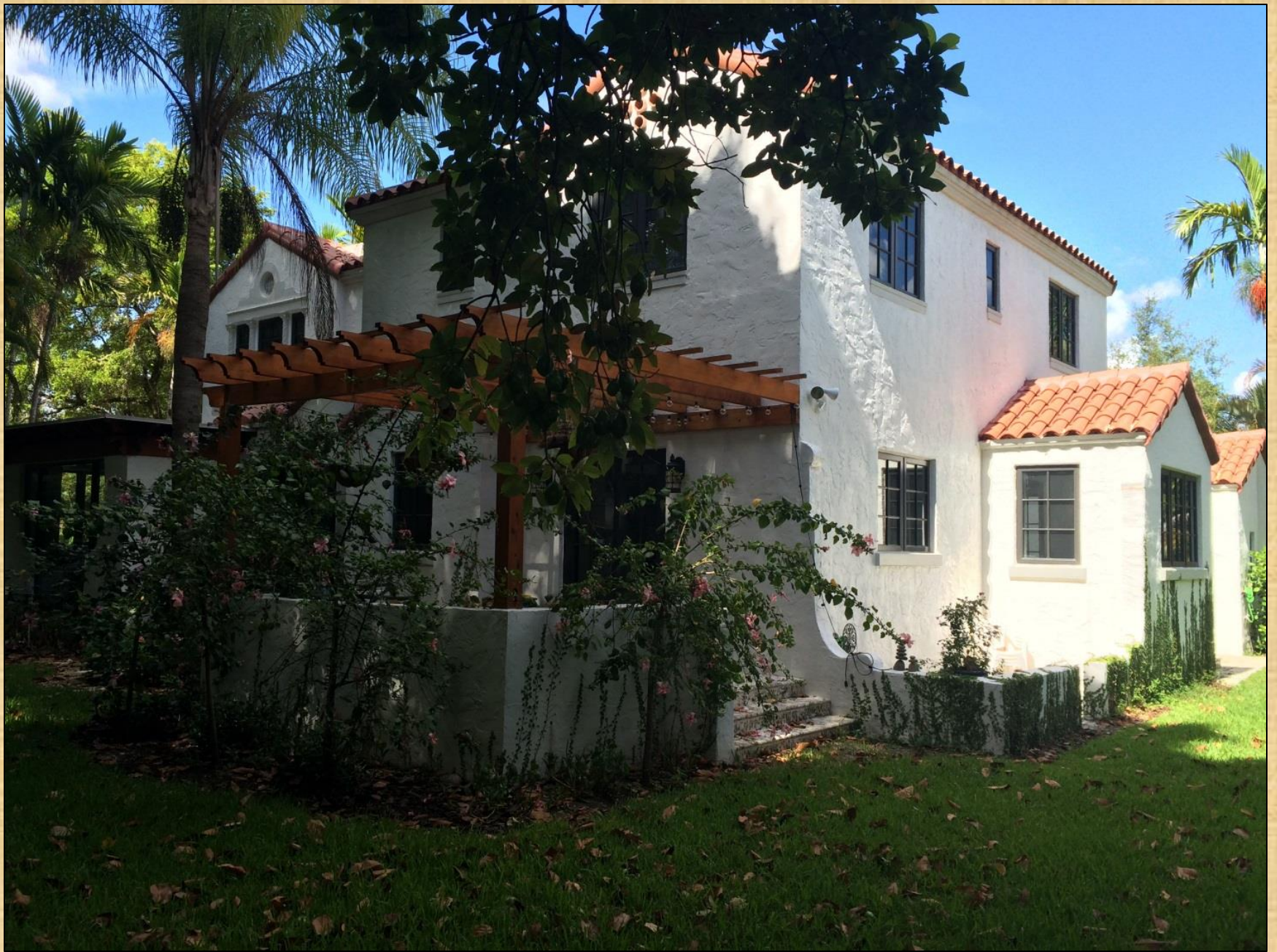
East Façade - After