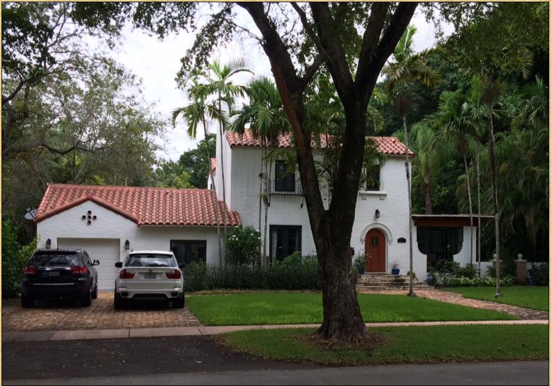
Current Photograph of 1203 Asturia Avenue – South Elevation