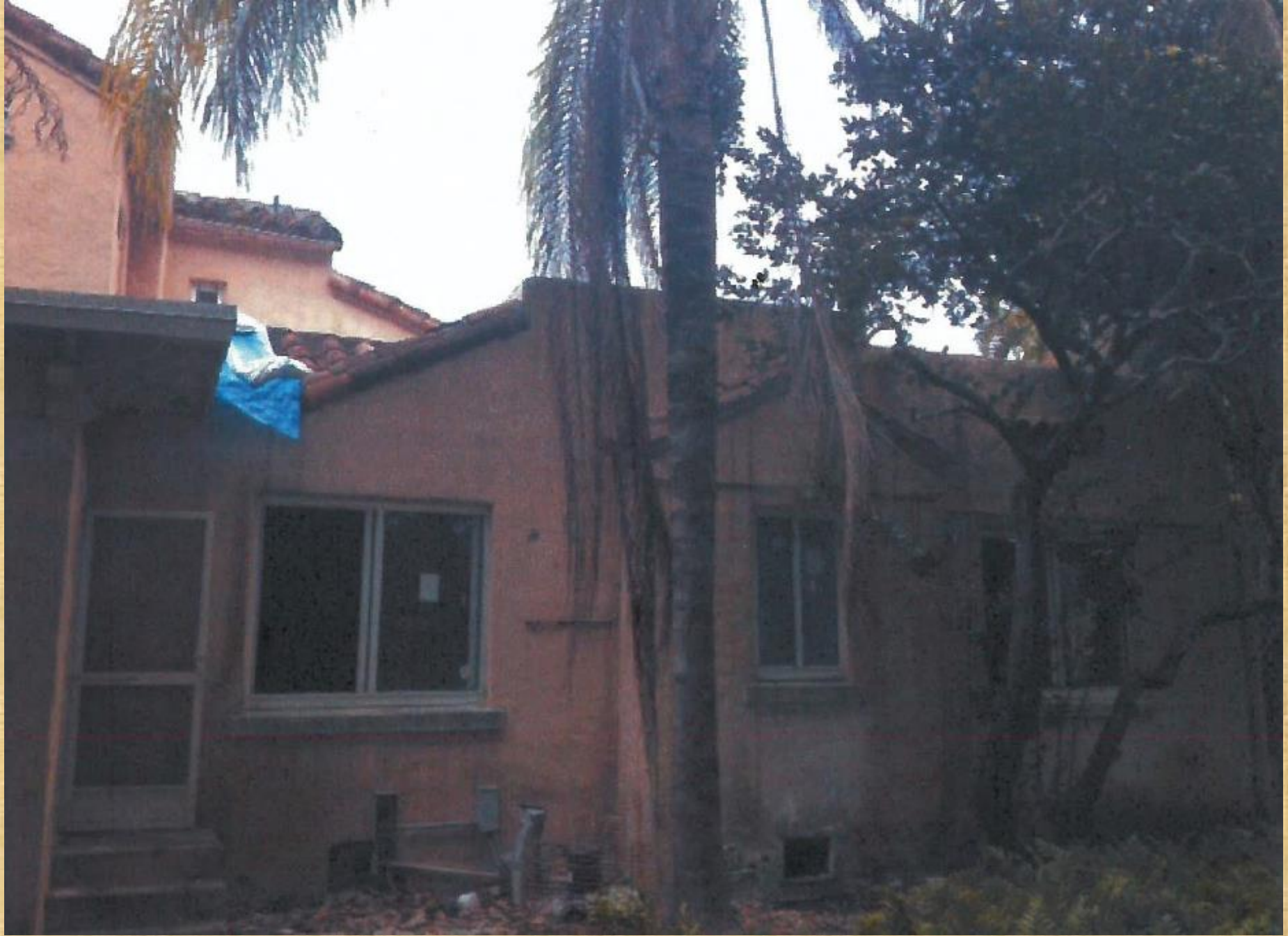
East Façade - Before