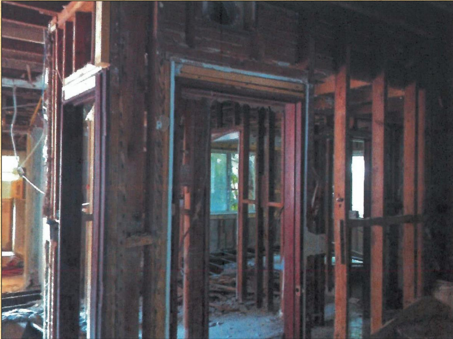
Kitchen Area - Before