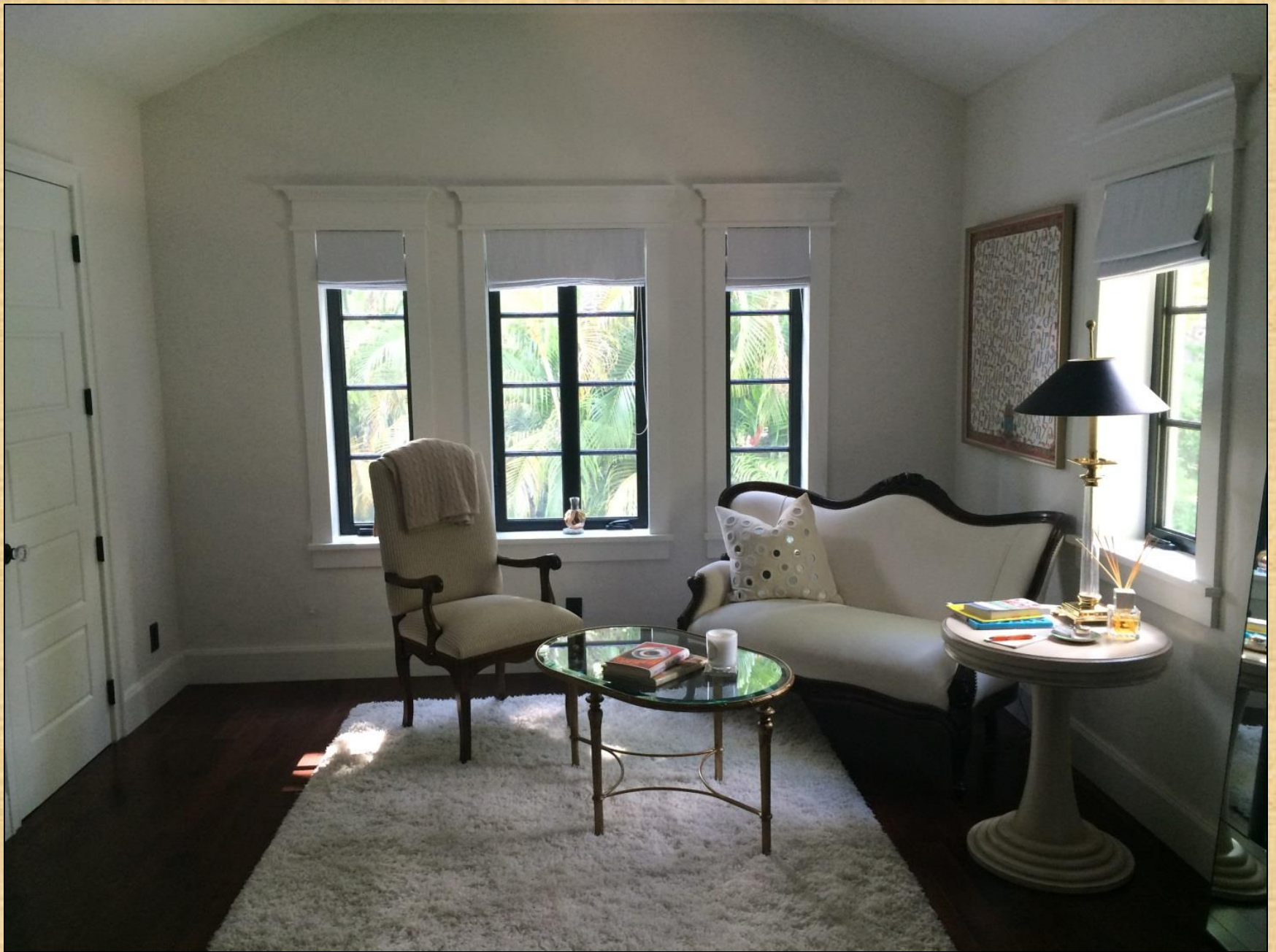
Master Bedroom - After