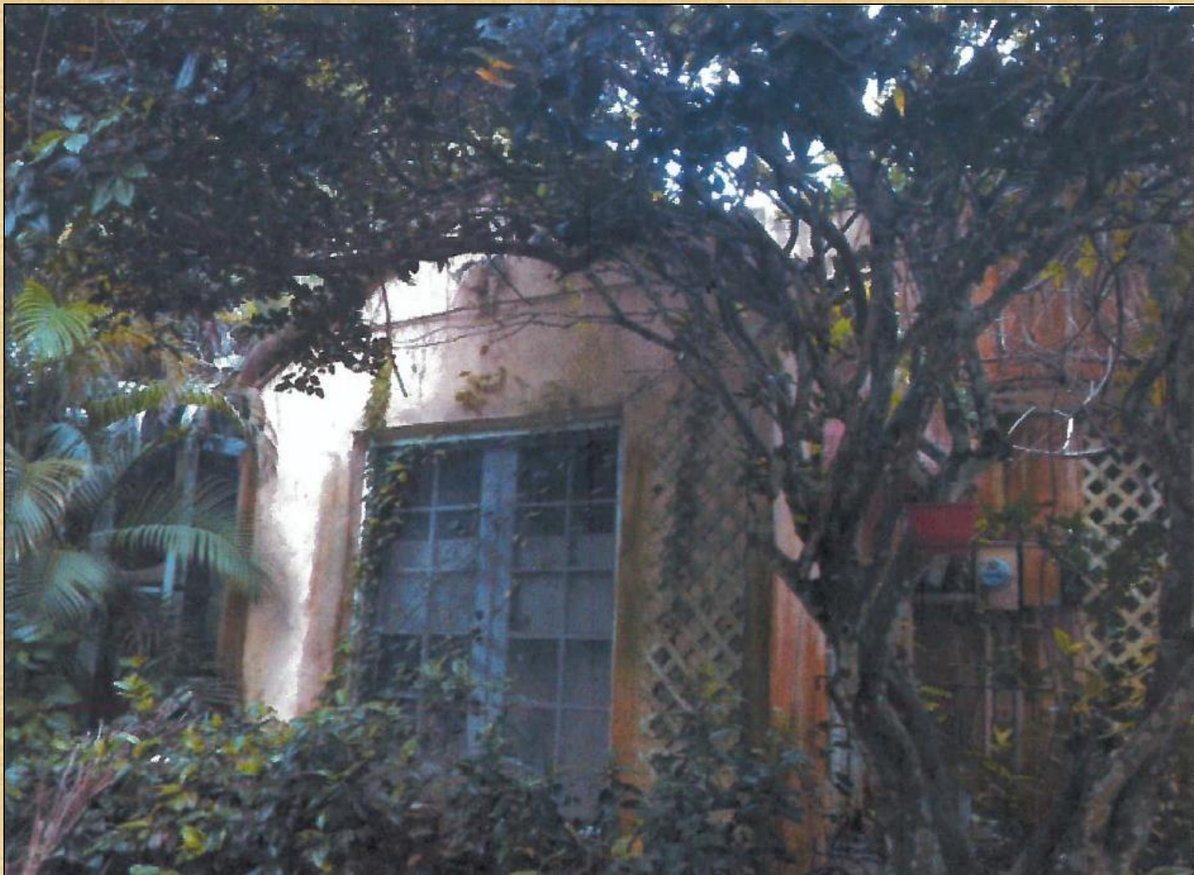
North Façade - Before