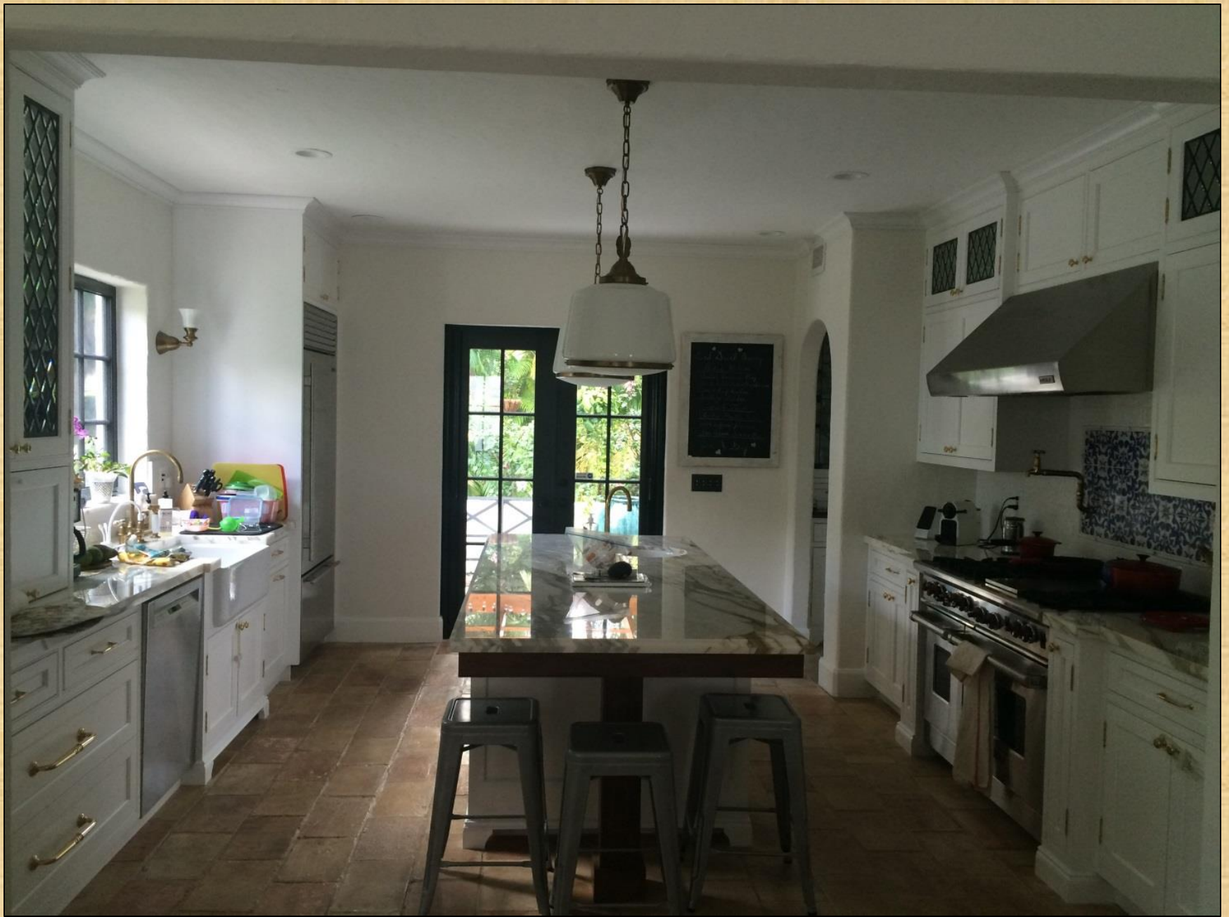
Kitchen Area - After