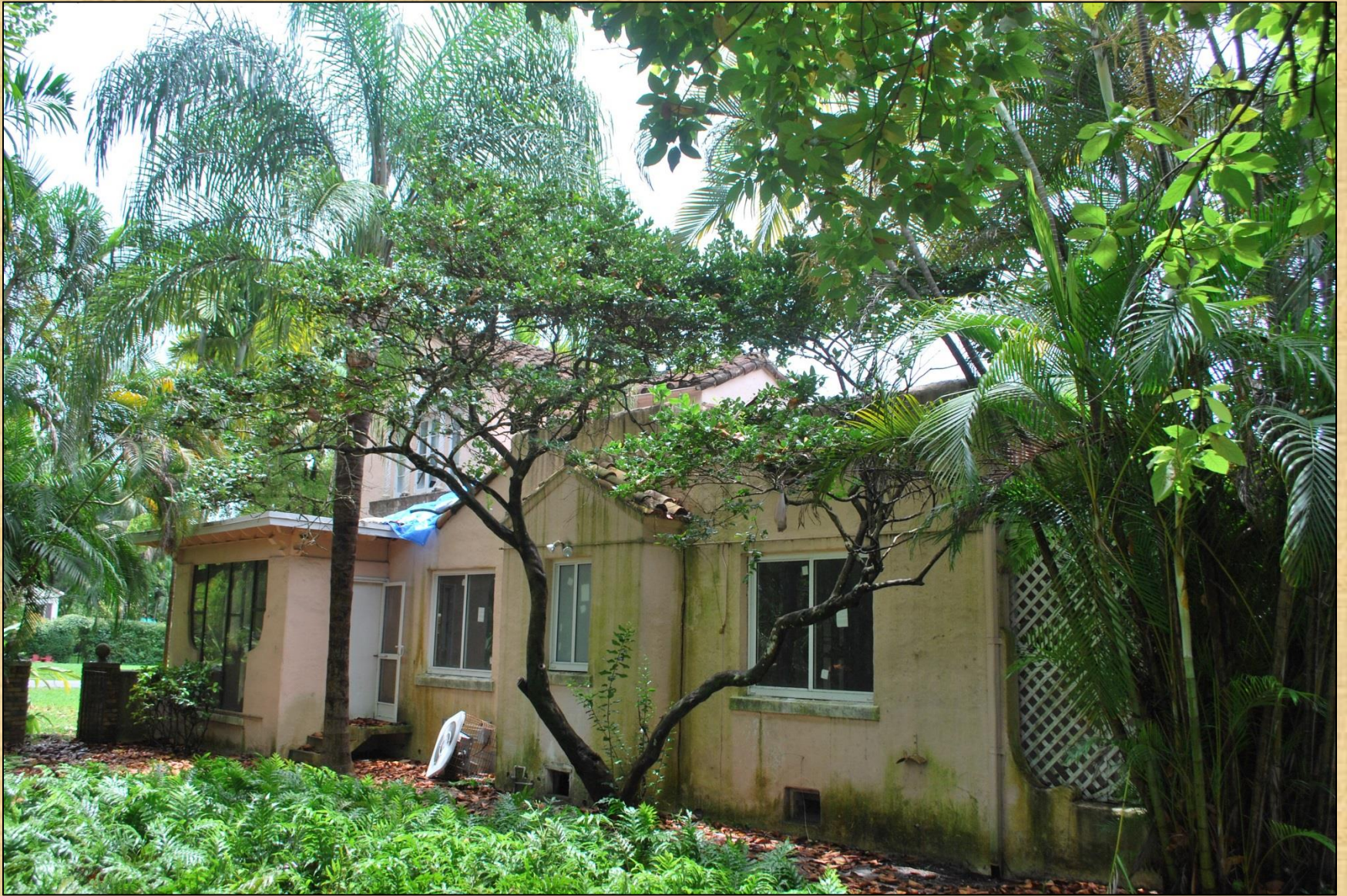
East Façade - Before