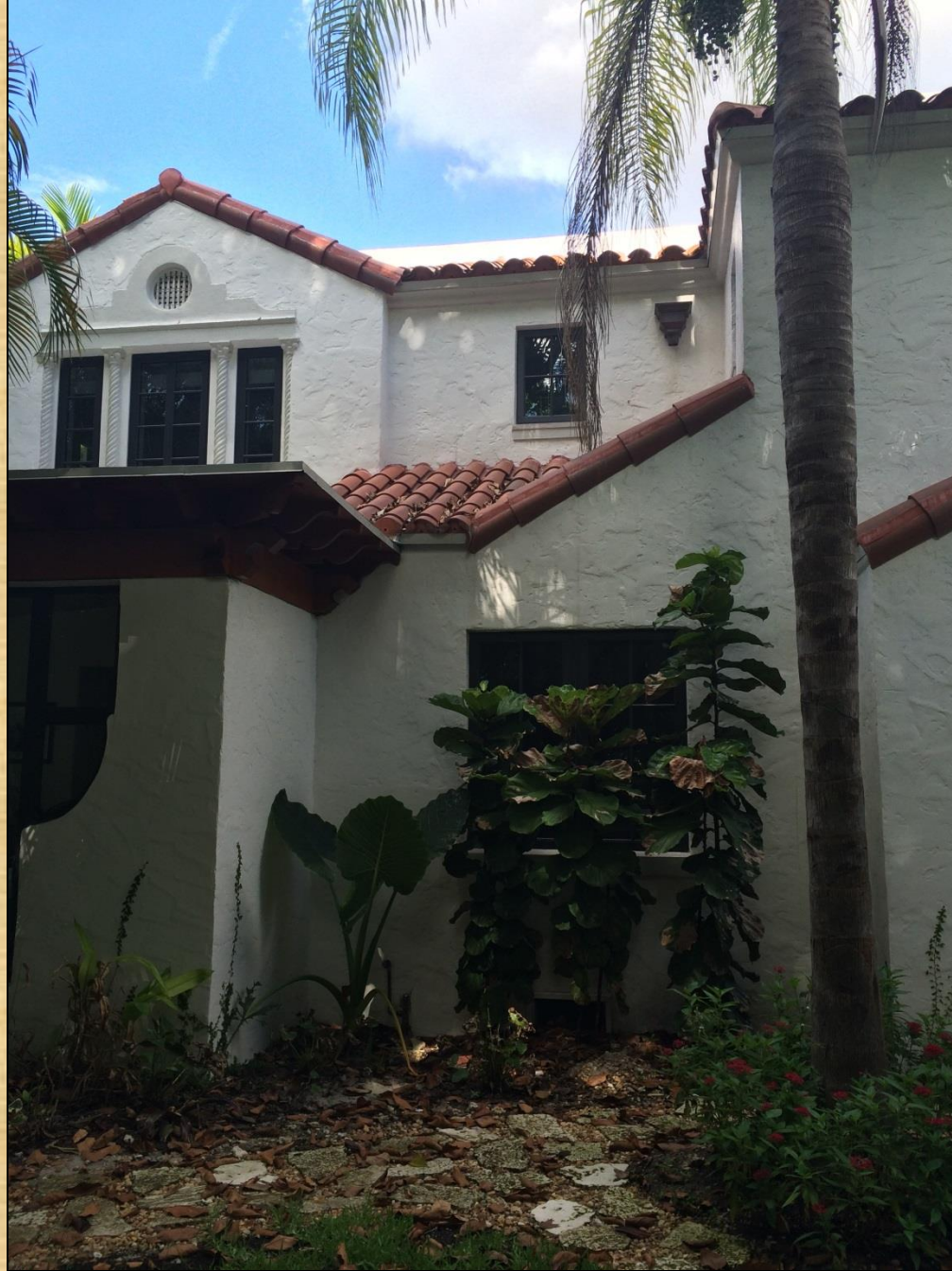
East Façade - After