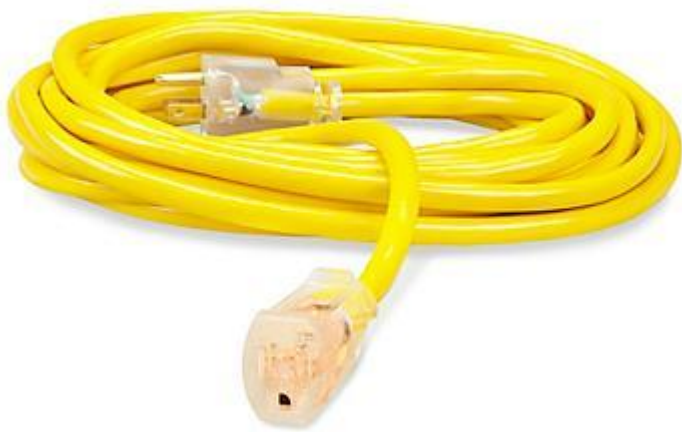
Heavy Duty Extension Cord UL/C-UL Listed MIN CONDUCTOR GAUGE 12/3 125V