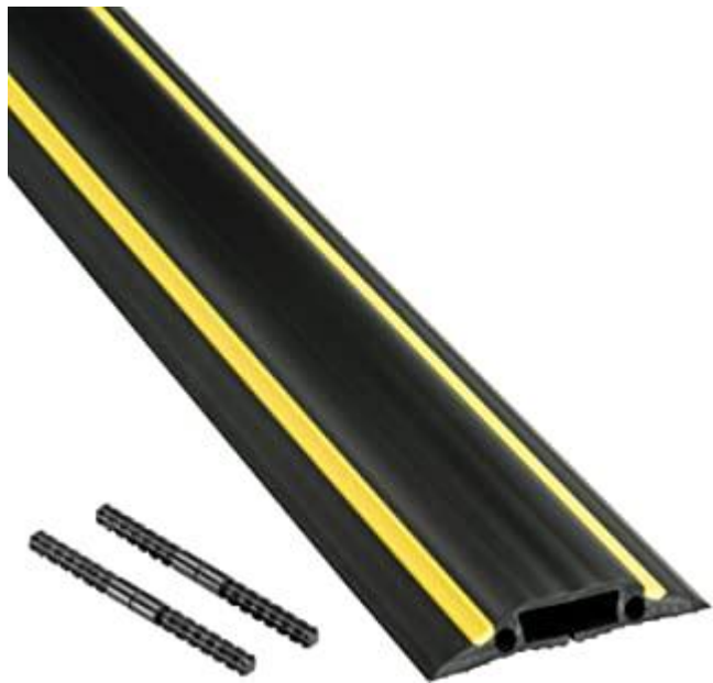
Floor Cord Cover Heavy Duty Cable Protector