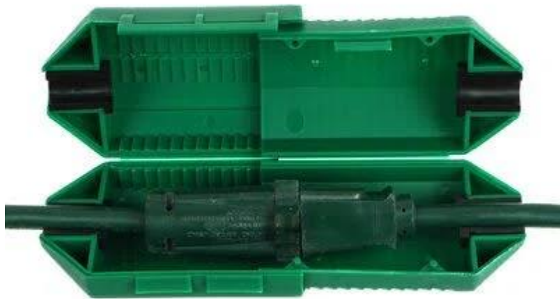
Protective Safety Cover Water-Resistant Indoor Outdoor