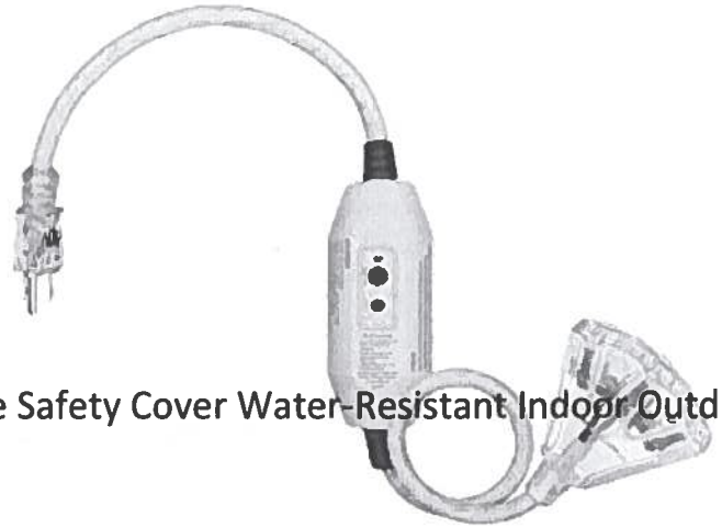
Protective Safety Cover Water-Resistant Indoor Outdoor

Floor Cord Cover Heavy Duty Cable Protector