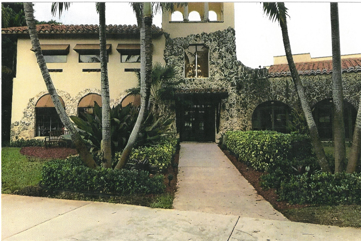
Coral Gables Country Club pictured today with Arcadian lamps missing