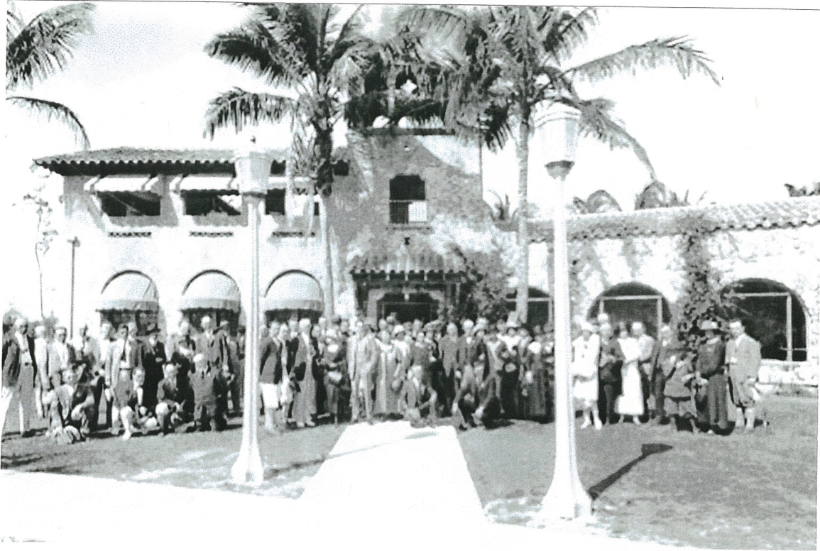
Country Club Feb 22, 1925 with two Arcadian lamps with Westinghouse Octoganal Junior light fixtures