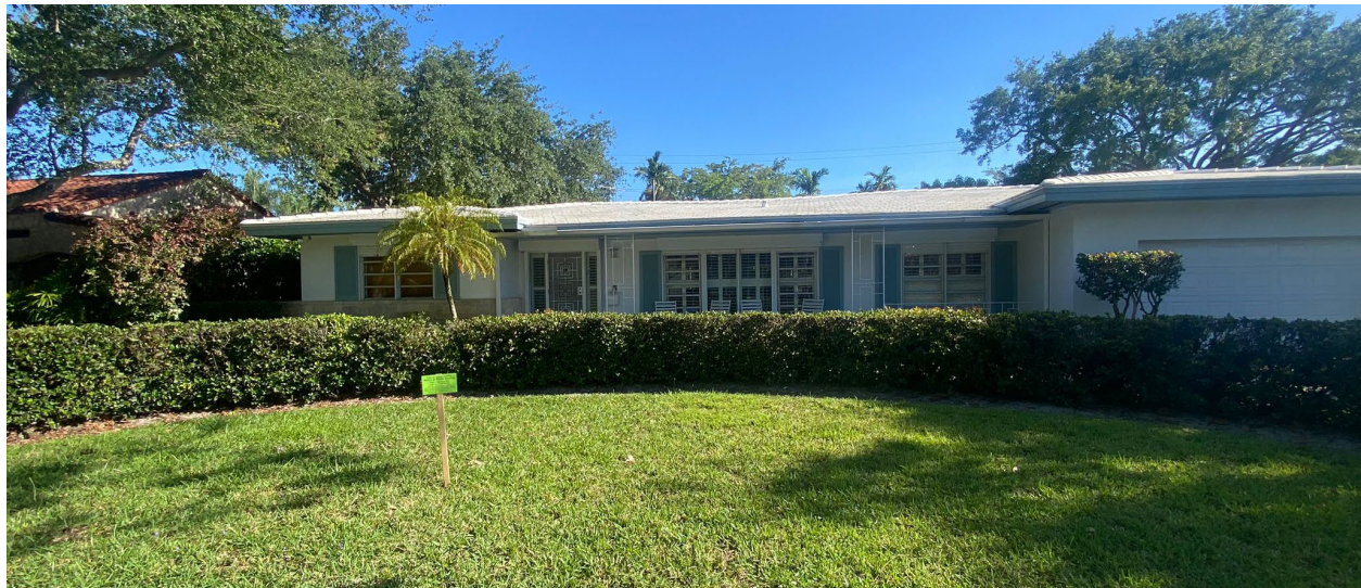
Figure 2: Current photo provided by applicant, April 2024