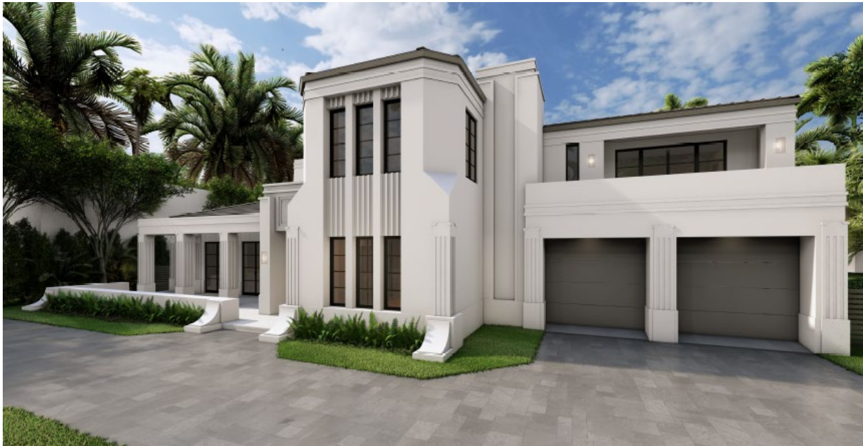
Figure 3: Proposed Rendering