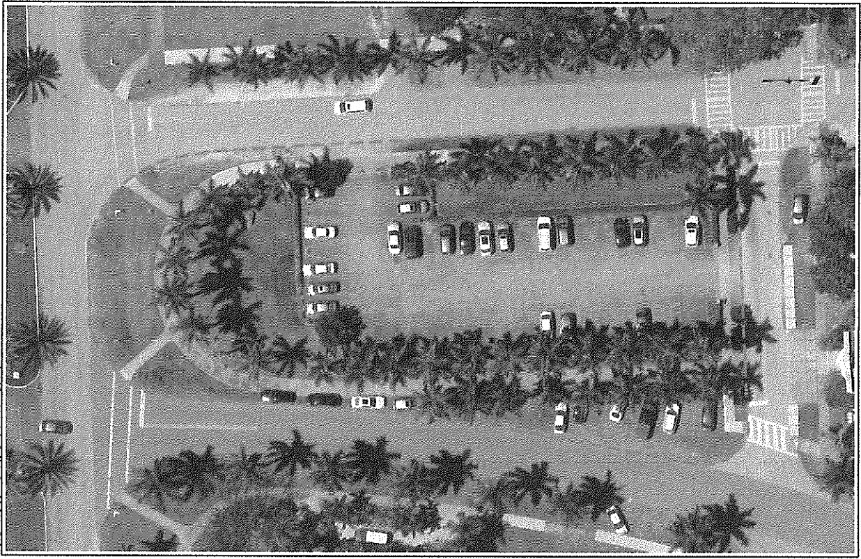
EXHIBIT "A" PREMISES