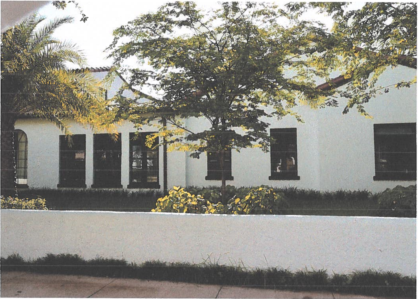
West facade along Durango Street