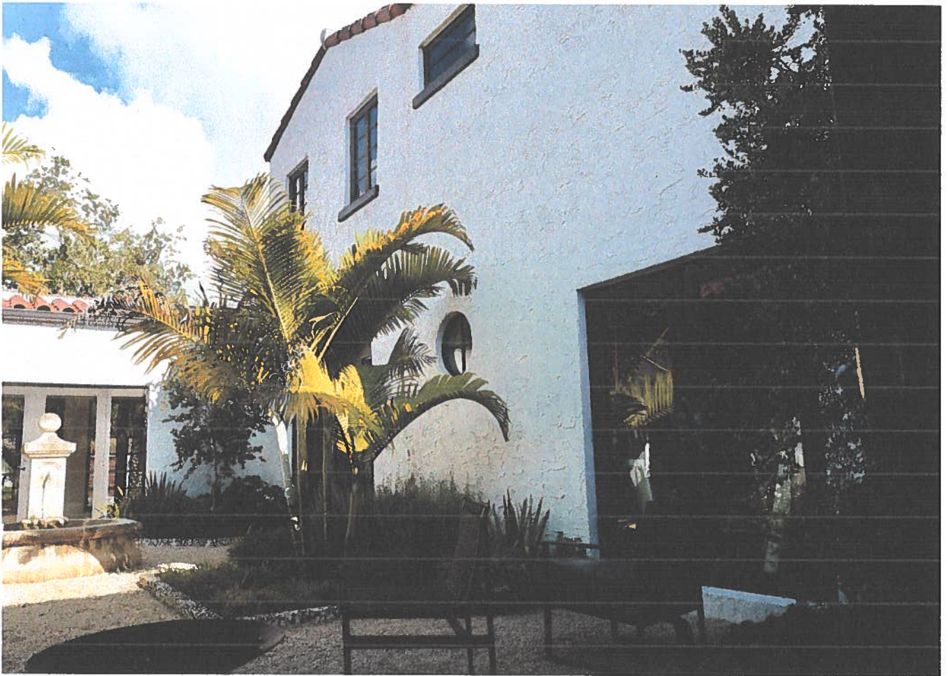
South facade from courtyard