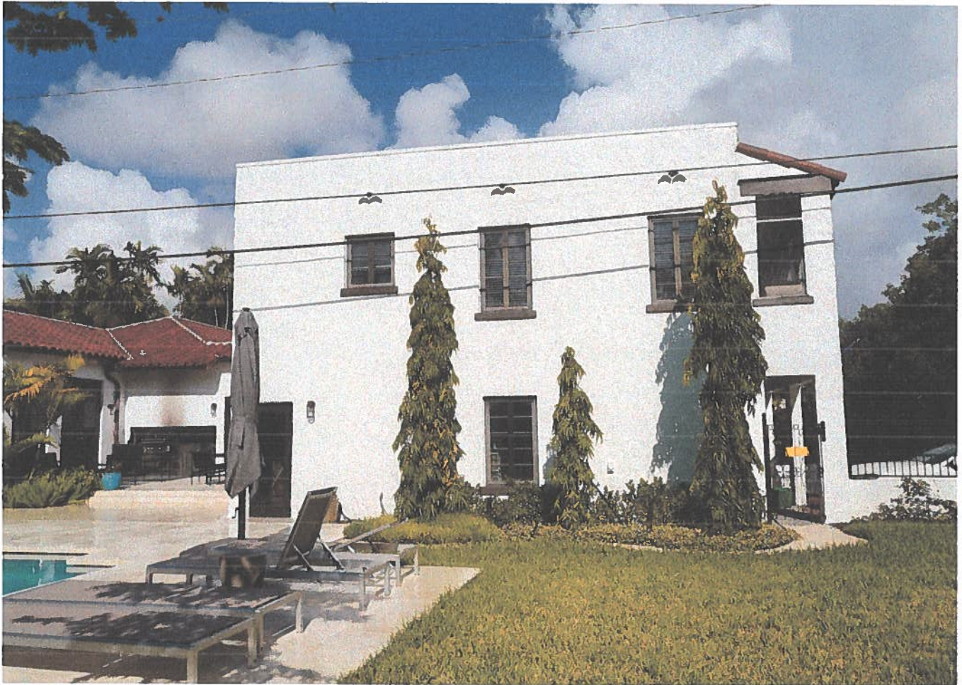
East facade (garage)