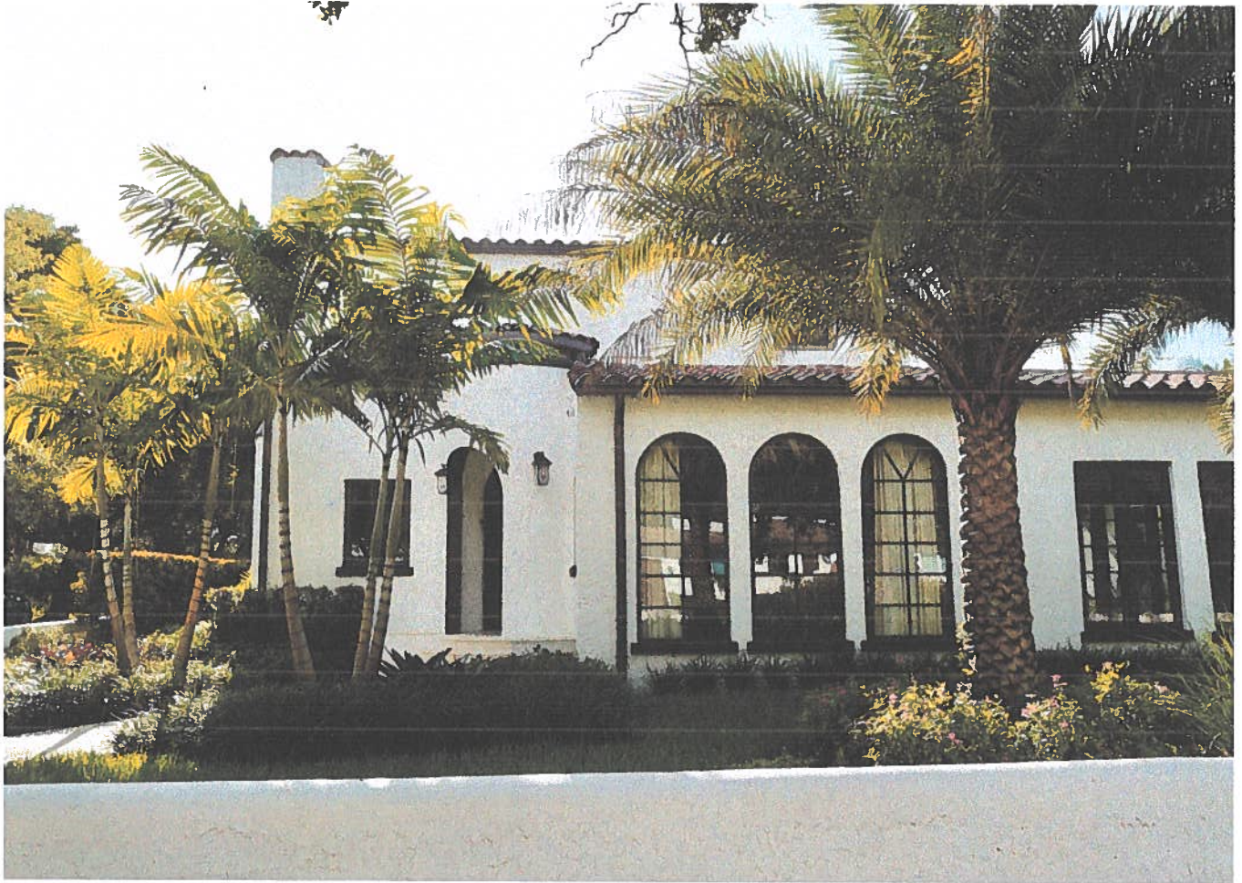
West facade along Durango St.