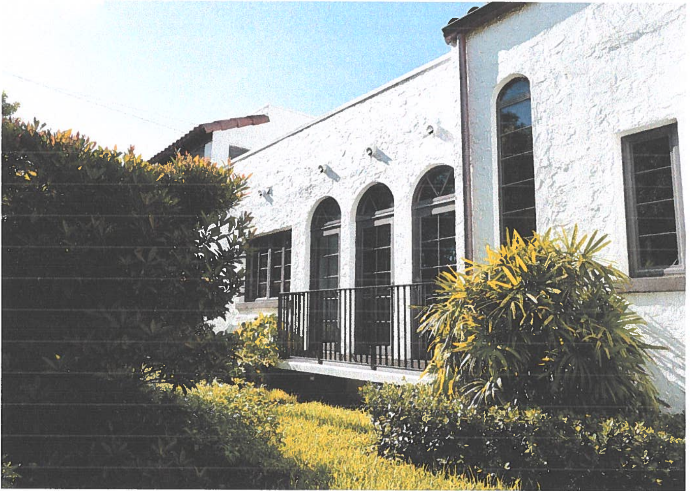
North facade along Rodrigo Ave.