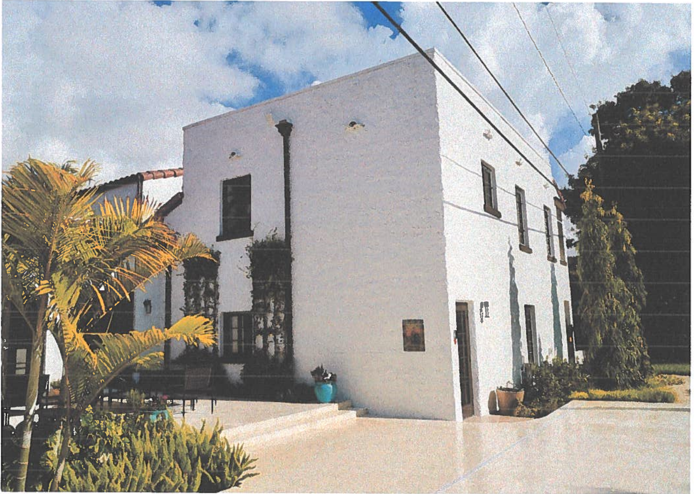
South facade garage