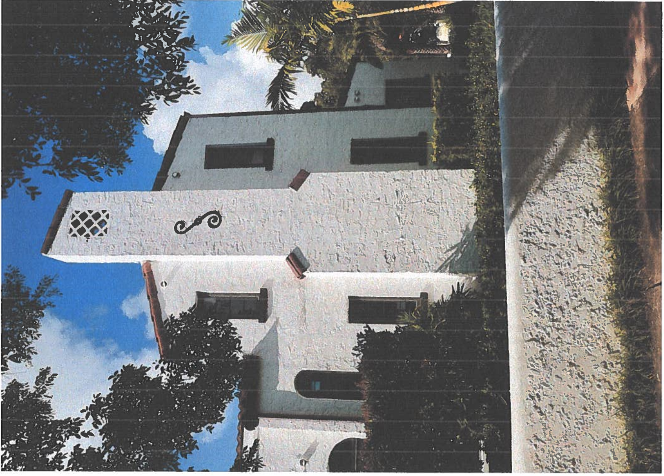
North facade along Rodrigs Ave