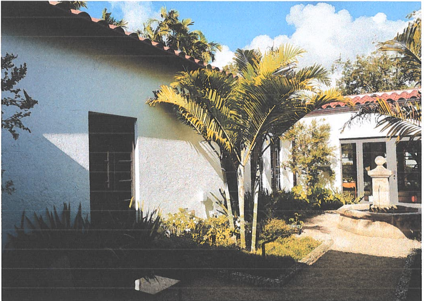
North facade from courtyard