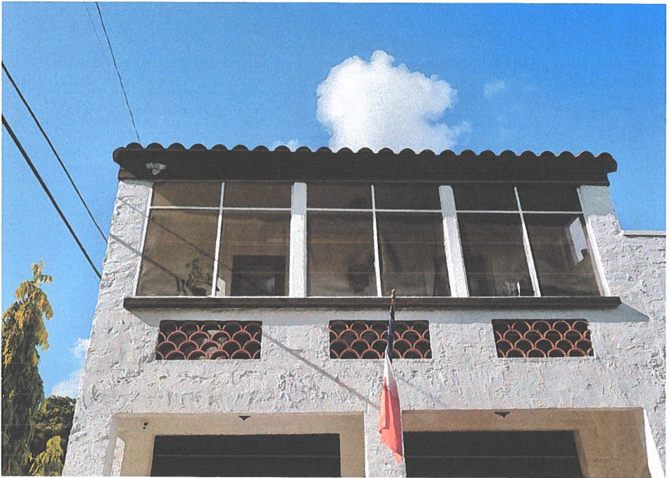
Porch above Garage