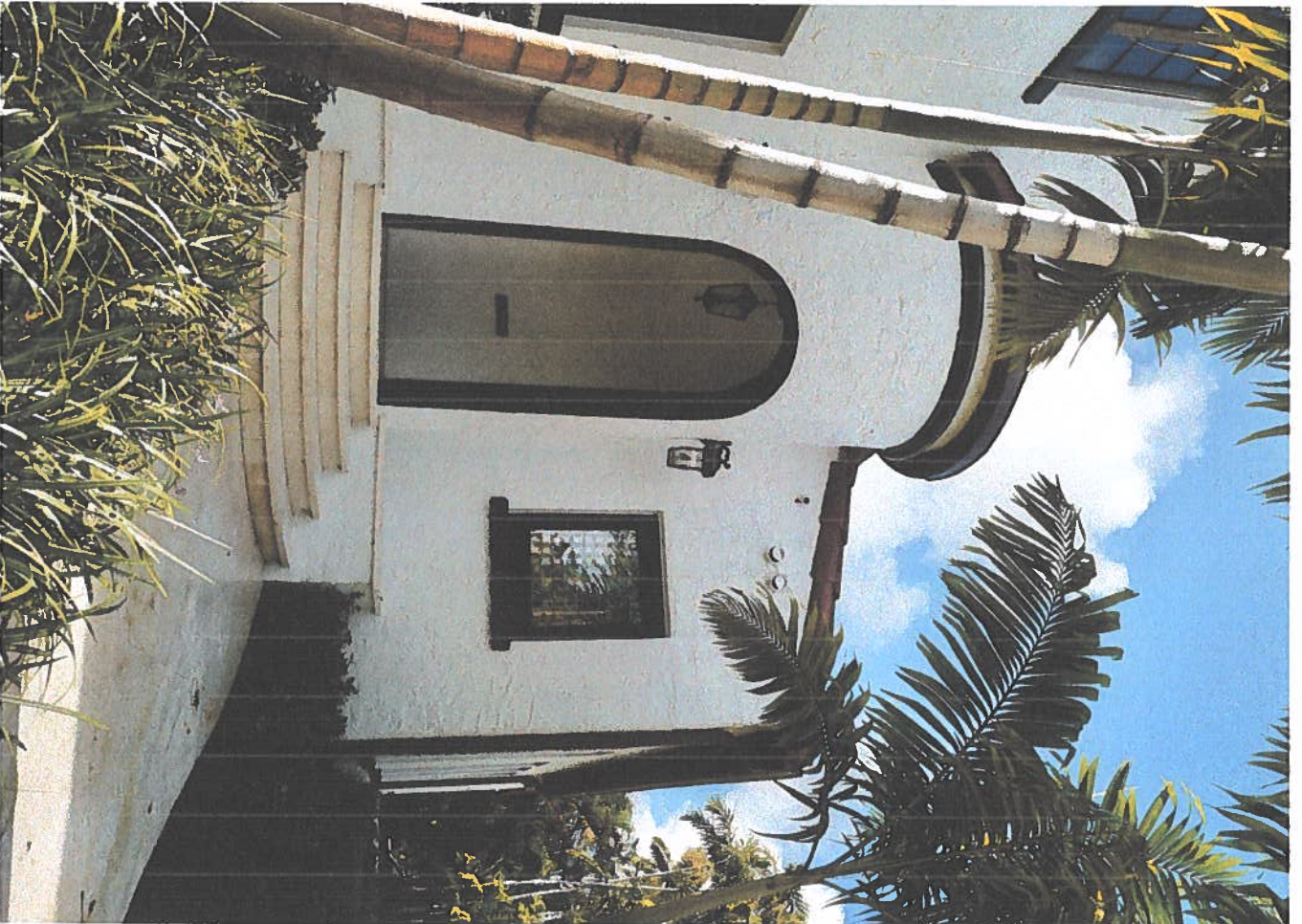
Entrance Looking South