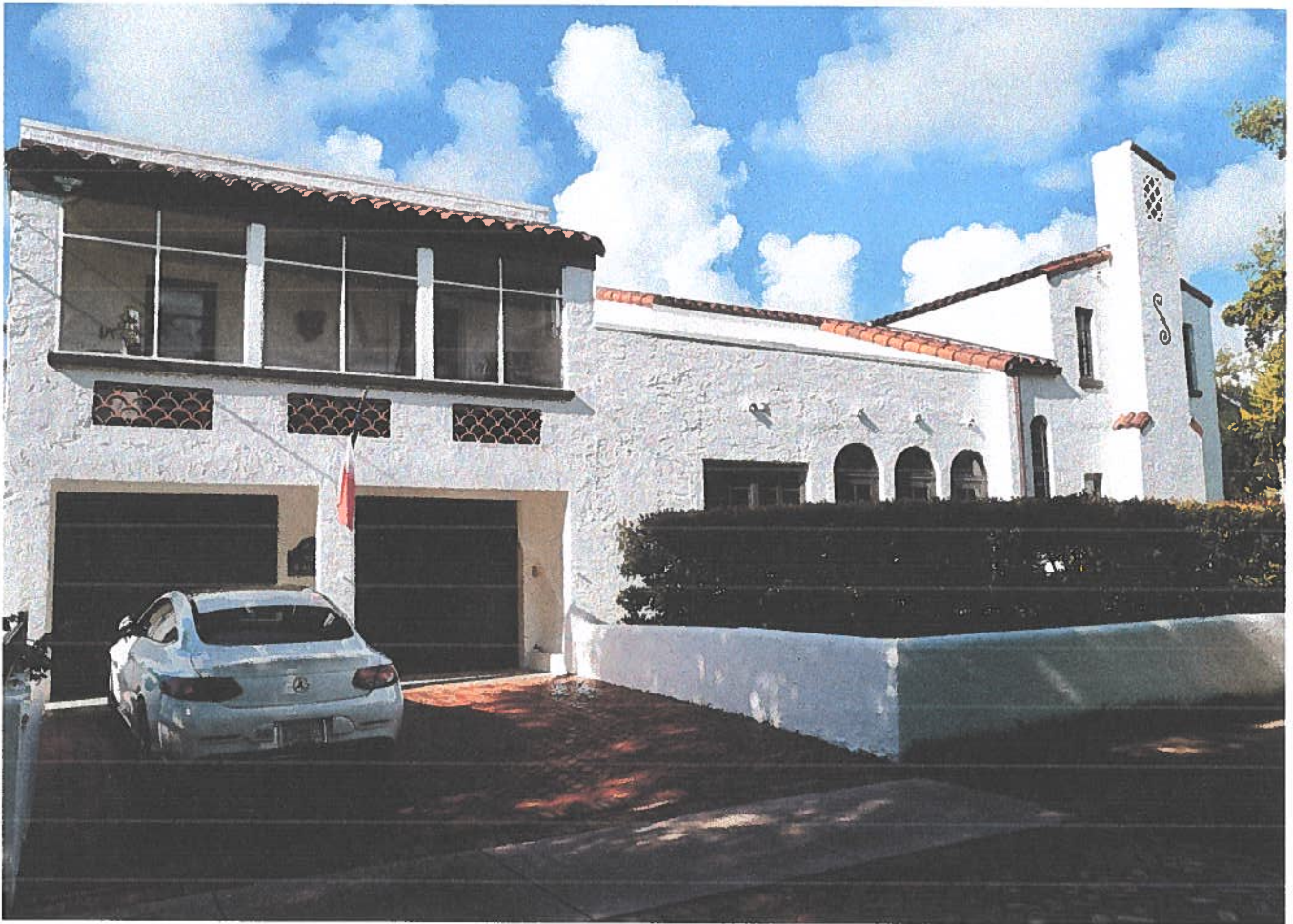
North facade along Rodrigo Ave