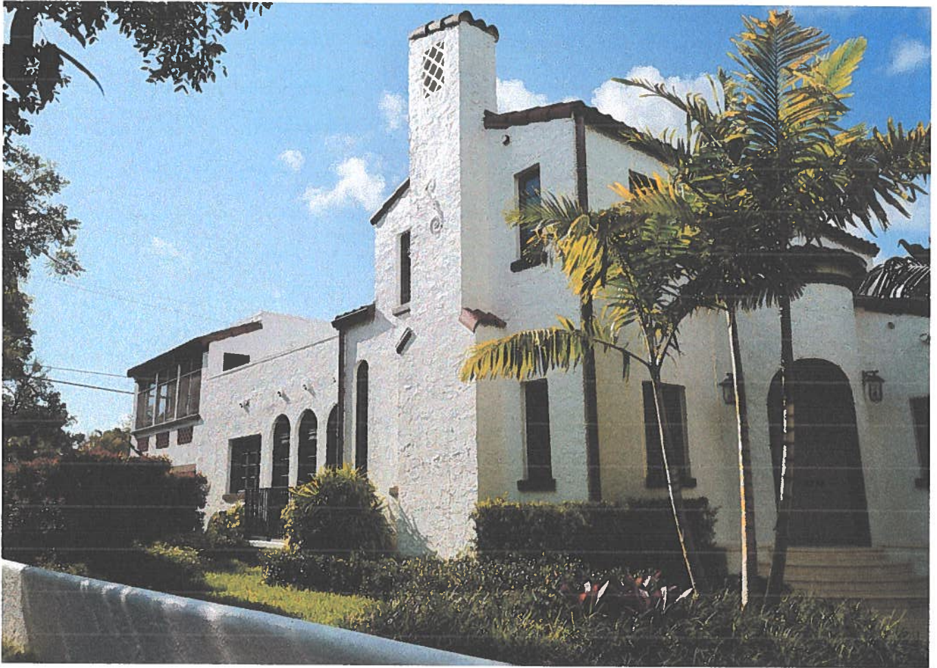
North facade along Rodrigo Ave