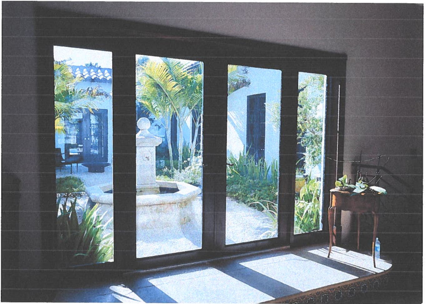
Courtyard looking East