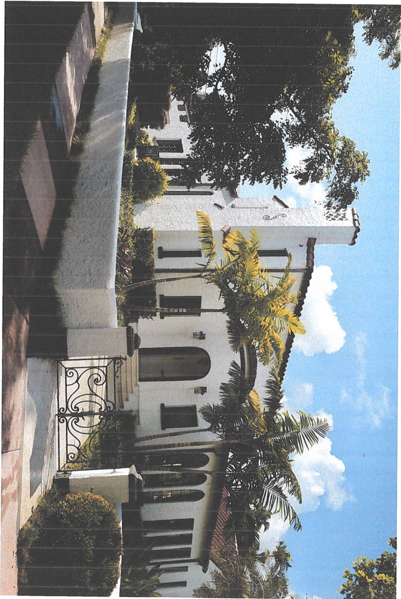
3701 DURANGO Street, Street Facing facade