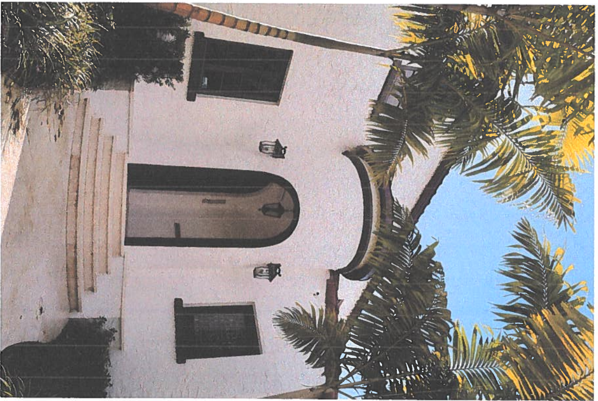
Entrance Looking South East.