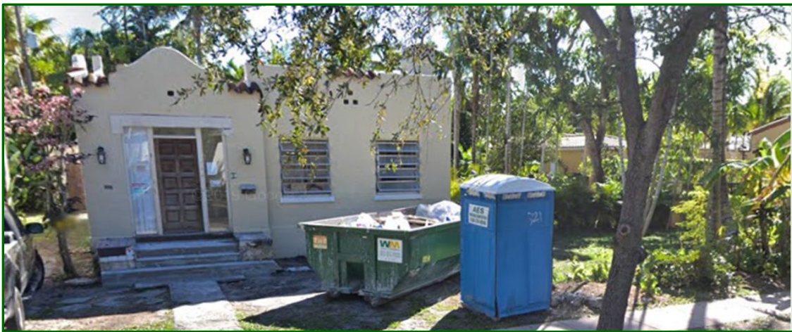
Figure 2: 2009