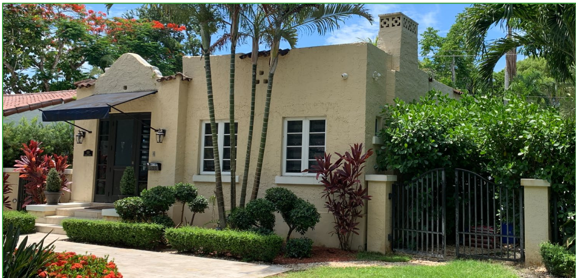
Figure 3: Current Photo, 2026