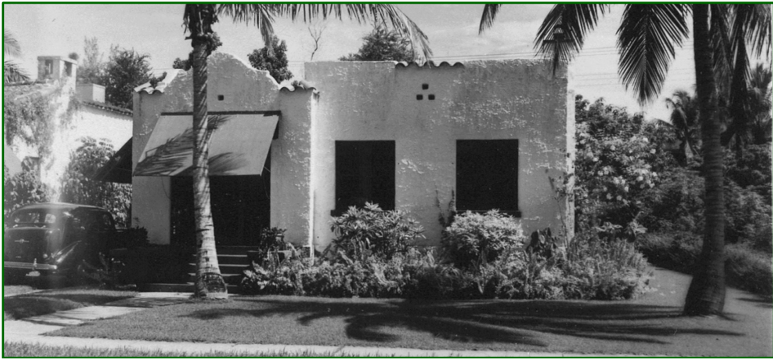
Figure 1: ca. 1940 Photo