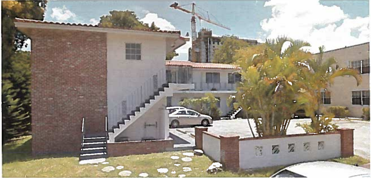
236 Madeira Ave