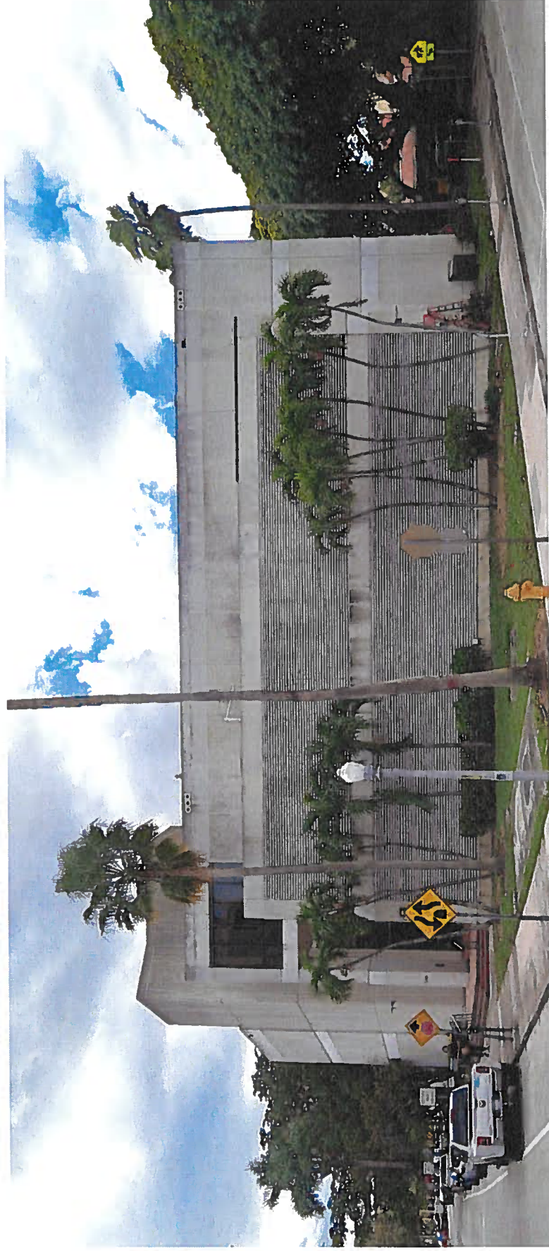
101 Alhambra Cir.