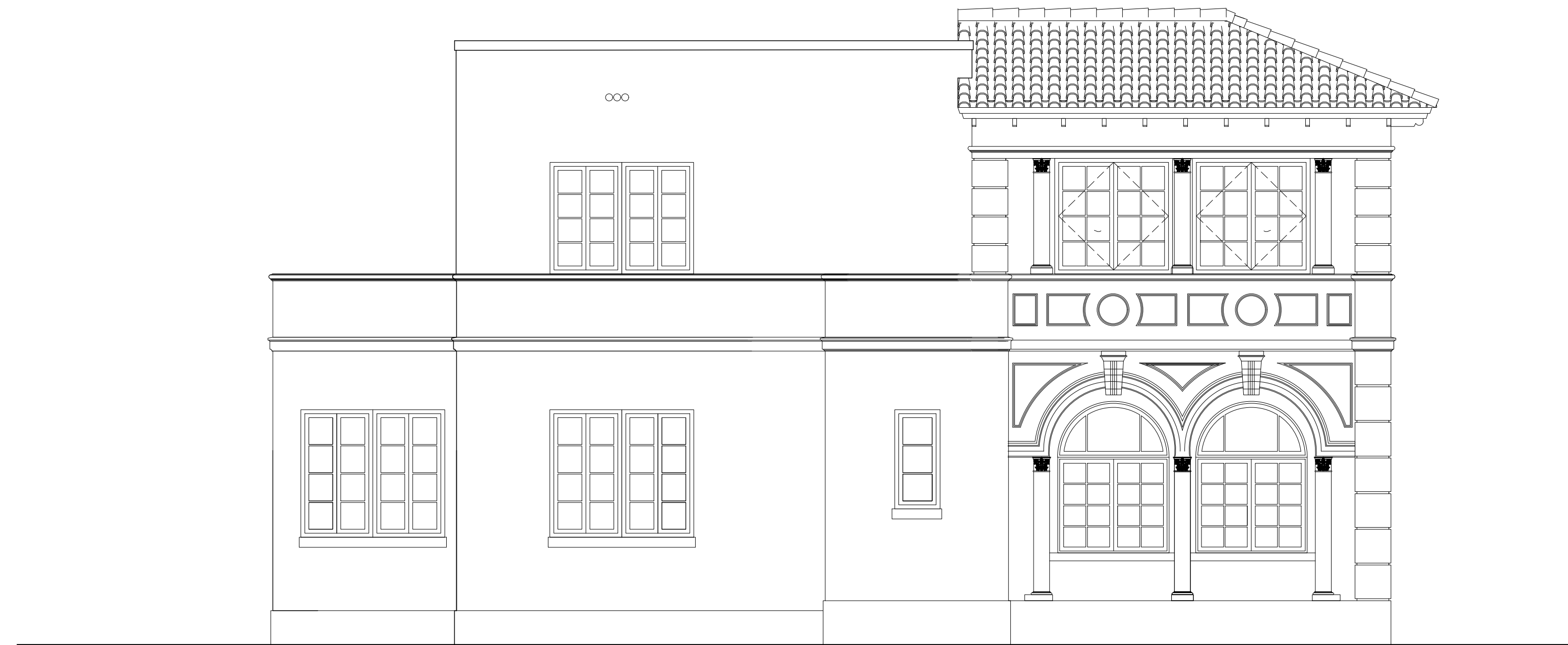
EXISTING SIDE ELEVATION 1/4"