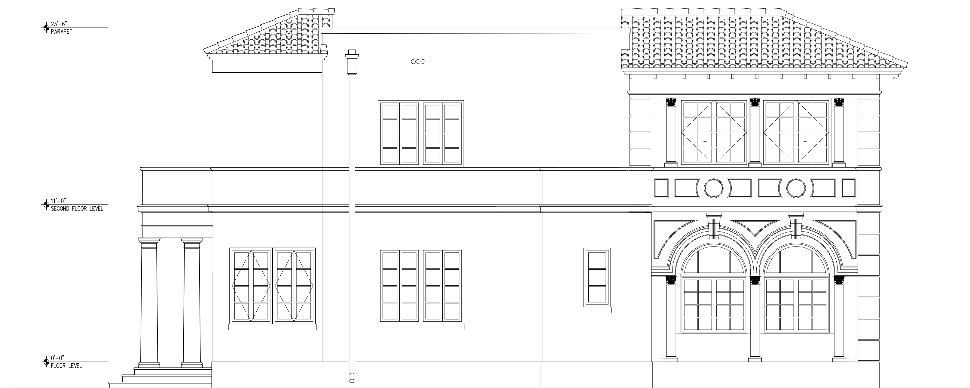
PROPOSED SIDE ELEVATION 1/4"