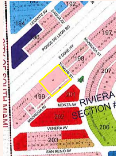
2017 – EXISTING PLAT