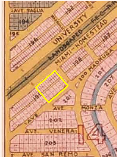
1925 – ORIGINAL PLAT