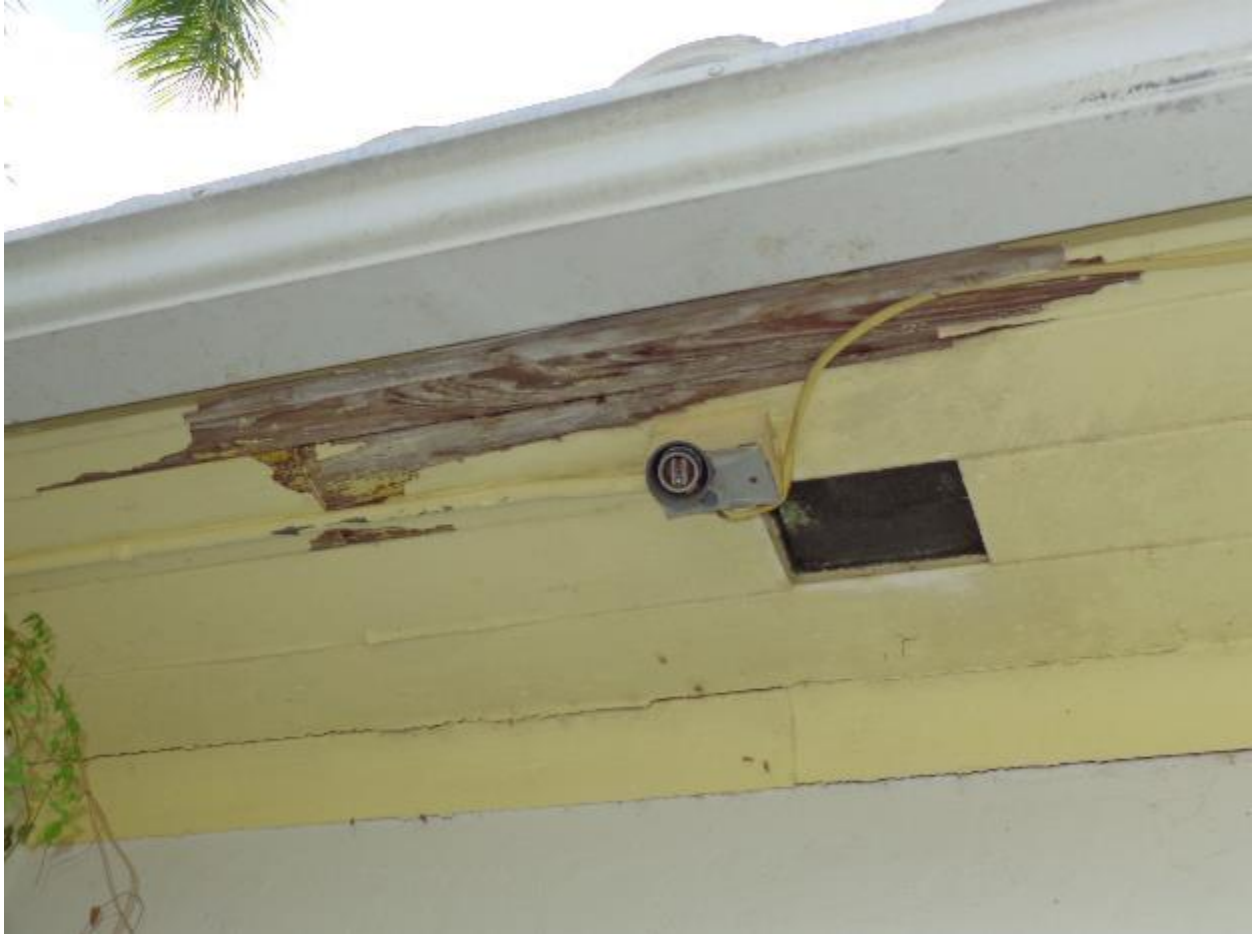
Fascia and soffit deteriorated wood requires replacement.

PROPERTY INSPECTION –229 Ridgewood Rd Coral Gables, FL ATTACHMENT - PHOTOGRAPHS DATE: 06-09-2016