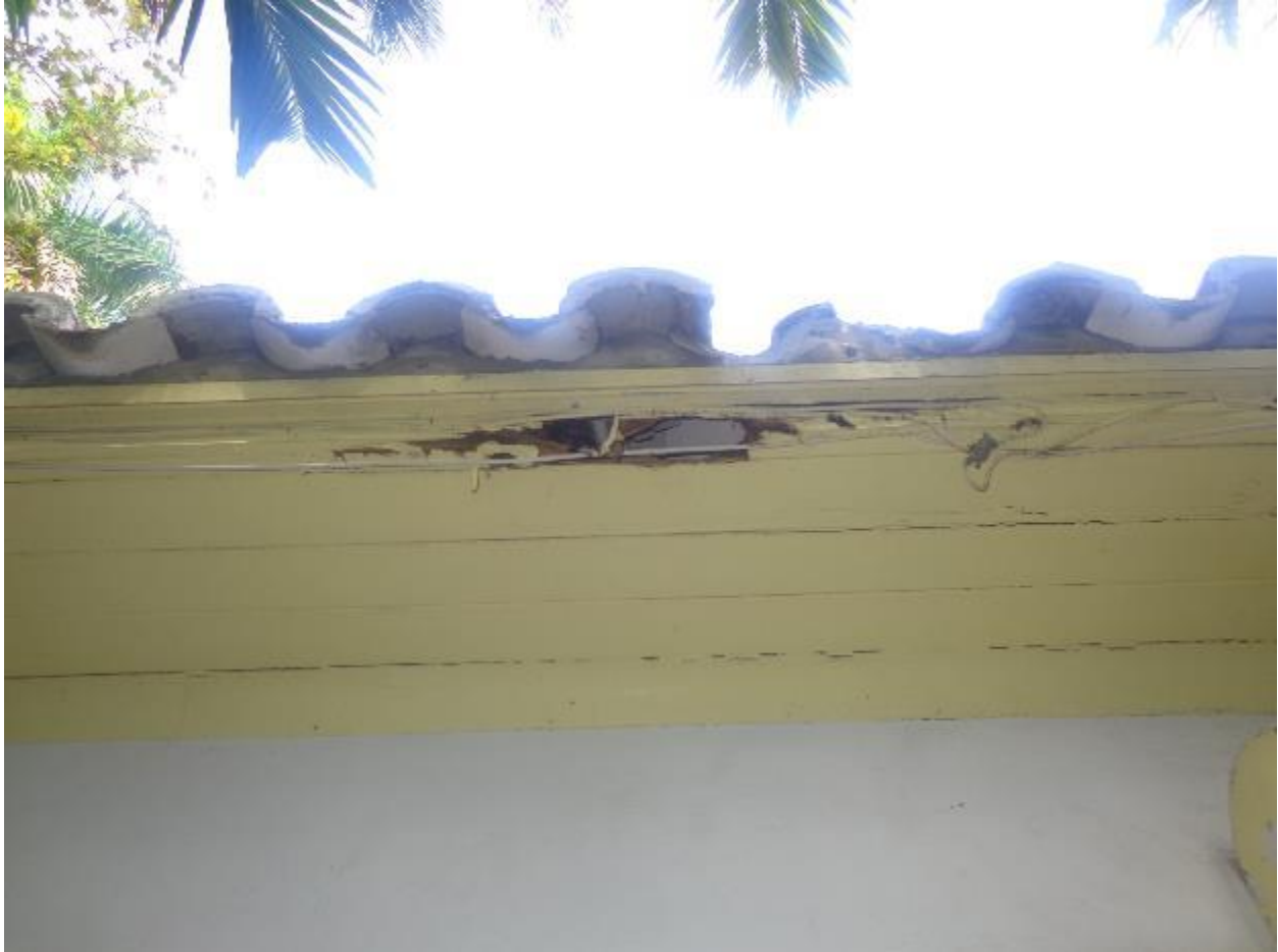
Fascia and soffit deteriorated wood requires replacement.

PROPERTY INSPECTION –229 Ridgewood Rd Coral Gables, FL ATTACHMENT - PHOTOGRAPHS DATE: 06-09-2016