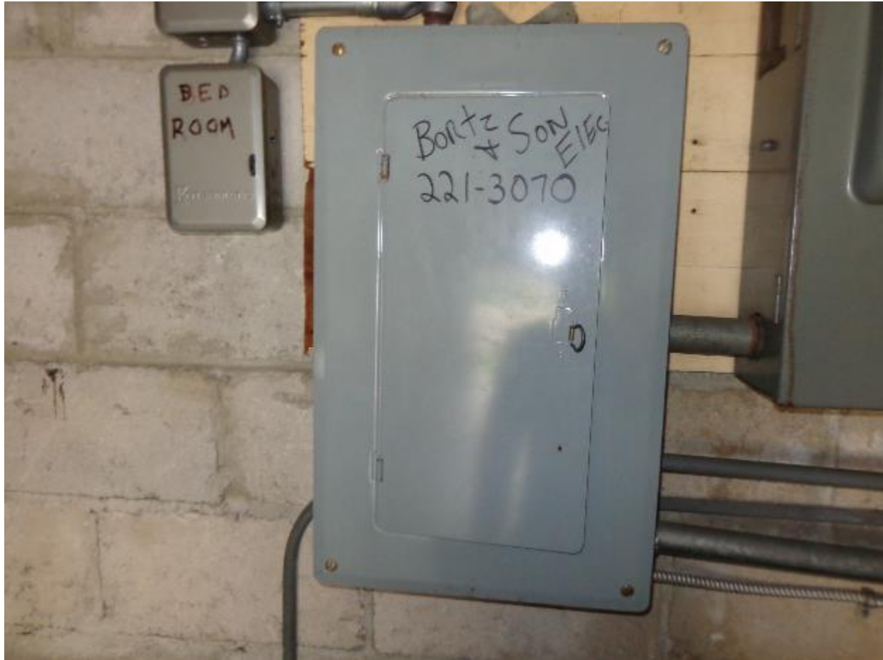
Electrical breaker panel in good condition at the time of inspection.

PROPERTY INSPECTION –229 Ridgewood Rd Coral Gables, FL ATTACHMENT - PHOTOGRAPHS DATE: 06-09-2016