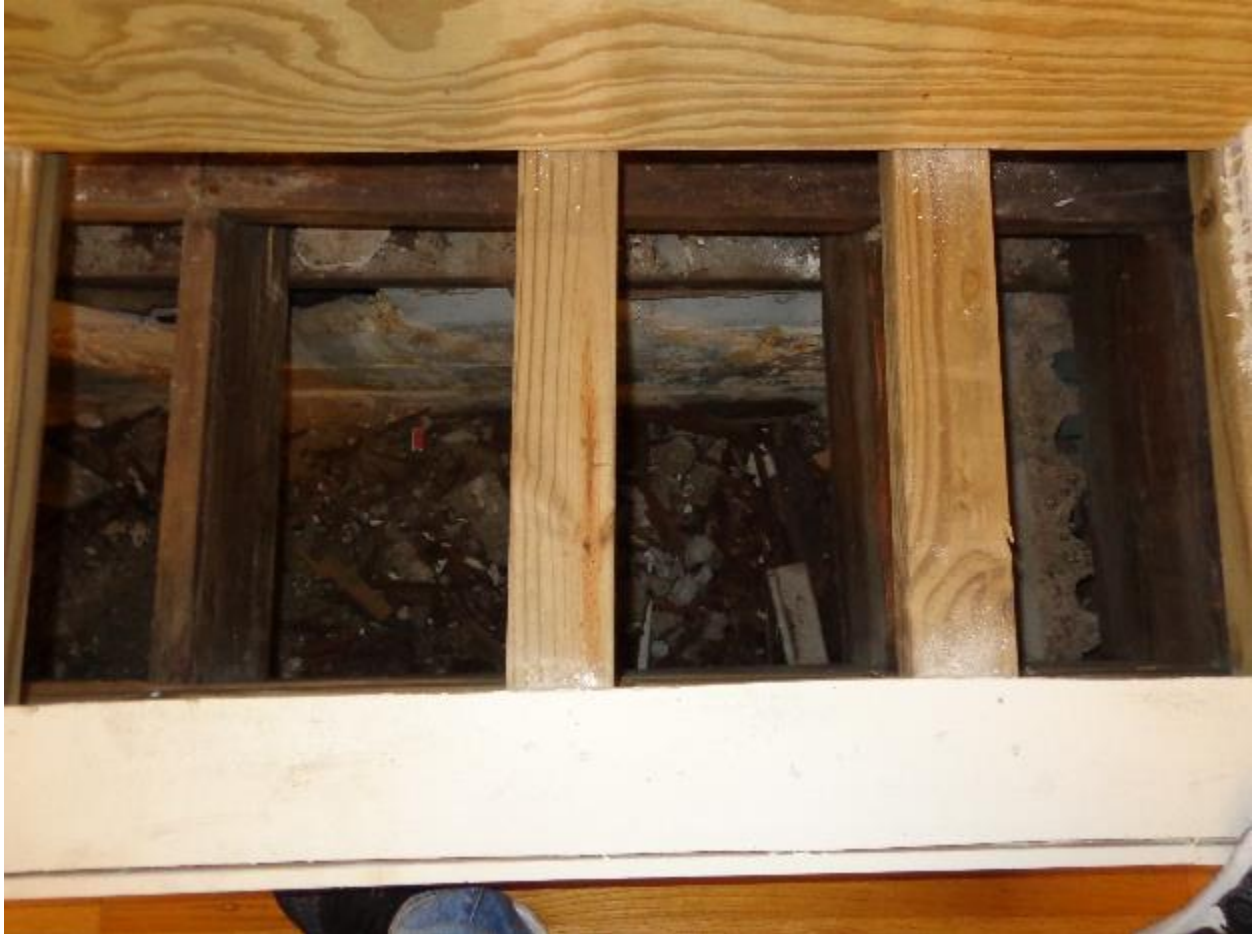
Interior hatch to crawl space.

PROPERTY INSPECTION –229 Ridgewood Rd Coral Gables, FL ATTACHMENT - PHOTOGRAPHS DATE: 06-09-2016