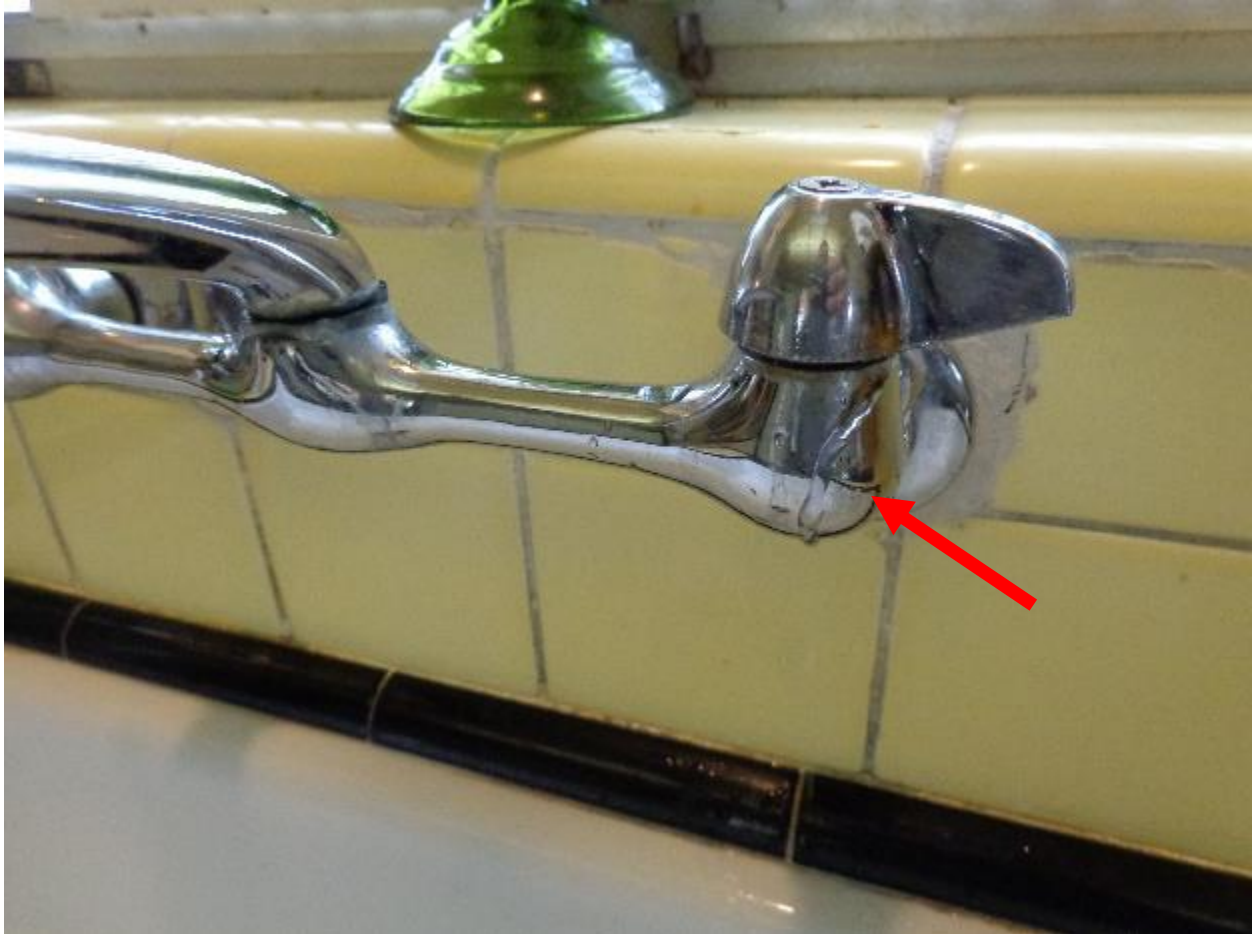
Active leak when open.

PROPERTY INSPECTION –229 Ridgewood Rd Coral Gables, FL ATTACHMENT - PHOTOGRAPHS DATE: 06-09-2016