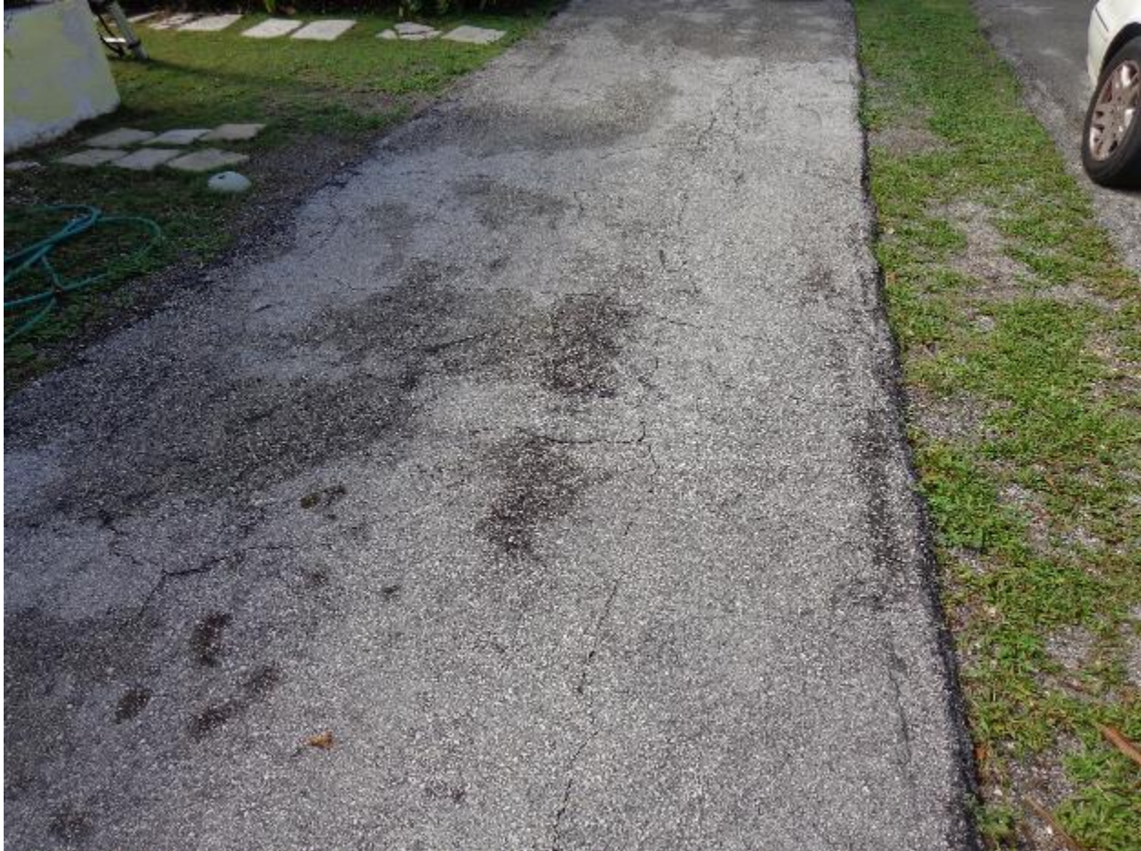
Asphalt recoating required on parking spaces/ driveway.

PROPERTY INSPECTION –229 Ridgewood Rd Coral Gables, FL ATTACHMENT - PHOTOGRAPHS DATE: 06-09-2016