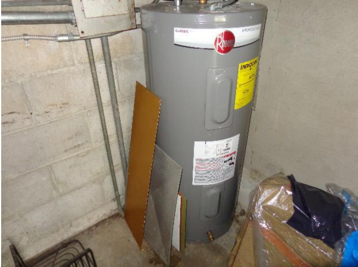
Water heater in good working condition at time of inspection.

PROPERTY INSPECTION –229 Ridgewood Rd Coral Gables, FL ATTACHMENT - PHOTOGRAPHS DATE: 06-09-2016