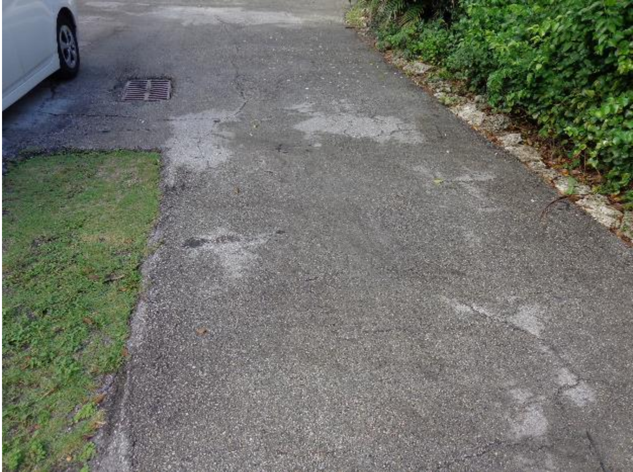
Asphalt recoating required on parking spaces/ driveway.

PROPERTY INSPECTION –229 Ridgewood Rd Coral Gables, FL ATTACHMENT - PHOTOGRAPHS DATE: 06-09-2016