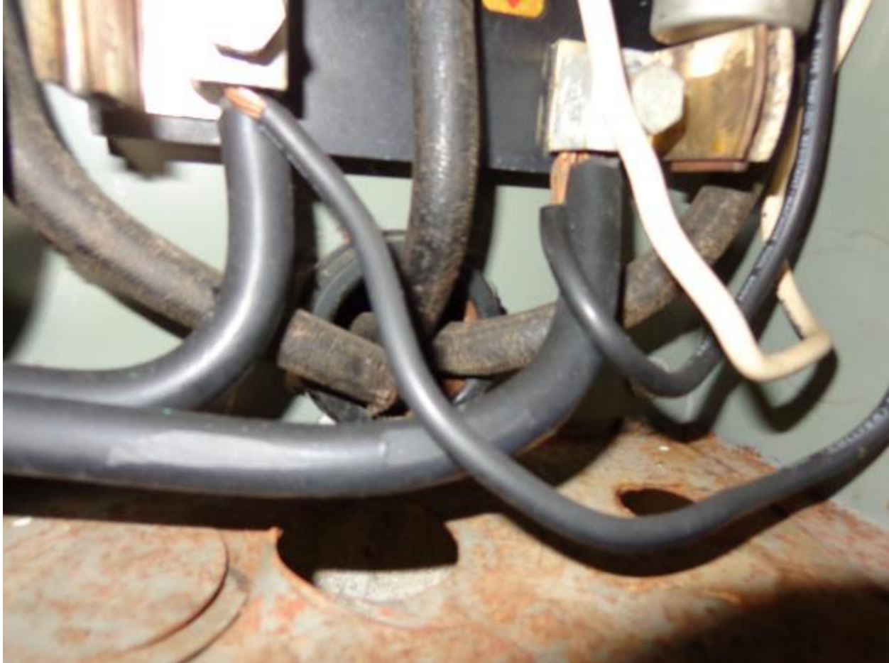
Double taps noted during inspection in main disconnect panel.

PROPERTY INSPECTION –229 Ridgewood Rd Coral Gables, FL ATTACHMENT - PHOTOGRAPHS DATE: 06-09-2016