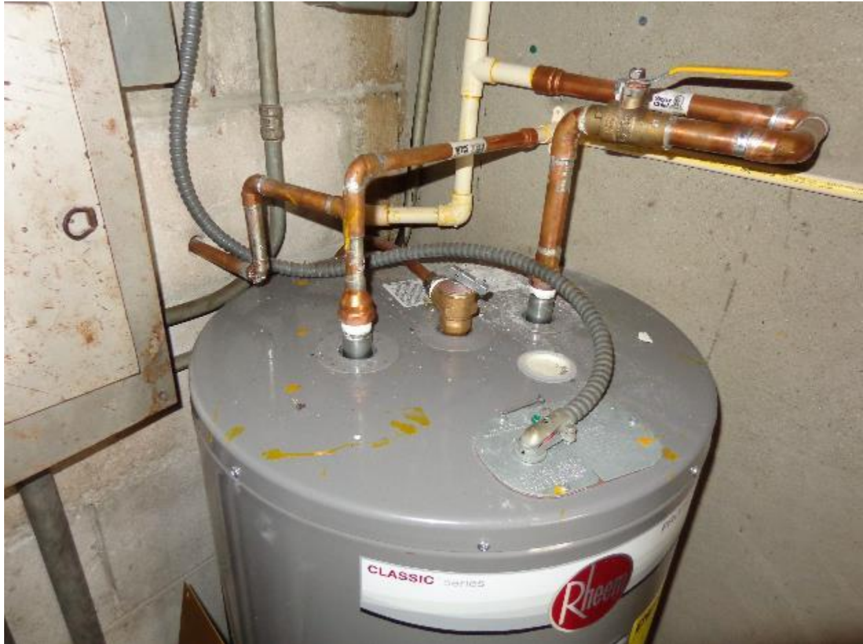
Water heater in good working condition at time of inspection.

PROPERTY INSPECTION –229 Ridgewood Rd Coral Gables, FL ATTACHMENT - PHOTOGRAPHS DATE: 06-09-2016