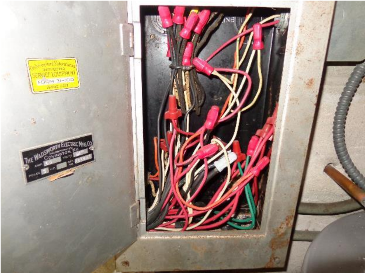
Junction box was found to be in general good condition.

PROPERTY INSPECTION –229 Ridgewood Rd Coral Gables, FL ATTACHMENT - PHOTOGRAPHS DATE: 06-09-2016