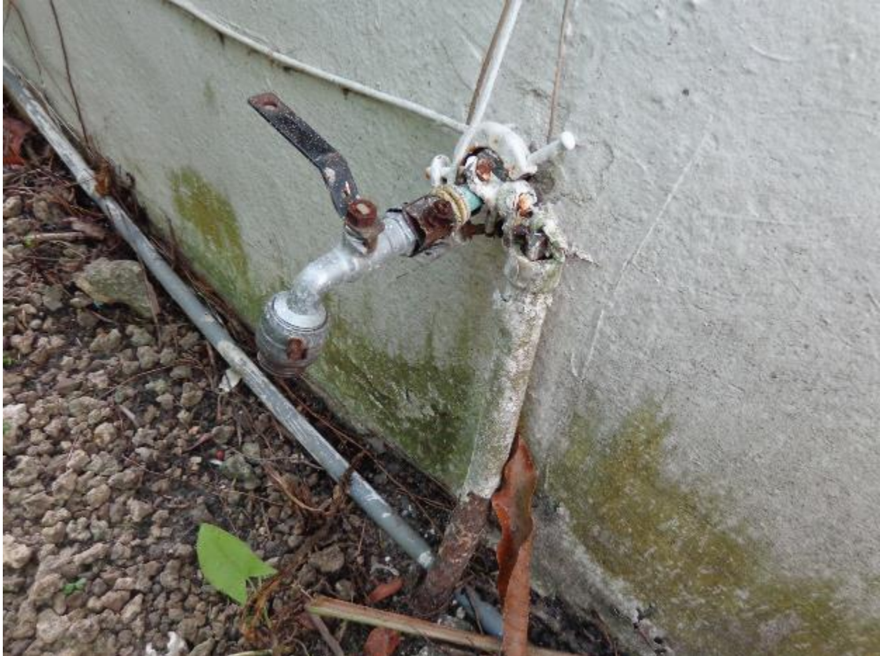
Defective plumbing system requires repairs.

PROPERTY INSPECTION –229 Ridgewood Rd Coral Gables, FL ATTACHMENT - PHOTOGRAPHS DATE: 06-09-2016