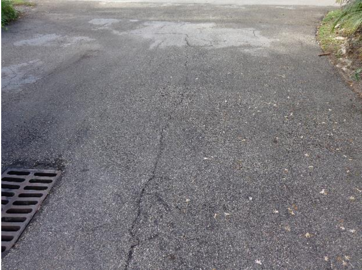
Asphalt recoating required on parking spaces/ driveway.

PROPERTY INSPECTION –229 Ridgewood Rd Coral Gables, FL ATTACHMENT - PHOTOGRAPHS DATE: 06-09-2016