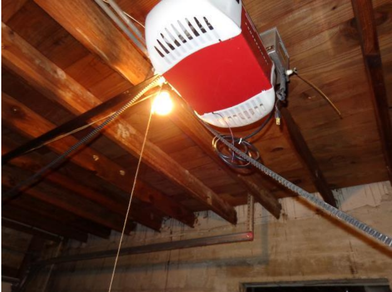
Garage door motors on door garage doors require repairs.

PROPERTY INSPECTION –229 Ridgewood Rd Coral Gables, FL ATTACHMENT - PHOTOGRAPHS DATE: 06-09-2016