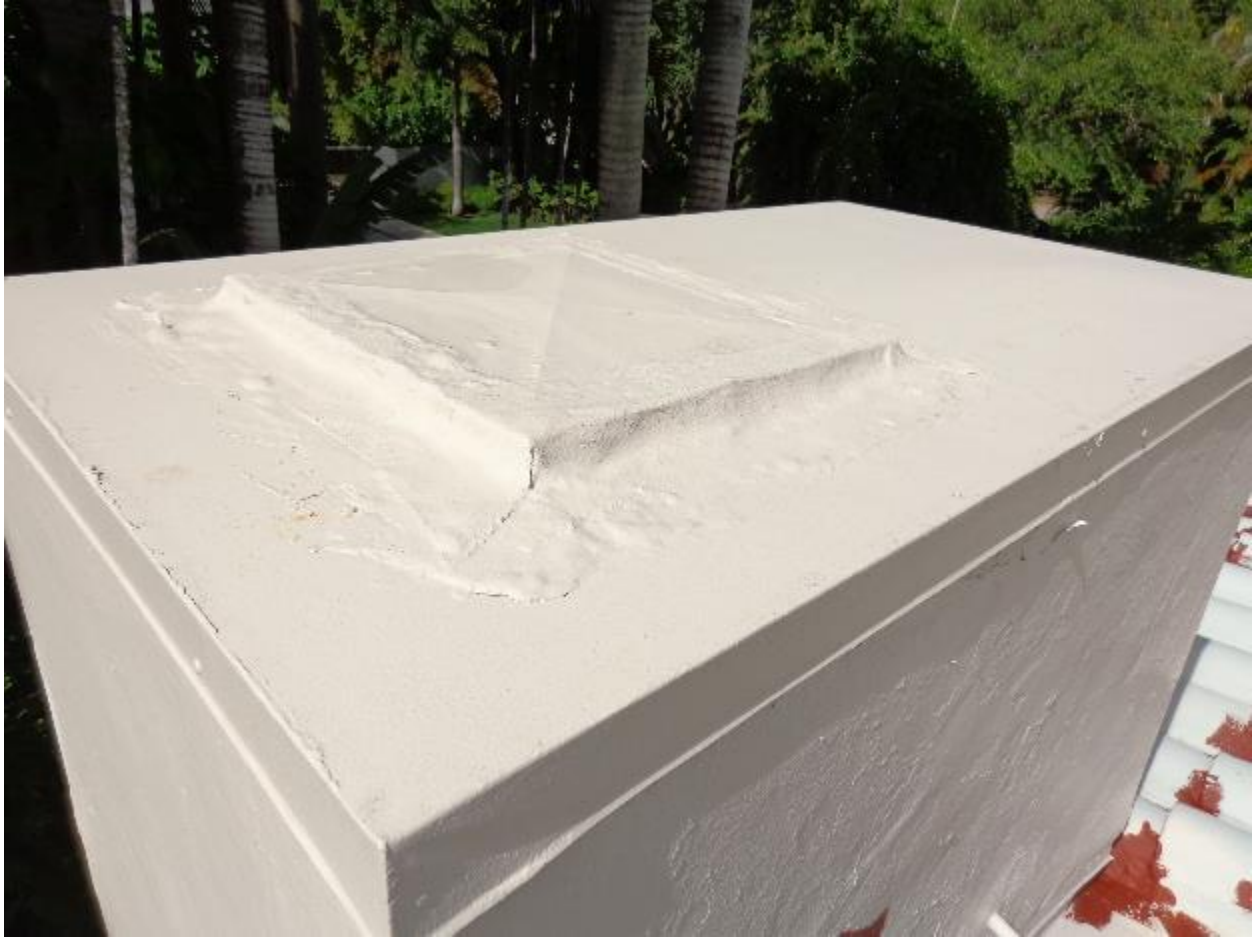
Chimney was noted to be properly capped.

PROPERTY INSPECTION –229 Ridgewood Rd Coral Gables, FL ATTACHMENT - PHOTOGRAPHS DATE: 06-09-2016