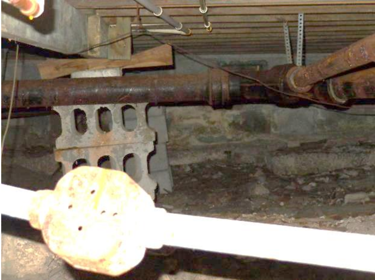
Deteriorated cast iron pipes will require a full upgrade replace with PVC.

PROPERTY INSPECTION –229 Ridgewood Rd Coral Gables, FL ATTACHMENT - PHOTOGRAPHS DATE: 06-09-2016