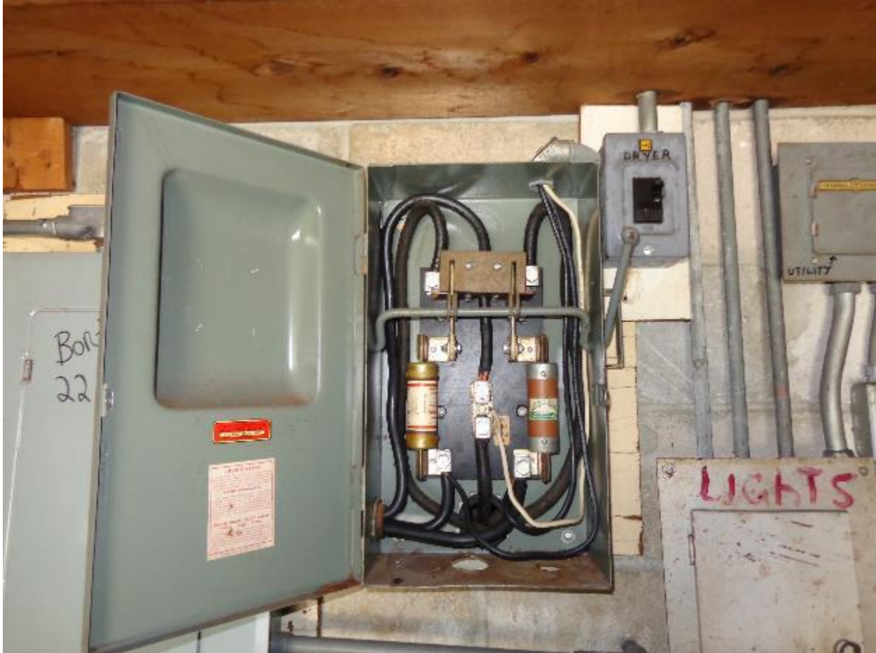
Double taps noted during inspection in main disconnect panel.

PROPERTY INSPECTION –229 Ridgewood Rd Coral Gables, FL ATTACHMENT - PHOTOGRAPHS DATE: 06-09-2016