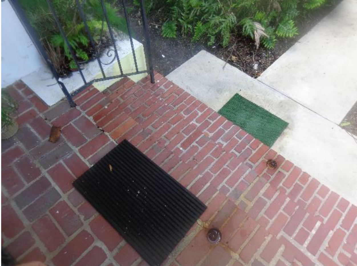
Missing left hand rail. Requires replacement to be brought up to code.

PROPERTY INSPECTION –229 Ridgewood Rd Coral Gables, FL ATTACHMENT - PHOTOGRAPHS DATE: 06-09-2016