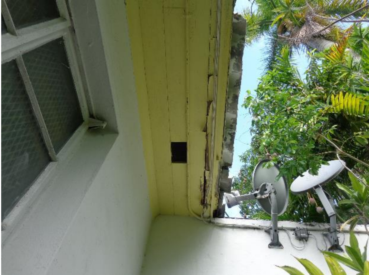
Fascia and soffit deteriorated wood requires replacement.

PROPERTY INSPECTION –229 Ridgewood Rd Coral Gables, FL ATTACHMENT - PHOTOGRAPHS DATE: 06-09-2016