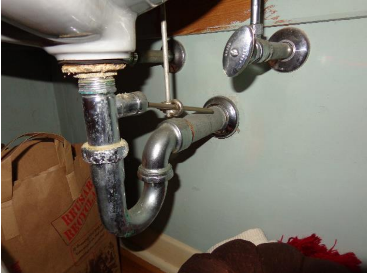
Deteriorated cast iron pipes will require a full upgrade replace with PVC.

PROPERTY INSPECTION –229 Ridgewood Rd Coral Gables, FL ATTACHMENT - PHOTOGRAPHS DATE: 06-09-2016