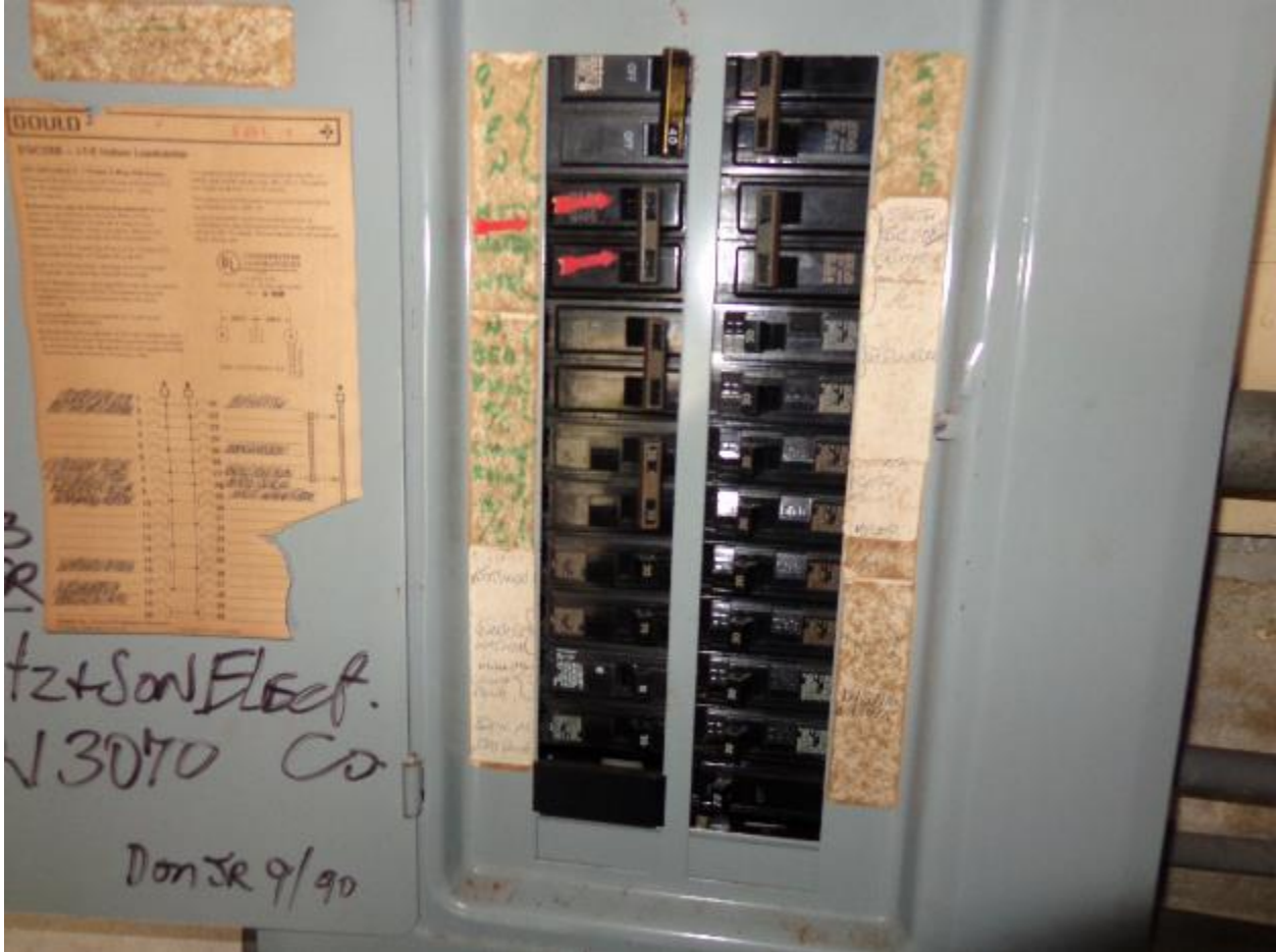
Electrical breaker panel in good condition at the time of inspection.

PROPERTY INSPECTION –229 Ridgewood Rd Coral Gables, FL ATTACHMENT - PHOTOGRAPHS DATE: 06-09-2016