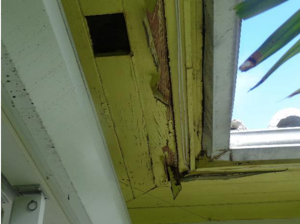
Fascia and soffit deteriorated wood requires replacement.

PROPERTY INSPECTION –229 Ridgewood Rd Coral Gables, FL ATTACHMENT - PHOTOGRAPHS DATE: 06-09-2016