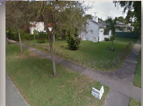
Sarto & Salzedo