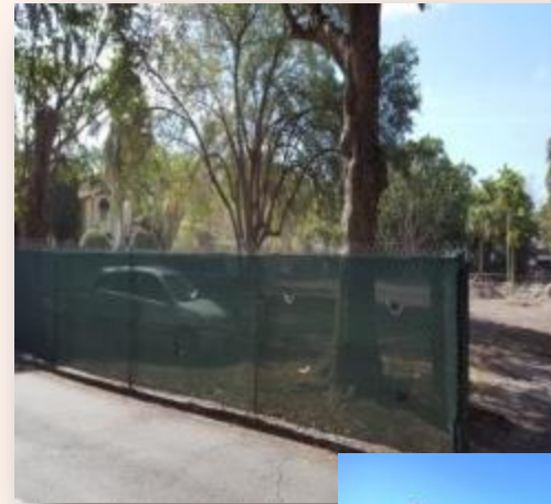
Betsy Adams and the Coral Gables Garden Club Park

Maggiore Park is in the procurement phase. The Betsy Adams and Coral Gables Garden Club Park is under construction with completion estimated for January 2018. Cepero Park phase I is complete. Phase II funding will be addressed during the Fiscal Year 2019 budget process.