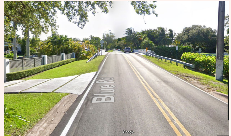
Blue Road East