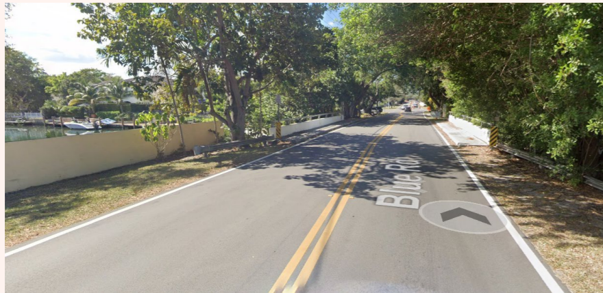
Blue Road West