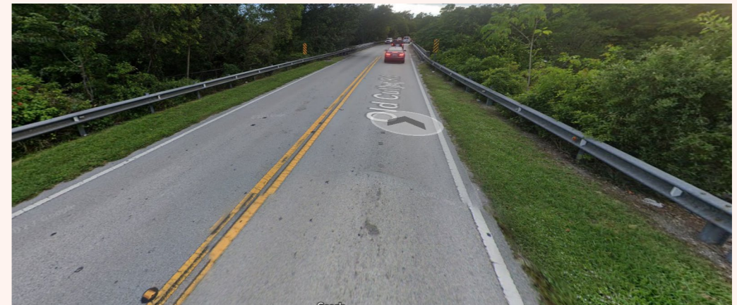
Old Cutler Rd.