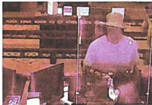
Appliance: AU 66216 Coral Gables Main Camera: 5. C05 Teller 5 Time: 10/05/2020 3:43:50 PM