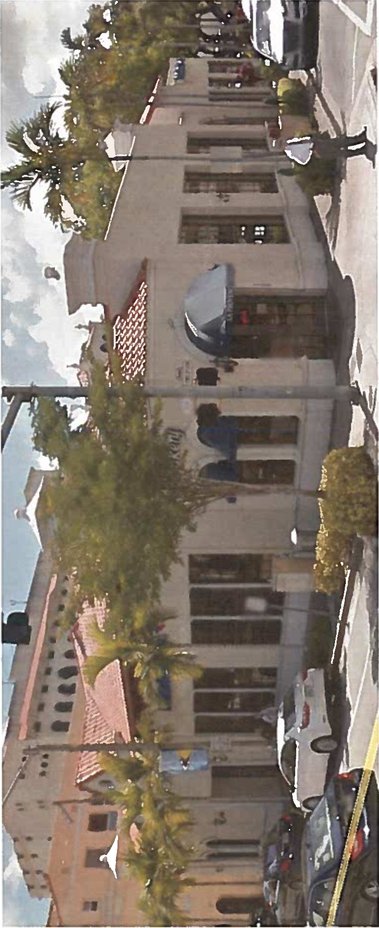
214 Giralda Ave