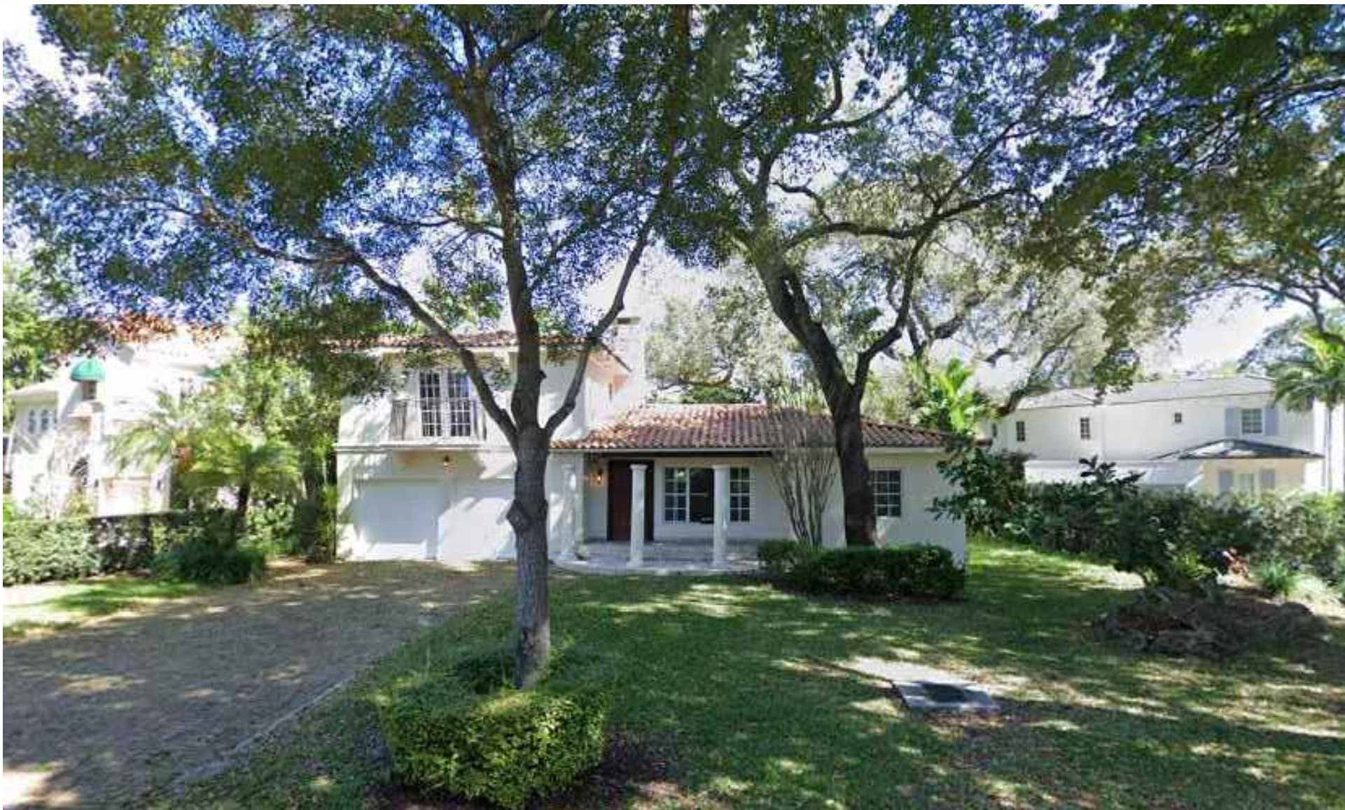
4. EAST OF PROPERTY