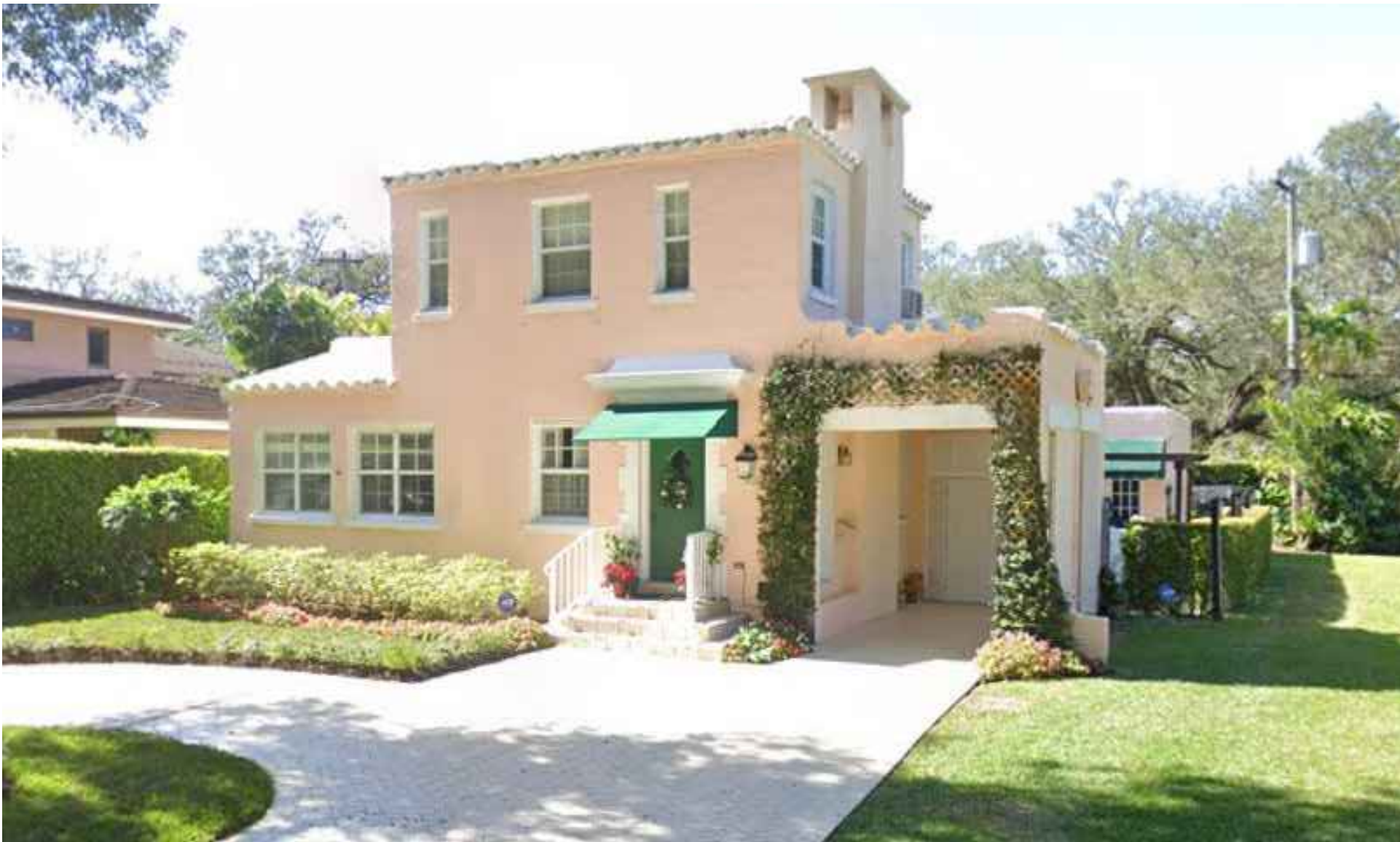
2. FRONT VIEW OF SUBJECT PROPERTY (3920 Durango Street, Coral Gables, FL 33134)