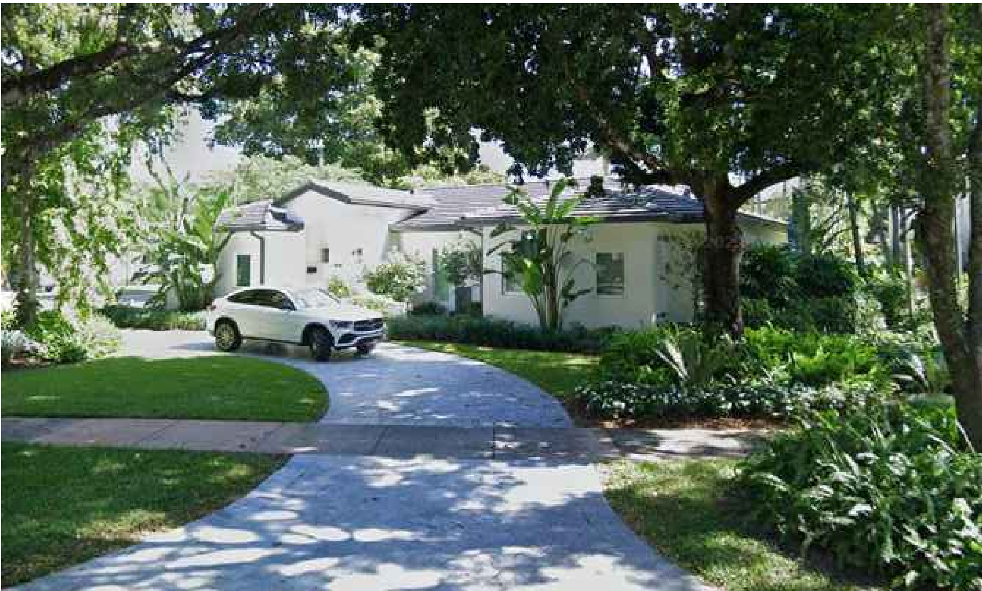
6. NORTH EAST OF PROPERTY