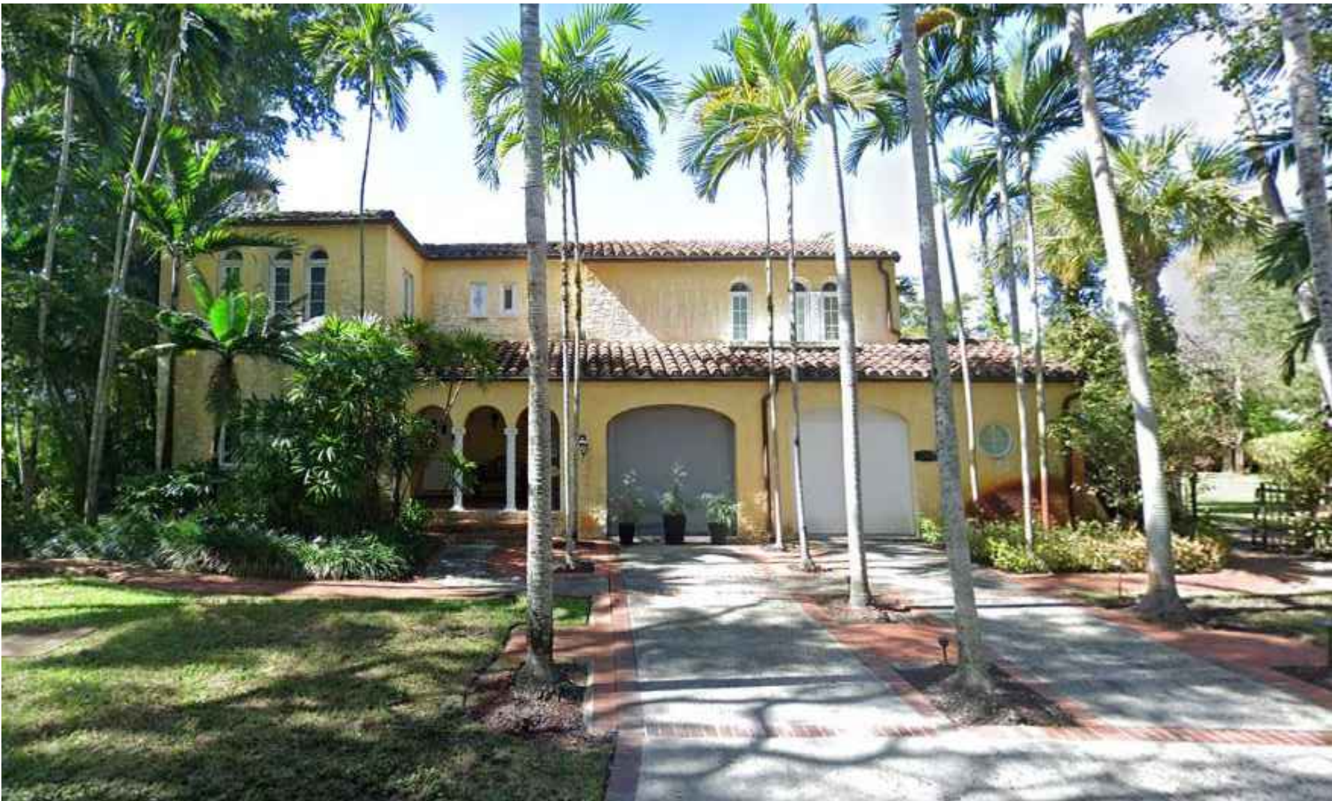
3. NORTH OF SUBJECT PROPERTY