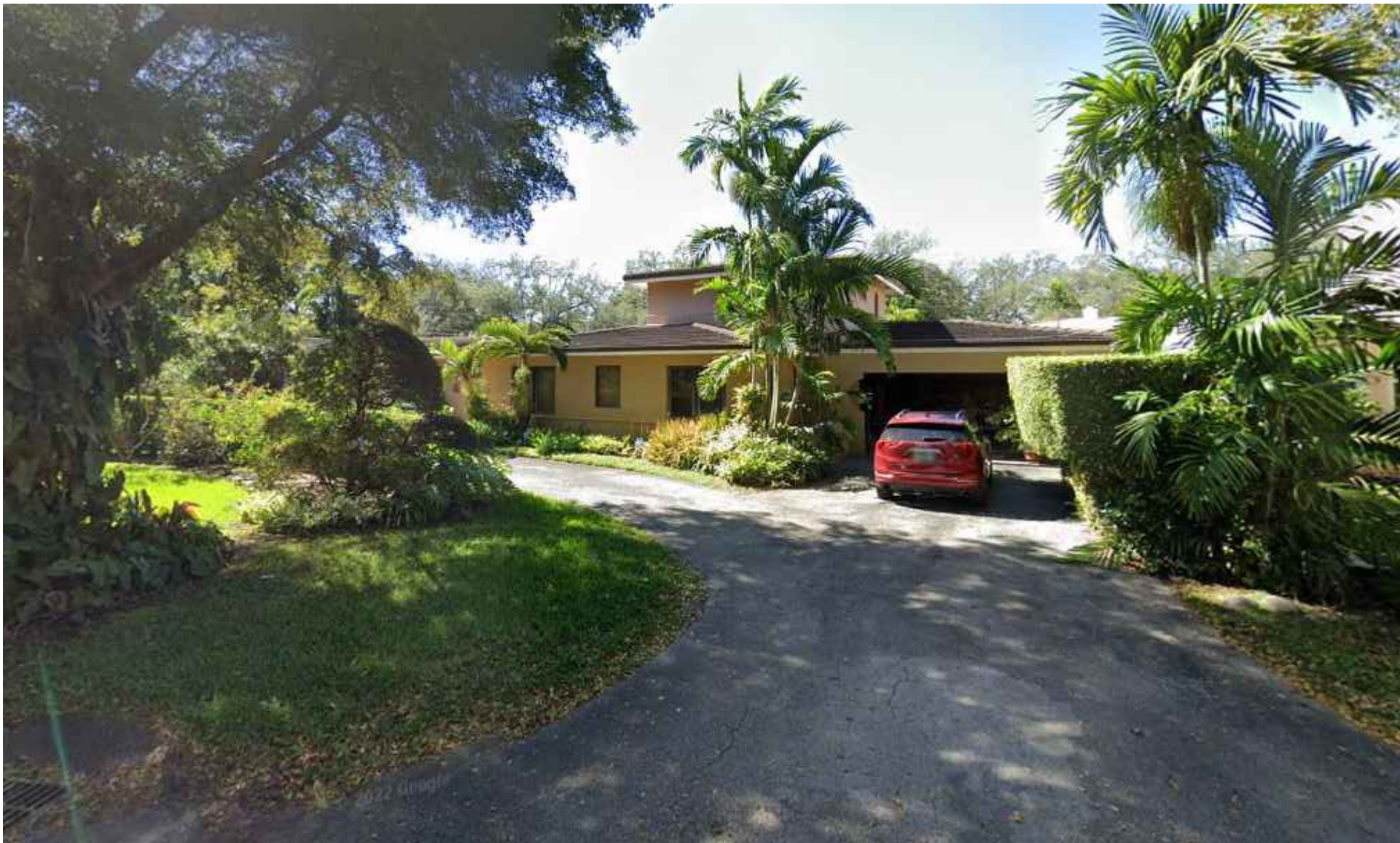
1. SOUTH OF SUBJECT PROPERTY