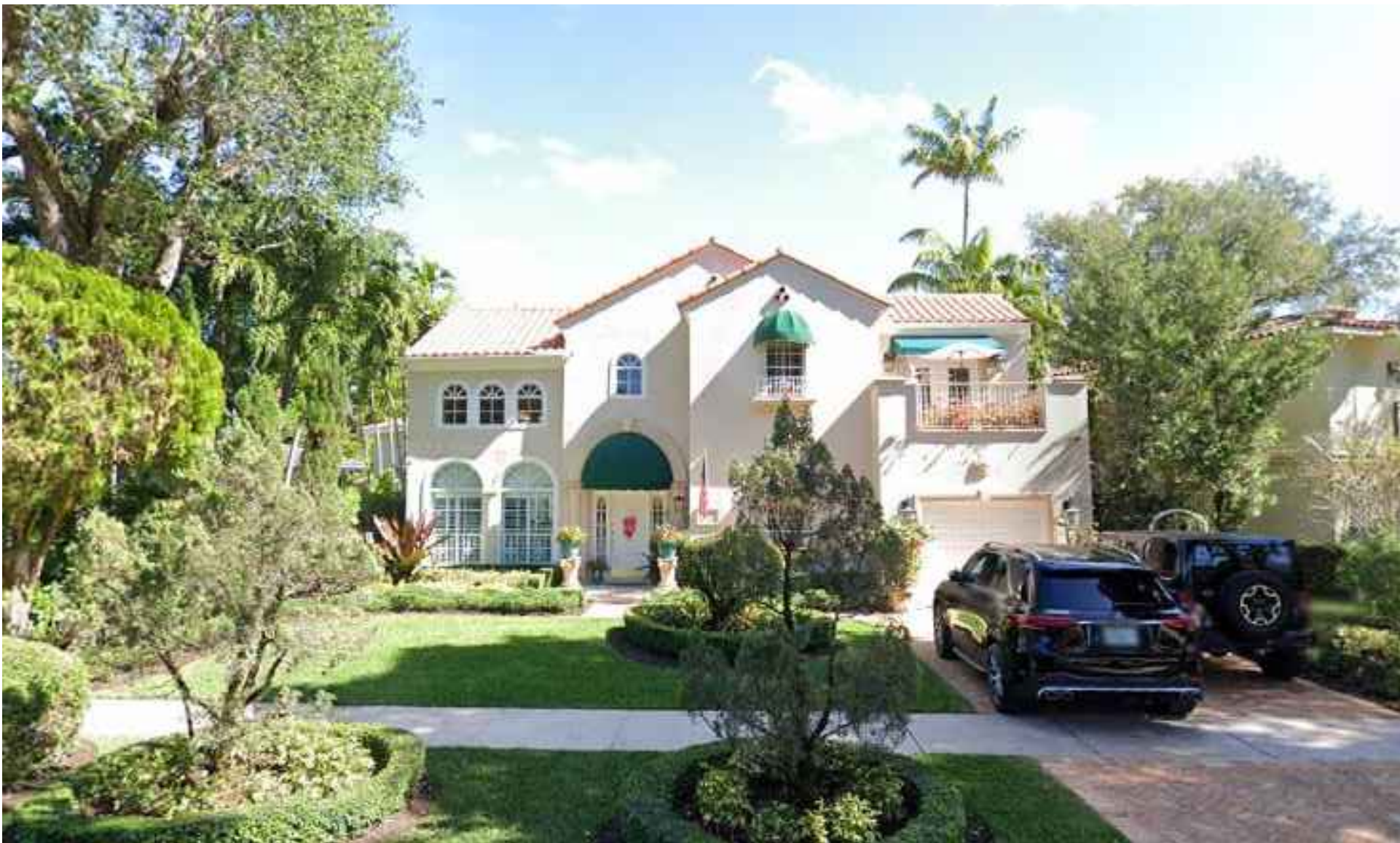
5. DIRECTLY IN FRONT OF PROPERTY