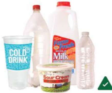
Plastic Bottles, Cups & Containers