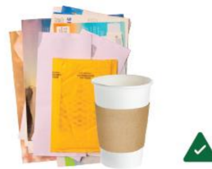
Paper & Paper Cups