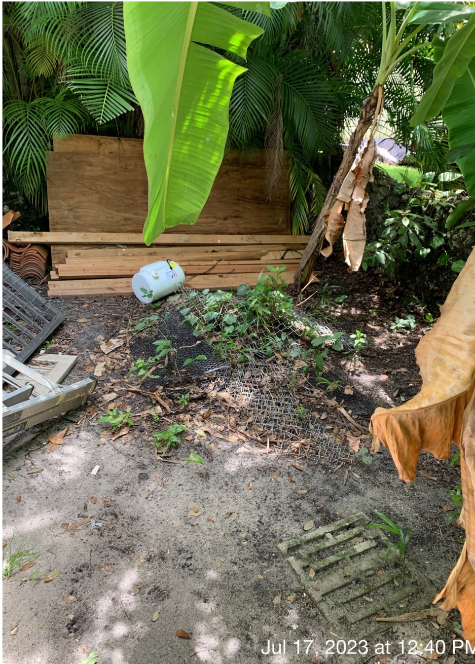
Jul 17, 2023 at 12:40 PM