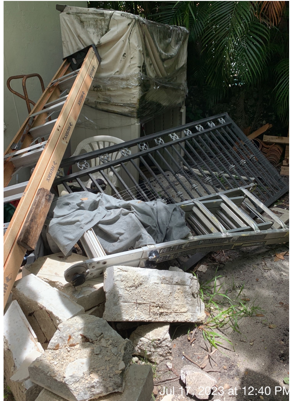
Jul 17, 2023 at 12:40 PM