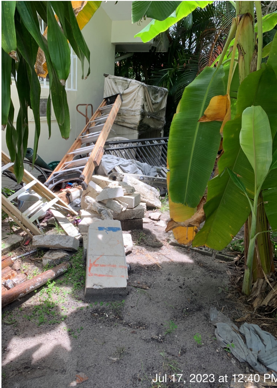
Jul 17, 2023 at 12:40 PM