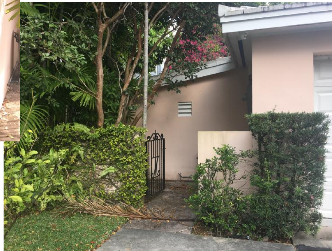
North & Front Façade – Before