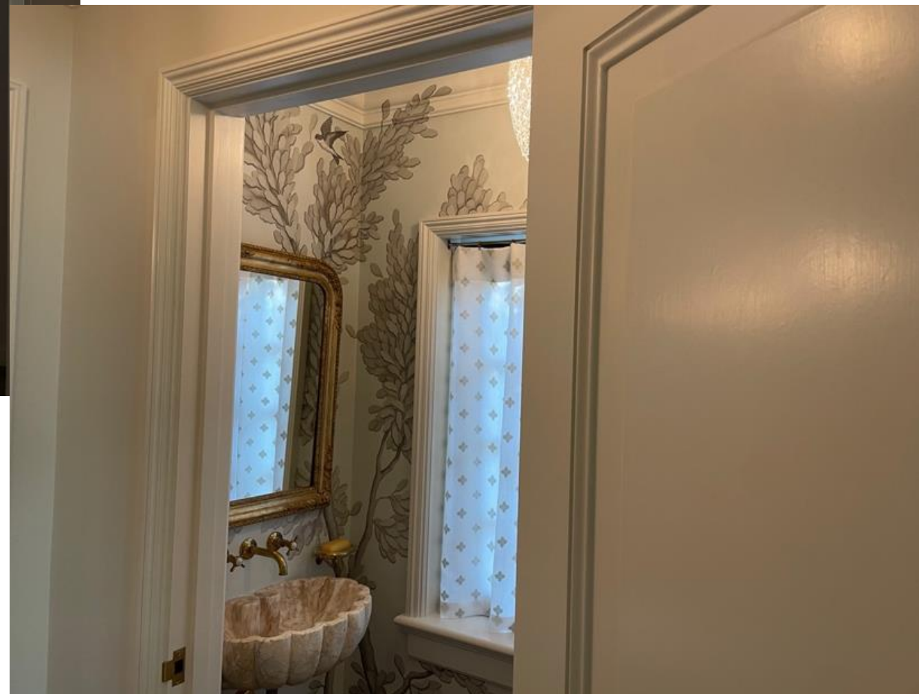
Vestibule – Before & After