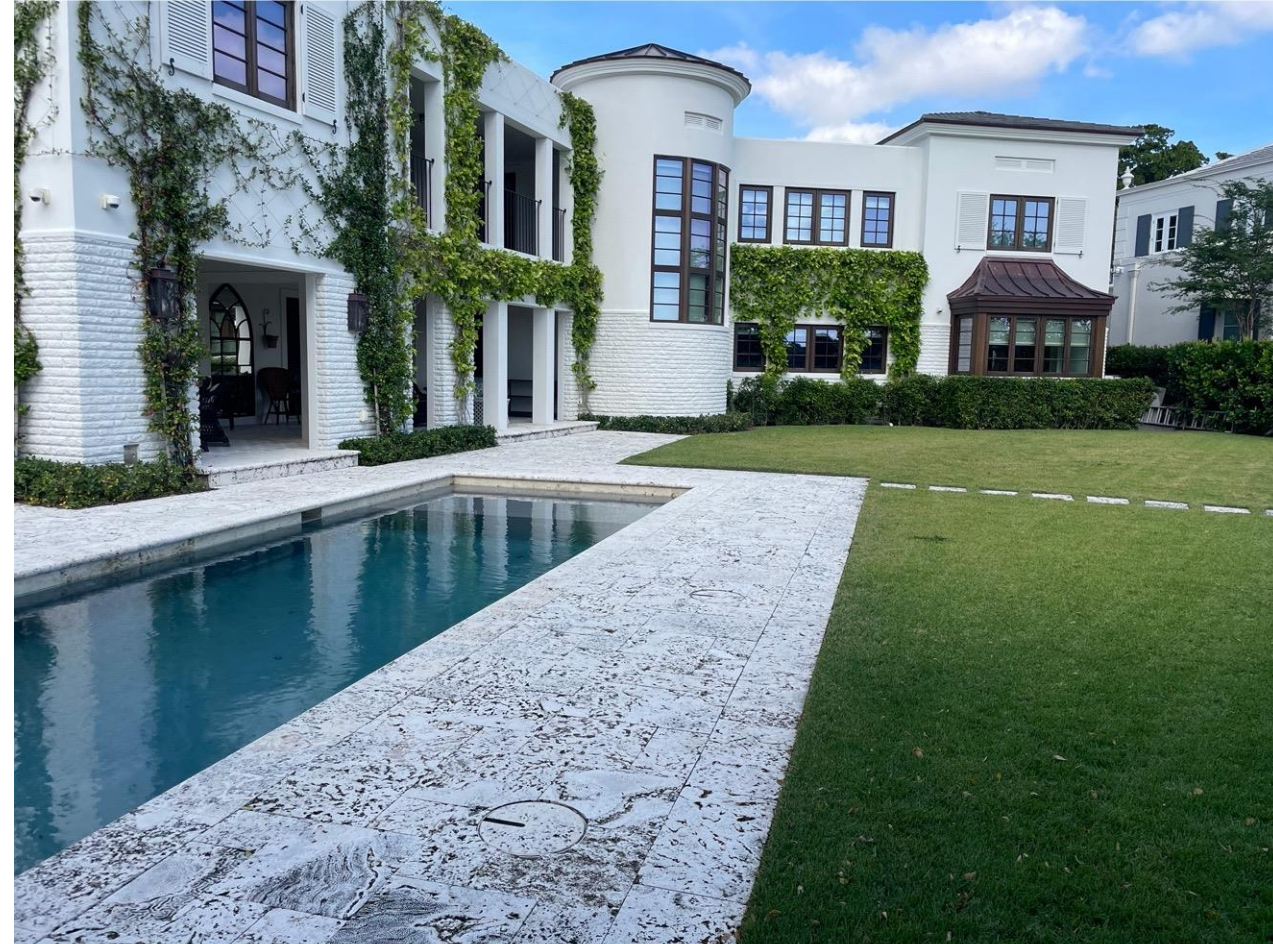
Rear Façade – After