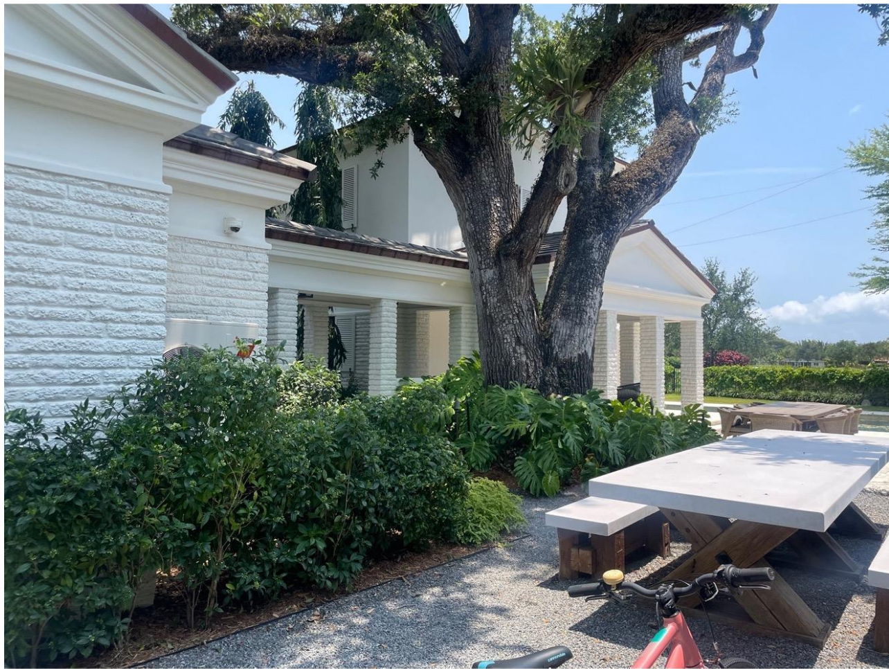
North & South Façade – After