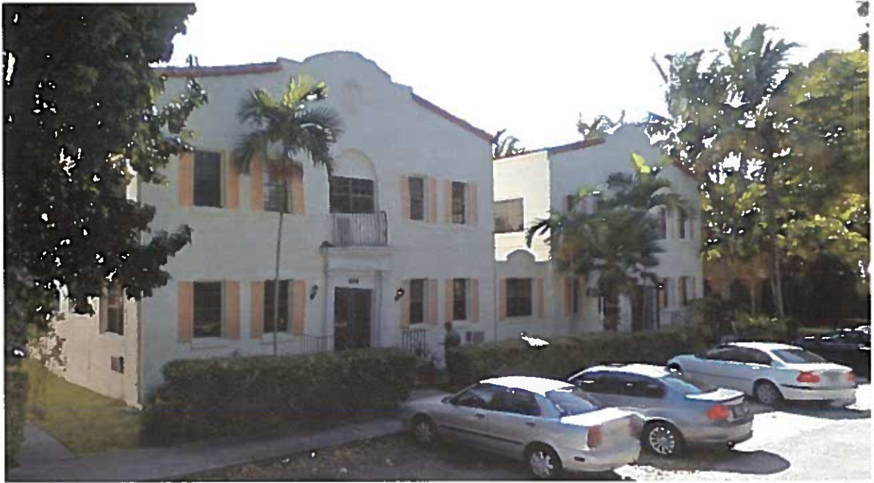
624 Santander Ave