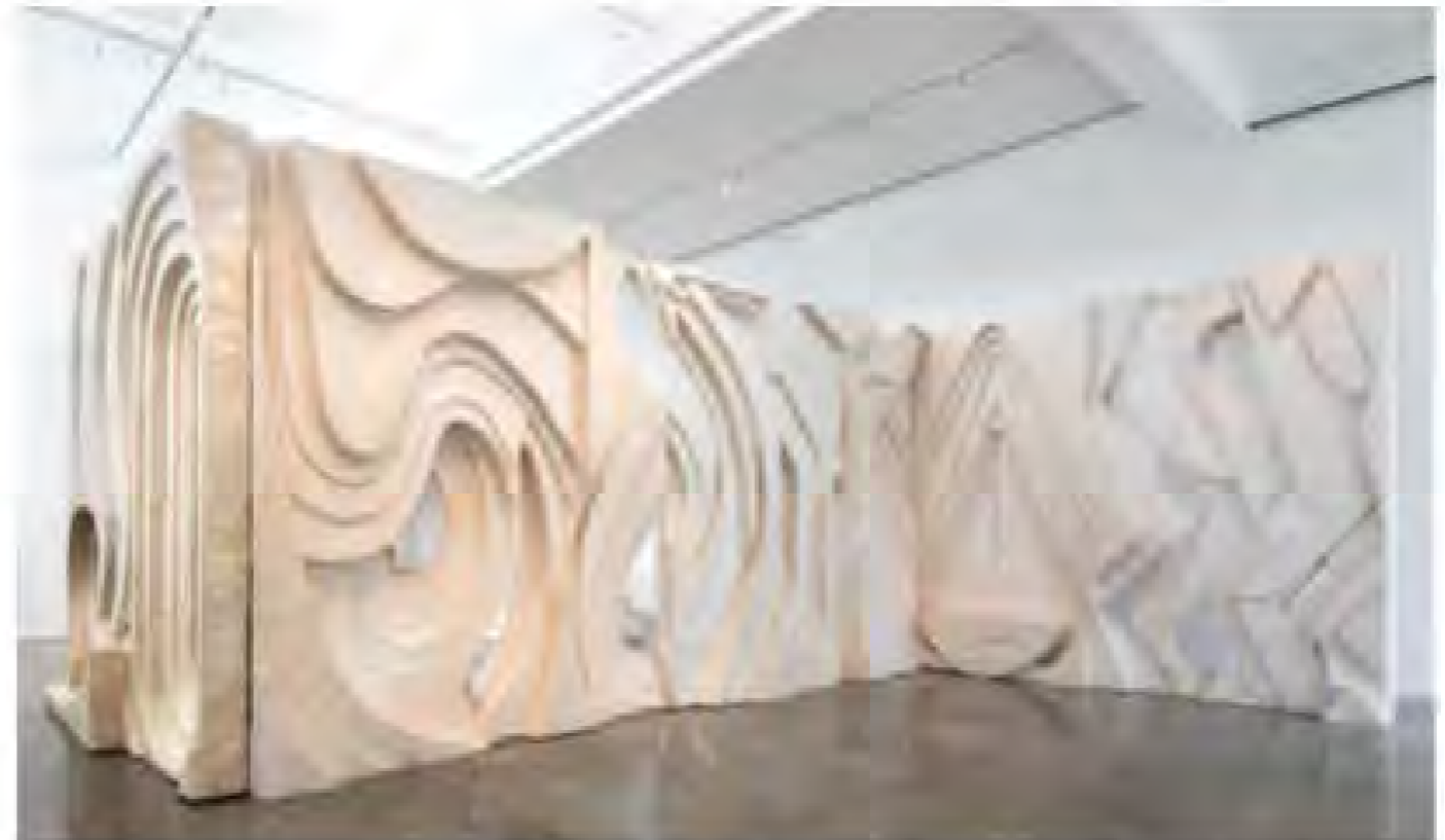
Thomas Houseago, Open Wall (Beautiful Wall), 2016, installation view at Gagosian, Beverly Hills.

In 2008 Thomas Houseago moved to Los Angeles, where he found an industrial space with even more room than he maybe needed. But if you've seen his work (and we're sure you have), that kind of sculpture and scale needs square footage—to be made, to be seen, to be felt. Around ten years later, he has certainly found his groove there—a balance of work, socializing with friends and family, and loving that Los Angeles light.