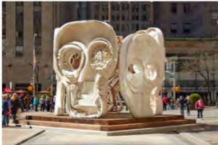
[Thomas Houseago. Masks (Pentagon) , 2015. Tuf-Cal, hemp, iron rebar, steel, redwood. 18' 75" x 23' 1.125" x 24' 3.5". Courtesy of the artist and Gaussian Gallery. Organized by Public Art Fund and Tishman Speyer]

Fierce yet fragile, and hauntingly human, sculptor Thomas Houseago's skull-like masks could be ancient relics from a future civilization. So to stumble upon five of the monumental faces in the middle of Manhattan's bustling Rockefeller Center is a shock. Houseago's powerful new site-specific installation, Masks (Pentagon) —on view from April 28 through June 12—is the latest work in the Public Art Fund's stellar contemporary art program.