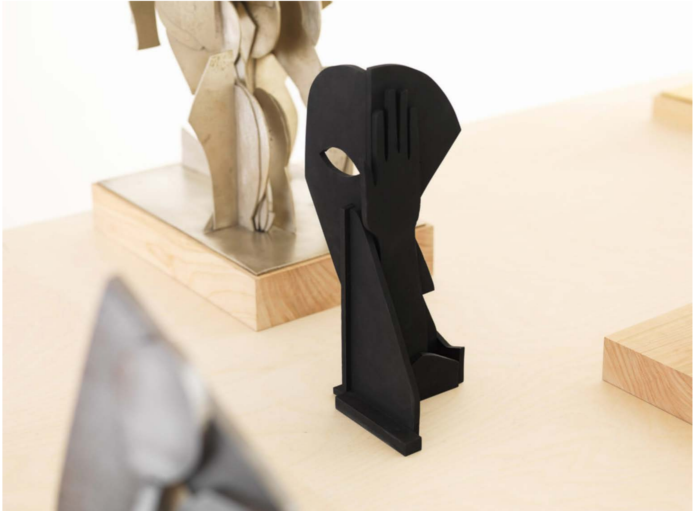
Table top mock rendering of the proposed sculpture