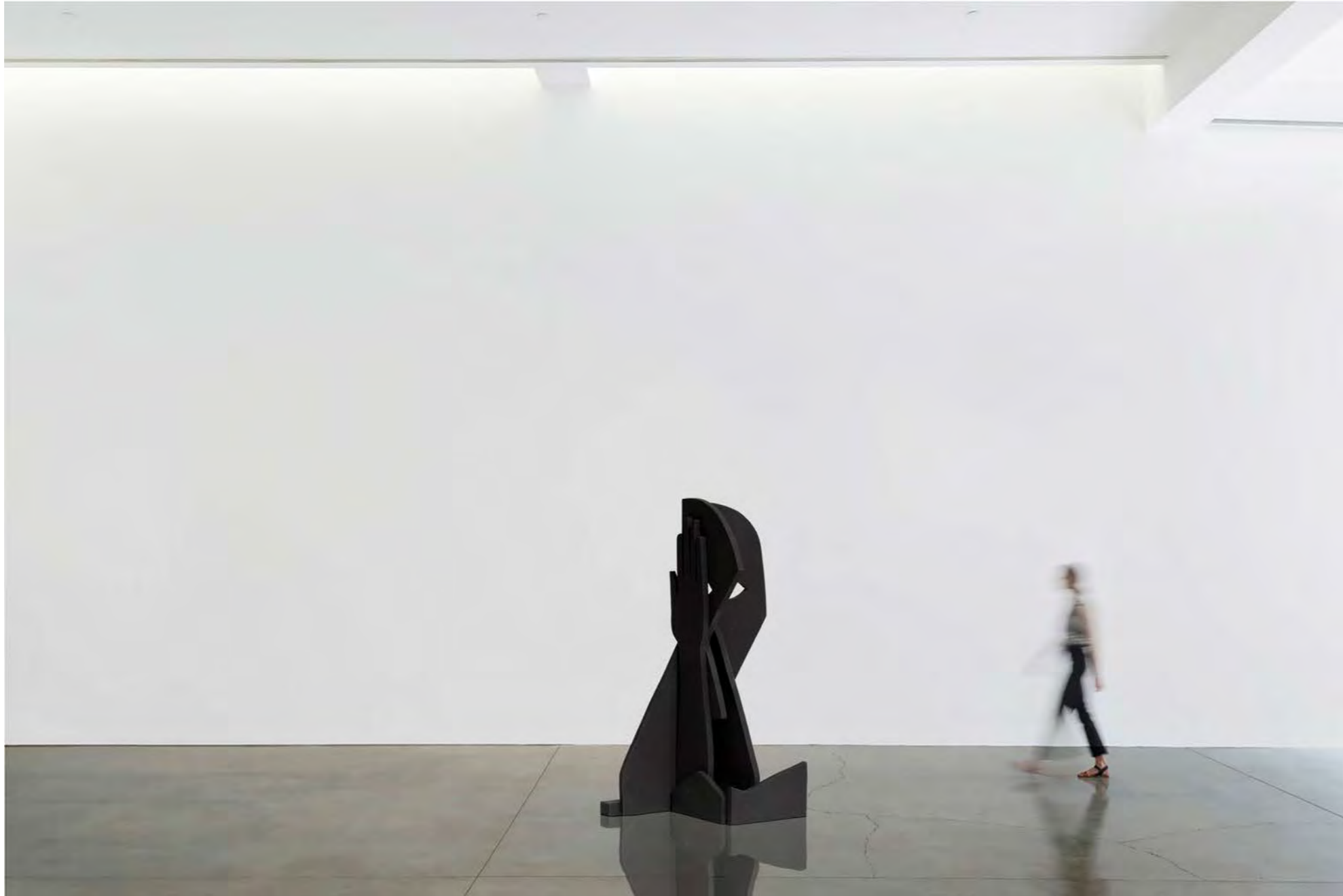
EXAMPLE OF SCALE