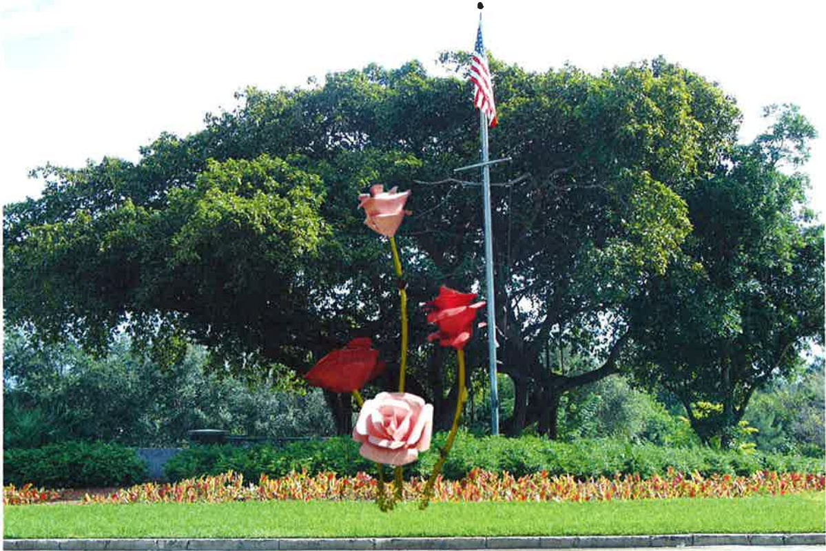
EXHIBIT A SCULPTURE "The Roses", Will Ryman