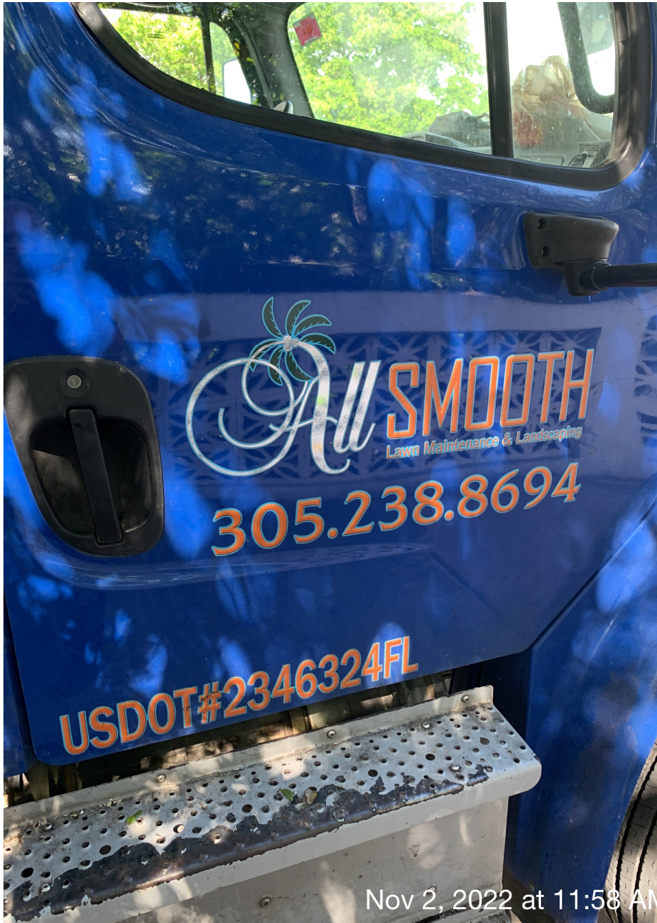
Nov 2, 2022 at 11:58 AM